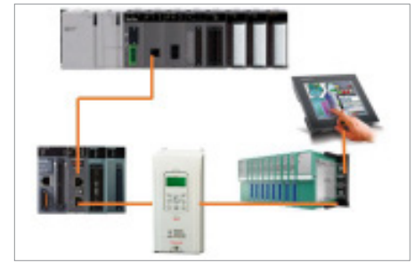
Figure 3: Linear Topology

A combination of I/O modules for ML200&ML50 and Ethernet/IP devices can be connected to the CPM, providing engineers with an additional level of flexibility on I/O network design.