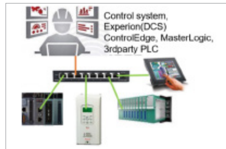
Figure 2: Star Topology

an HMI panel, and interface modules based on serial communication. Smart Remote Adapter can be efficiently integrated due to connectivity based on standard open protocol. Engineers get a wide range of design choices, be it for topology, vendor, specifications or connection media, to deliver a solution to fit application requirements. Standard data models for accessing the process and device information significantly improve information available for controls and diagnostics.