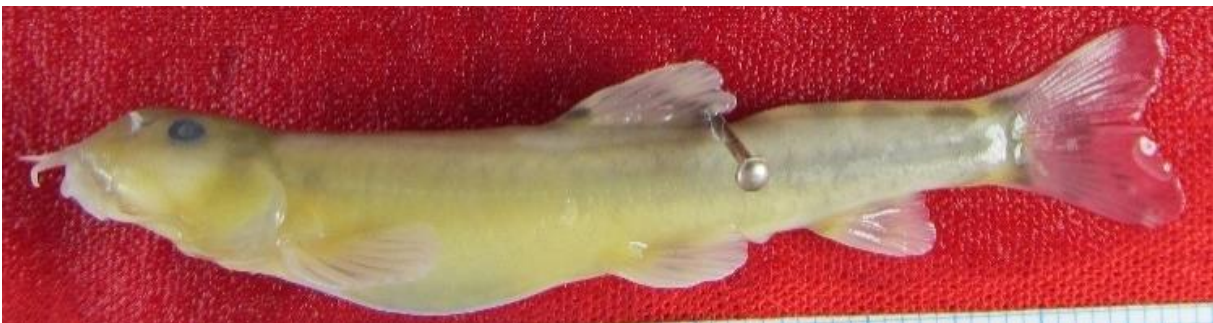
Fig. 2. Paraschistura cristata (Turkmenian Crested Loach) from Abghad. SL: 59.2 mm.