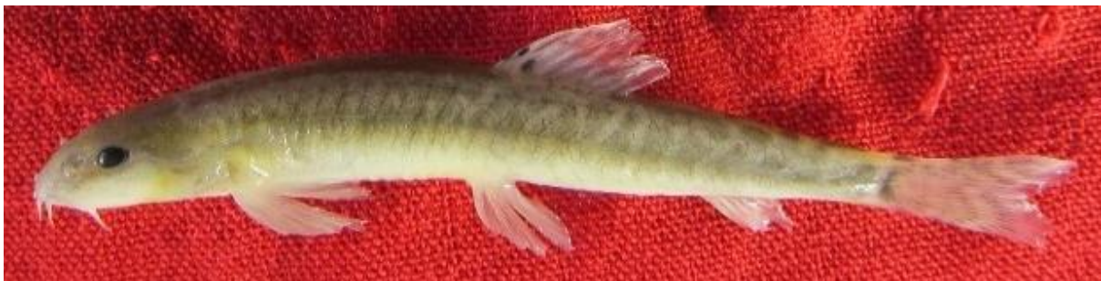
Fig. 1. Paraschistura turcmenica (Sarhadd Loach) from Abghad. SL: 40.5 mm.