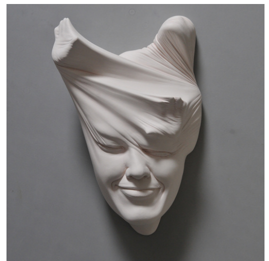
ARTWORK BY JOHNSON TSANG