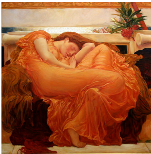
FREDERIC LEIGHTON, FLAMING JUNE