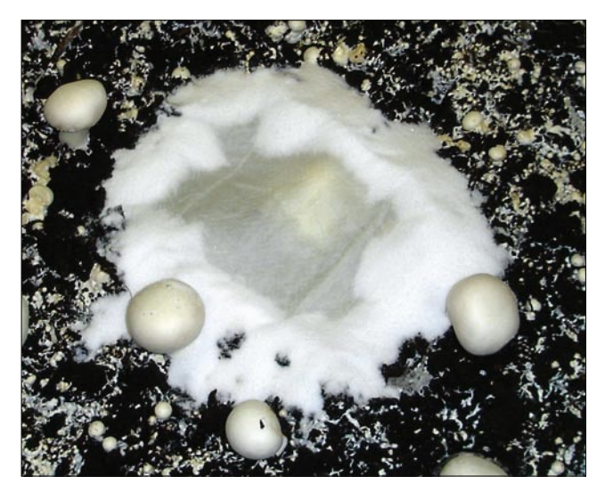
7 Edge completely sealed