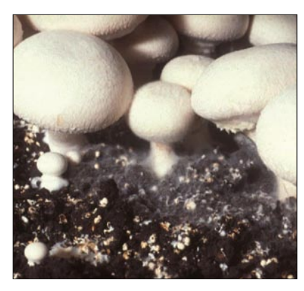
2 Cobweb becoming visible on casing

is seen when an original patch of Cobweb has been overlooked. It is not possible to distinguish spots caused by Cladobotryum from those caused by Trichoderma and some other pathogens so laboratory identification may be necessary. Diagnostic services are available from the CSL Plant Clinic in the UK and Teagasc in Ireland – See Further Information on page 4.