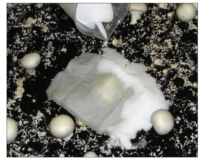
6 Sealing the edge of the tissue first