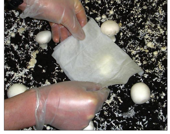
5 Careful placing of tissue

Prochloraz (Sporgon 50WP) is still moderately effective against a wide range of Cladobotryum isolates. It will not prevent cap-spotting symptoms from developing if spores land on mushrooms but it will slow down the growth of Cobweb on the casing. Due to this partial effectiveness it is particularly important to achieve accurate dosing and delivery of the fungicide and to be aware of the possibility of prochloraz degradation as the crop progresses. It will still be necessary to identify any Cobweb patches that do occur and to treat them with salt as described to prevent spotting symptoms and further spread of the disease.