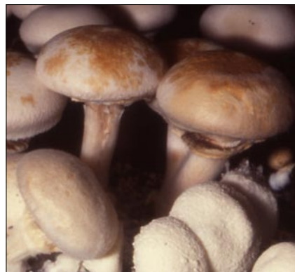
4 Cap spotting caused by Cobweb