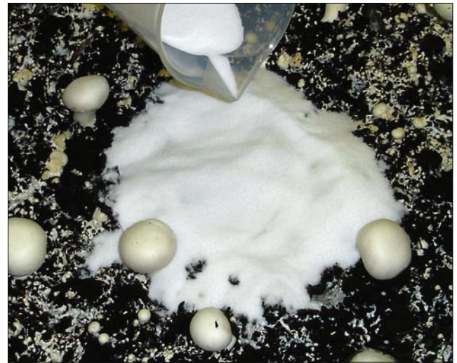
8 Finally covering the tissue