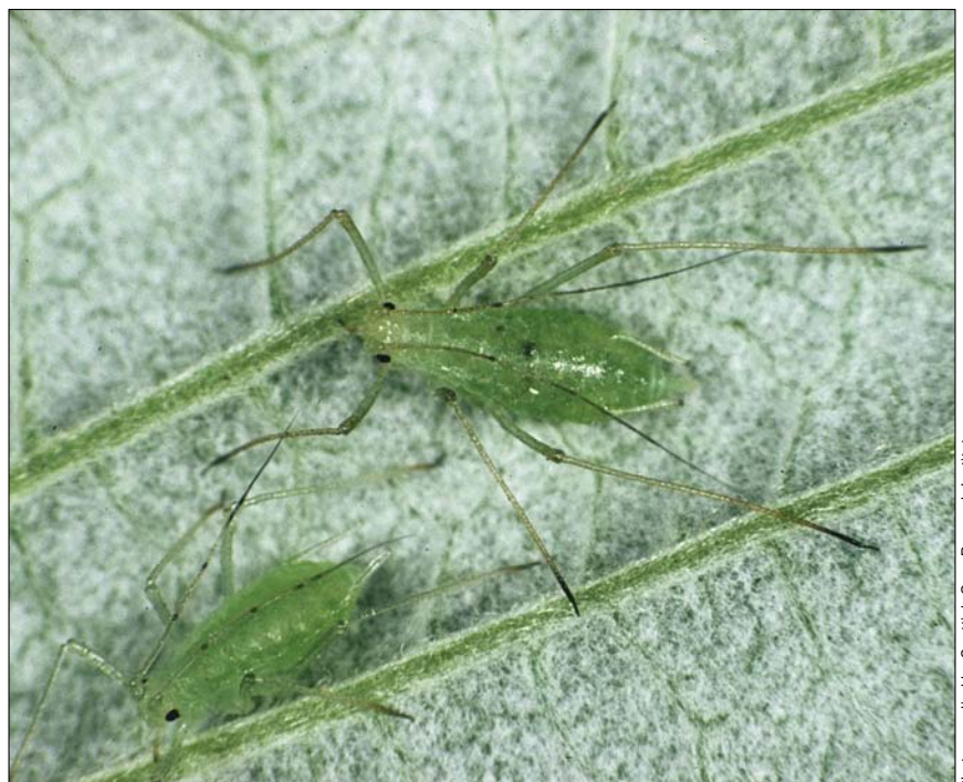
1 Large raspberry aphids ( Amphorophora idaei ) on underside of raspberry primocane leaf

Eggs laid the previous autumn hatch in March/April and develop into asexual female aphids which feed on the tips of developing buds and laterals, often those located on the tops of the fruiting canes. At first they can be very difficult to detect due to their small size. As the summer progresses the spring adults give rise