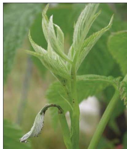
7 Adult common green capsid ( Lygocoris pabulinus )