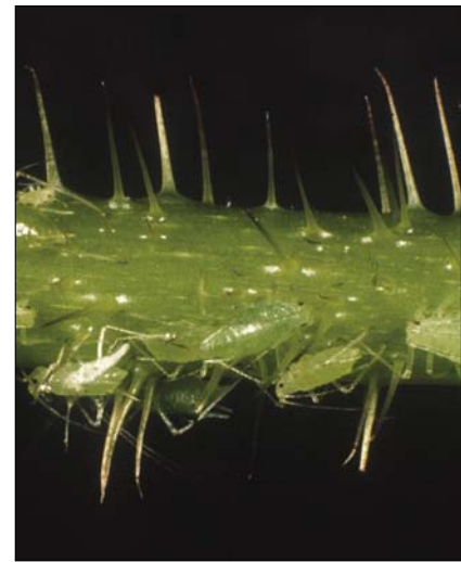
2 Part of colony of the large raspberry aphid on raspberry primocane stem

aphid populations. Table 2 provides information on the resistance incorporated into modern day raspberry varieties.