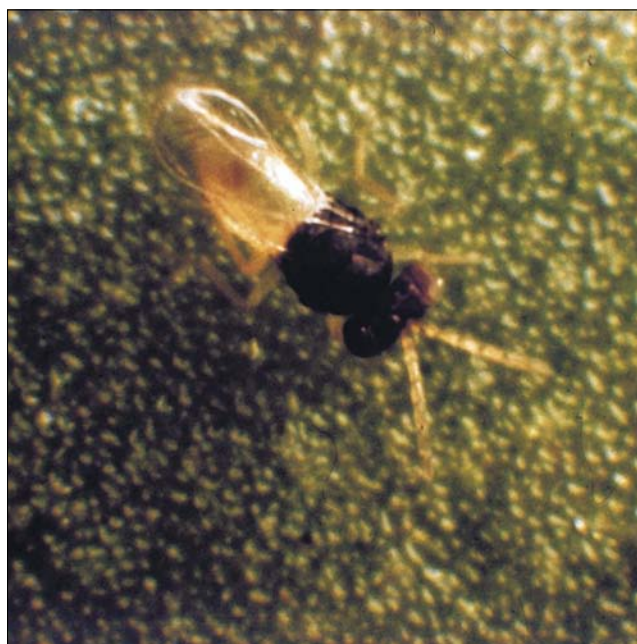
18 Parasitic wasp ( Encarsia formosa ) adult