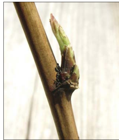
4 Small raspberry aphid eggs

The peach-potato aphid is confined primarily to protected raspberry crops. The adults are small, green, or occasionally reddish green in colour (Figure 6). This aphid is found feeding on the undersides of raspberry foliage during the spring months, later dispersing to a wide range of other host plants including many weed species, and crops such as potato, sugar beet and oilseed rape. It is not considered to be a major virus vector of raspberry.