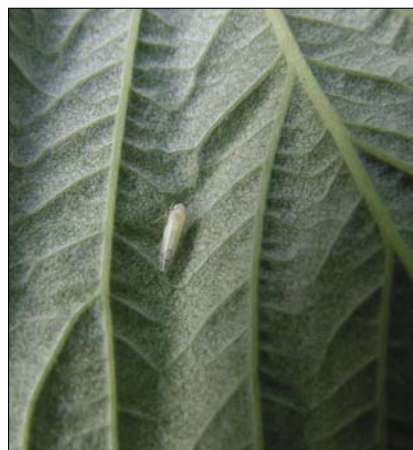
11 Adult leafhopper

marks about the size of a pin-head (Figure 12). Leafhopper damage can