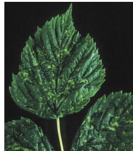
3 Raspberry leaf spot virus (RLSV) infected raspberry leaf