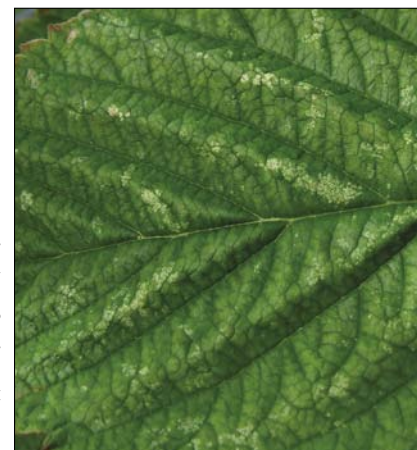
12 Leafhopper damage to raspberry leaf