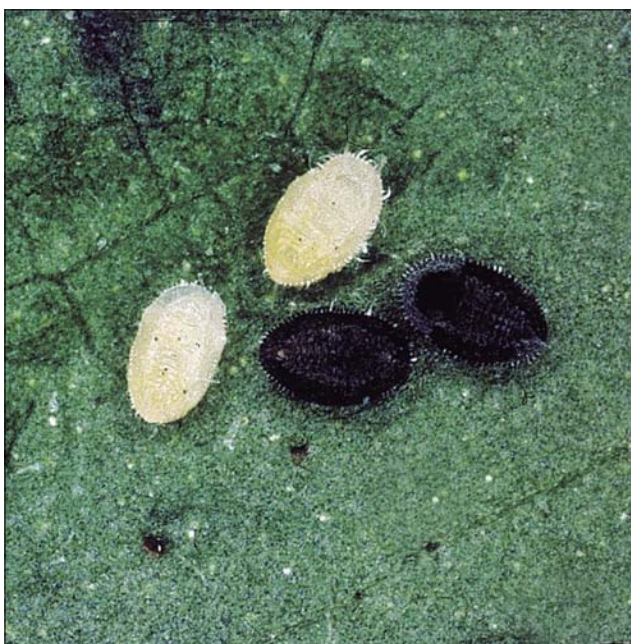
19 Parasitised and unparasitised whitefly scales