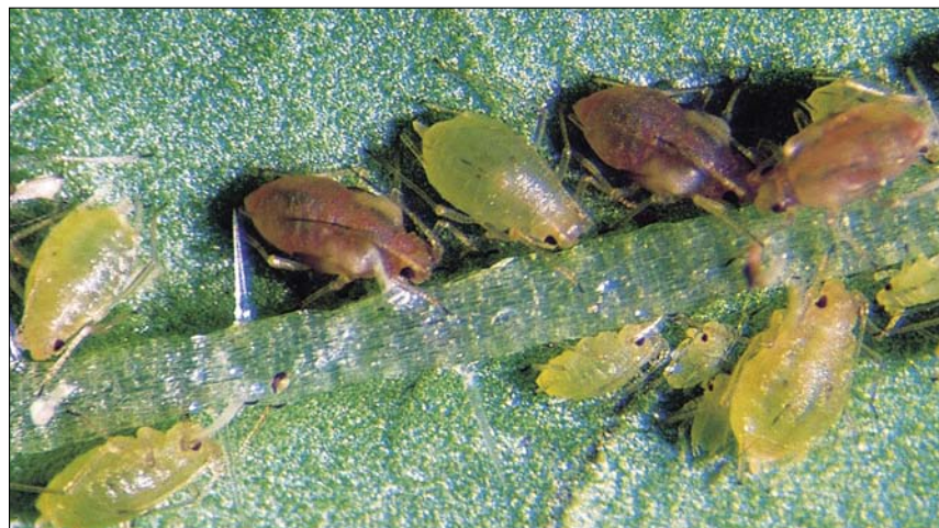
6 Colony of peach-potato aphid ( Myzus persicae )