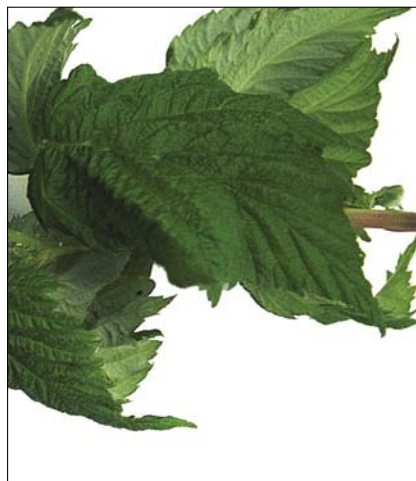
5 Distortion of primocane caused by colony of the small raspberry aphid ( Aphis idaei )

The dense colonies that appear in spring can cause extensive leaf curling on primocanes and developing fruiting laterals (Figure 5). Ants may be found associated with colonies of this aphid,