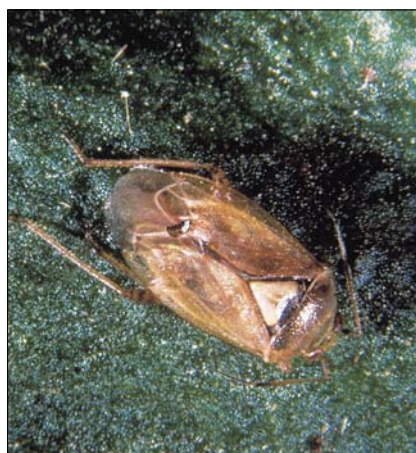
9 Adult tarnished plant bug ( Lygus rugulipennis )

The European tarnished plant bug tends to forage on developing flowers in all cane fruit crops and is associated with fruit malformation and distortion. These insects are slightly smaller than the common green capsid (approximately 4.5–5 mm in length) and the adults are dusky brown in colour and often have a distinct inverted pale triangular mark behind the pronotum. (Figure 9).