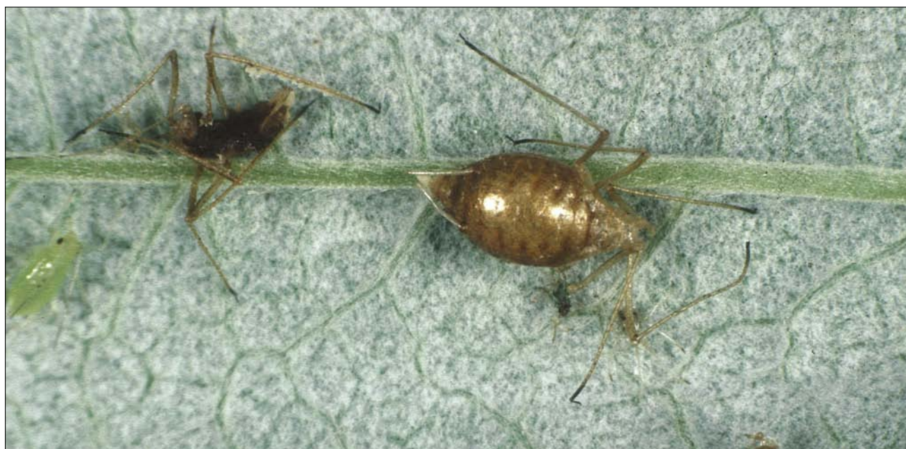
17 Parasitised large raspberry aphid on the underside of raspberry leaf