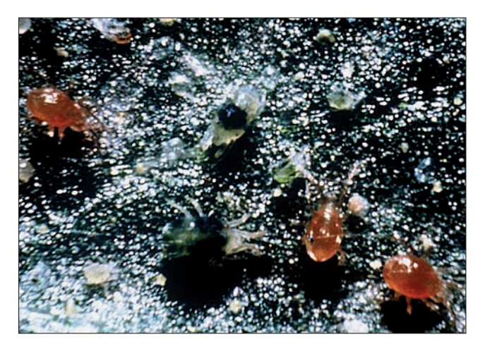
12 Phytoseiulus persimilis is heavily relied upon for two-spotted spider mite control

There are a range of commercially available predatory mites and a predatory midge for use in biological control programmes (Table 4), but there are also several predators that occur naturally outdoors (Appendix 1) that can supplement the control of pest mite species.