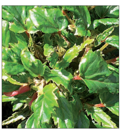
5 Intense leaf distortion in begonia, a result of the toxic saliva of broad mites