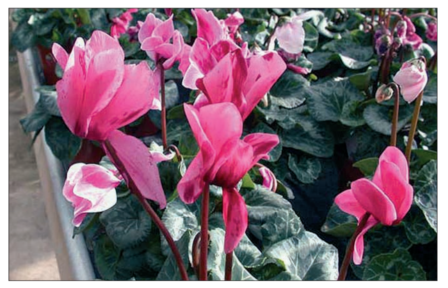
1 Flecking on the petals of plants is a typical symptom of cyclamen mite

are less common, and as a result are often not recognised. The information in this factsheet will aid their identification and control. New mite species such as the fuchsia gall mite will also be covered in this publication.