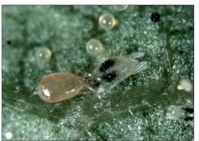
13 Amblyseius californicus can be used to supplement Phytoseiulus for two-spotted spider mite control during summer months