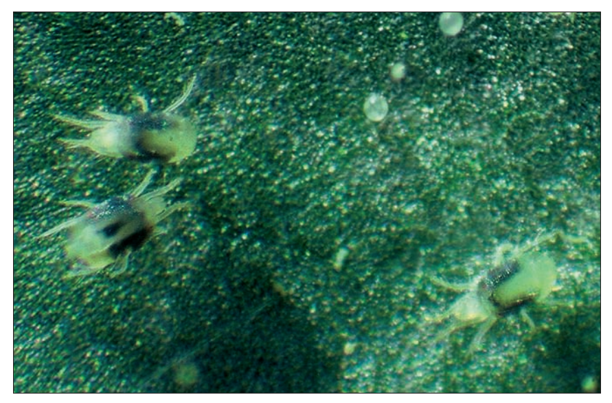
2 Adult two-spotted spider mites, nymphs and eggs on the lower leaf surface

The mites occur on the underside of young expanding leaves or within