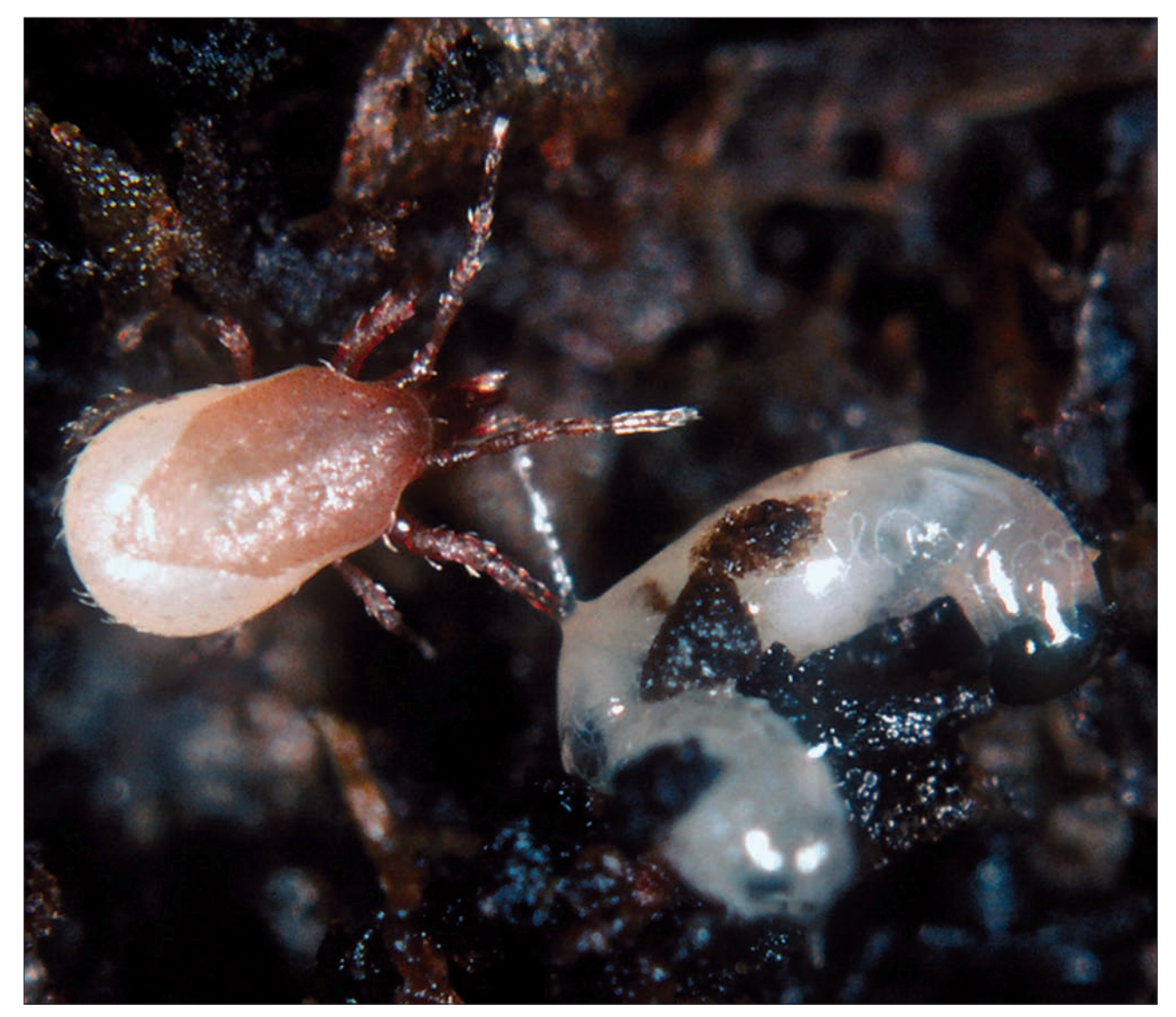
16 Hypoaspis species may attack and give some control of Tyrophagus within the growing media