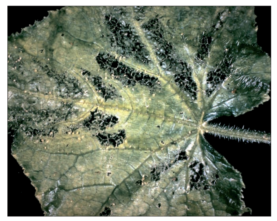
9 Damage to cucumber leaf as a result of feeding by Tyrophagus

The fuchsia gall mite is sausage shaped, pale cream in colour and only 0.2–0.25 mm in length (Figure 10). Huge numbers of mites can build up in the shoots and growing points of plants, but this species is specific to fuchsia and cannot damage any other plant genera. When plants are first infested, little or no damage is visible, so cutting material can be moved within the trade unwittingly, thus spreading the infestation.