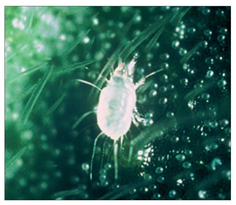
8 Adult Tyrophagus mite - such mites are difficult see without the aid of a hand lens or microscope