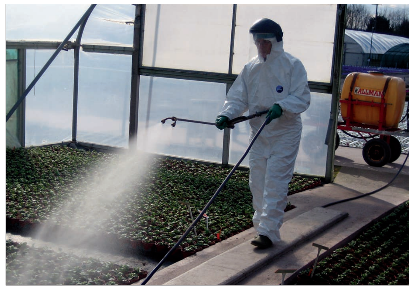
17 Growers must realise that the use of specific off-label approvals (SOLAs) is entirely at their own risk