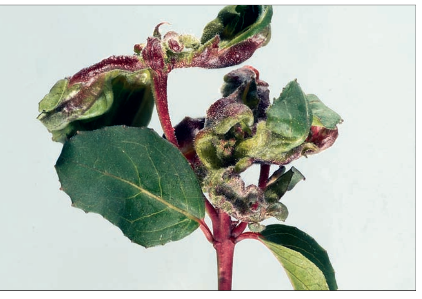
11 Distortion to the growing point of fuchsia as a result of the fuchsia gall mite

However growing points and new leaves eventually become distorted as a result of feeding (Figure 11). Therefore, propagators need to be fully aware of this pest and have their stock plants tested for it at regular intervals by a reputable laboratory. For further details on the biology and recognition of this damaging pest, go to the Defra Plant Health Division website link at http://www.defra.gov. uk/planth/pestnote/fuchsia.pdf