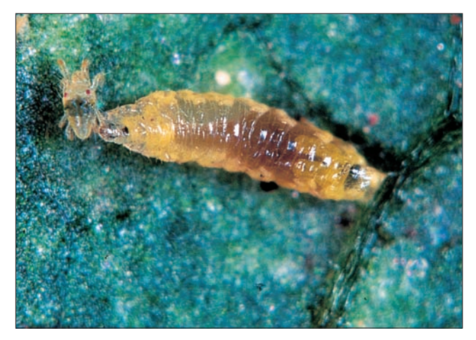
14 Larva of Feltiella acarisuga which can be used to eradicate hot spots of spider mite