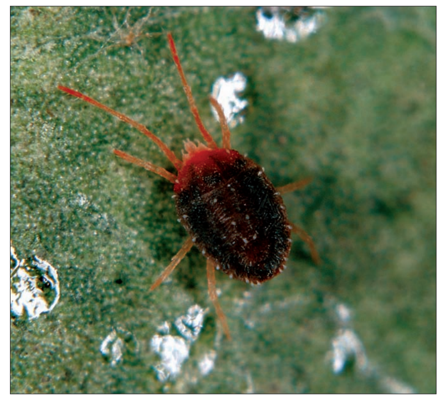
7 Adult Bryobia mite with distinctive long front legs

This species feeds inside the growing points, flower buds and young leaves of plants, piercing