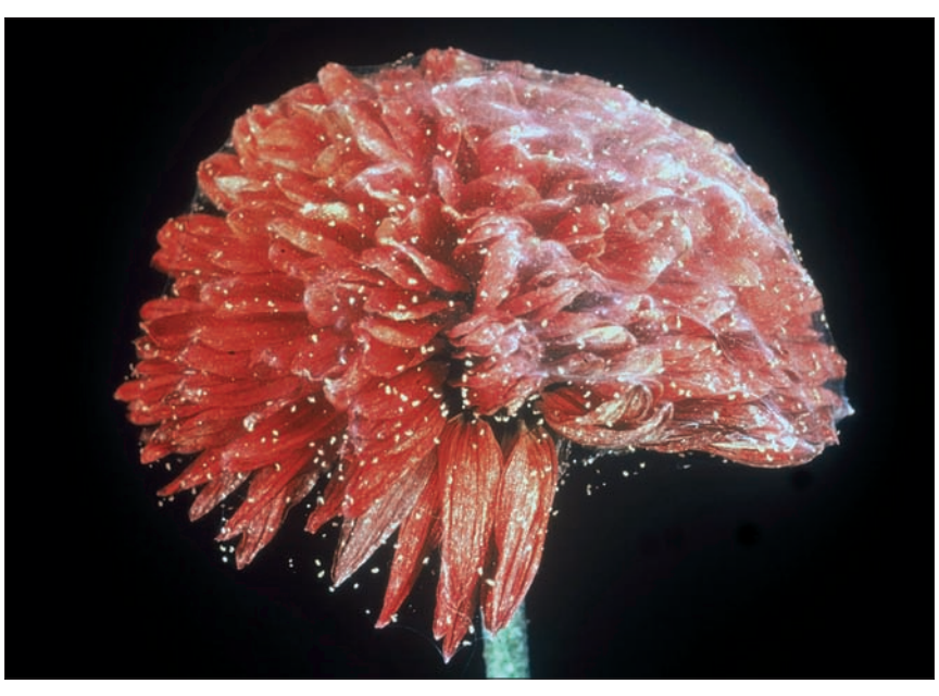
3 Webbing on flowers and growing points aids the dispersal of mites