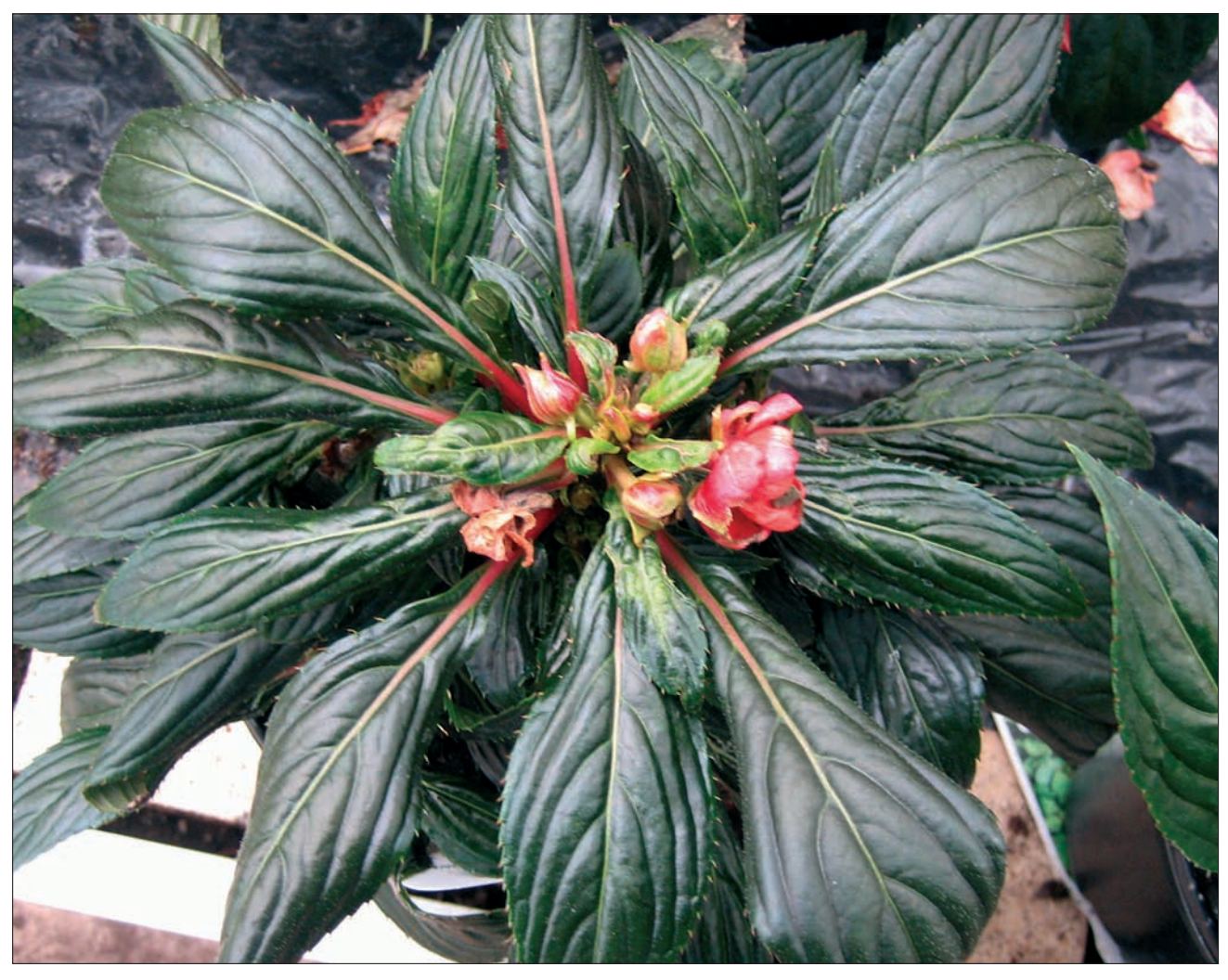
6 Distortion to the growing point and young leaves of New Guinea impatiens as a result of broad mite feeding