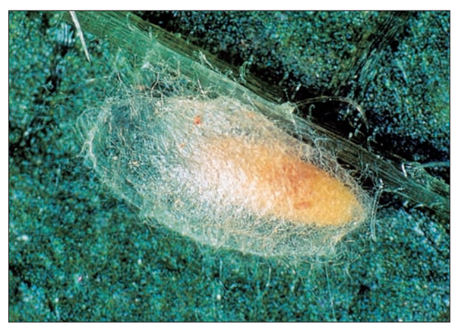
15 Pupa of Feltiella acarisuga. The adult predatory midge emerges from the cocoon