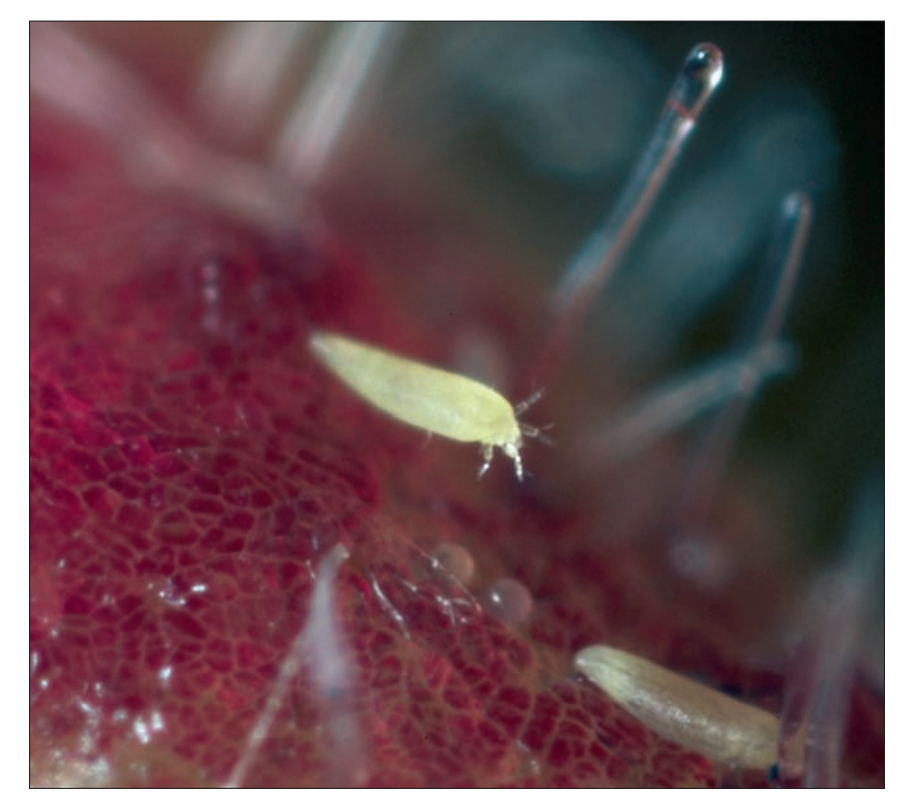
10 Close up image of fuchsia gall mite