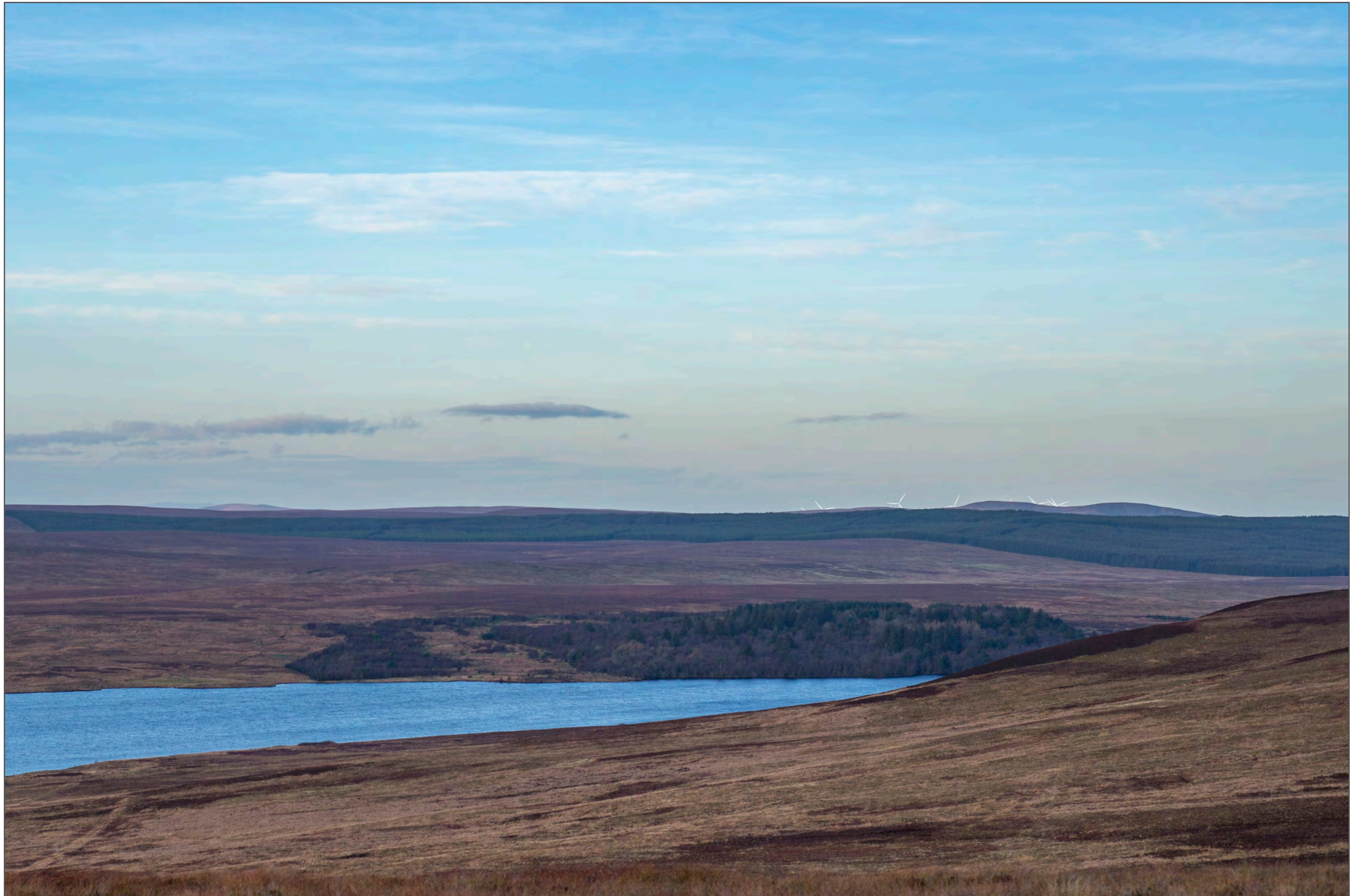
Viewpoint 13 (Figure 6.24k)