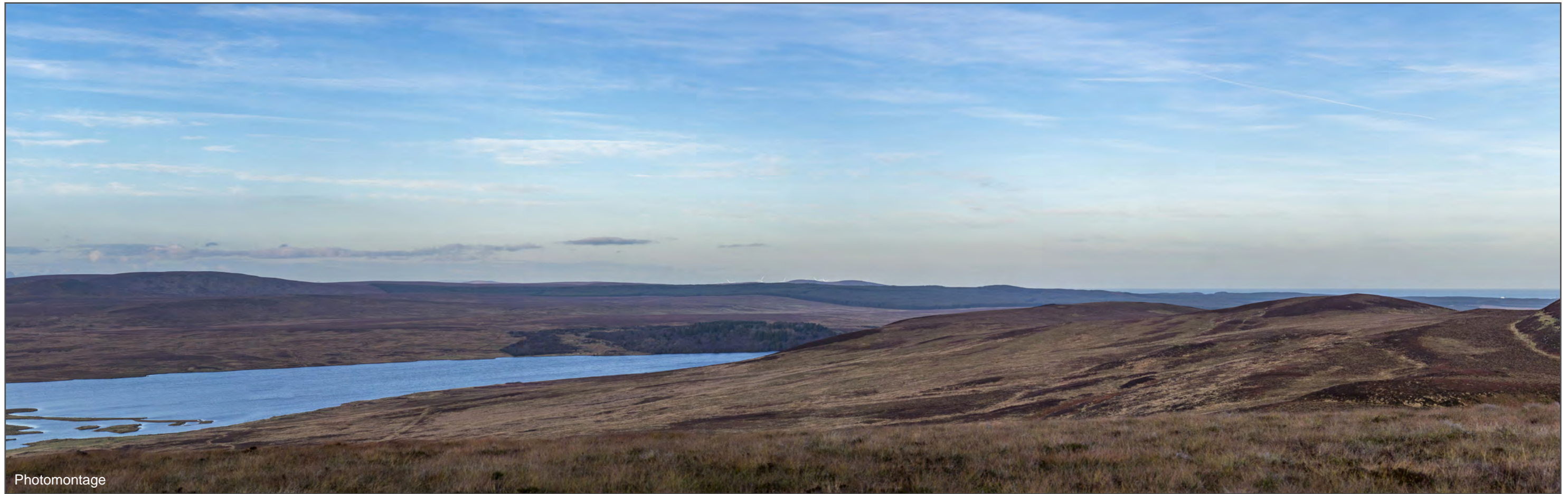
Figure 6.24h Viewpoint 13 Ben Dorrery

Distance to nearest turbine: 15976m Camera: Nikon D610 Focal Length: 50mm vertical (27°) x 28mm horizontal (65.5°) Camera height: 1.5m Date: 21/11/2019 10:40