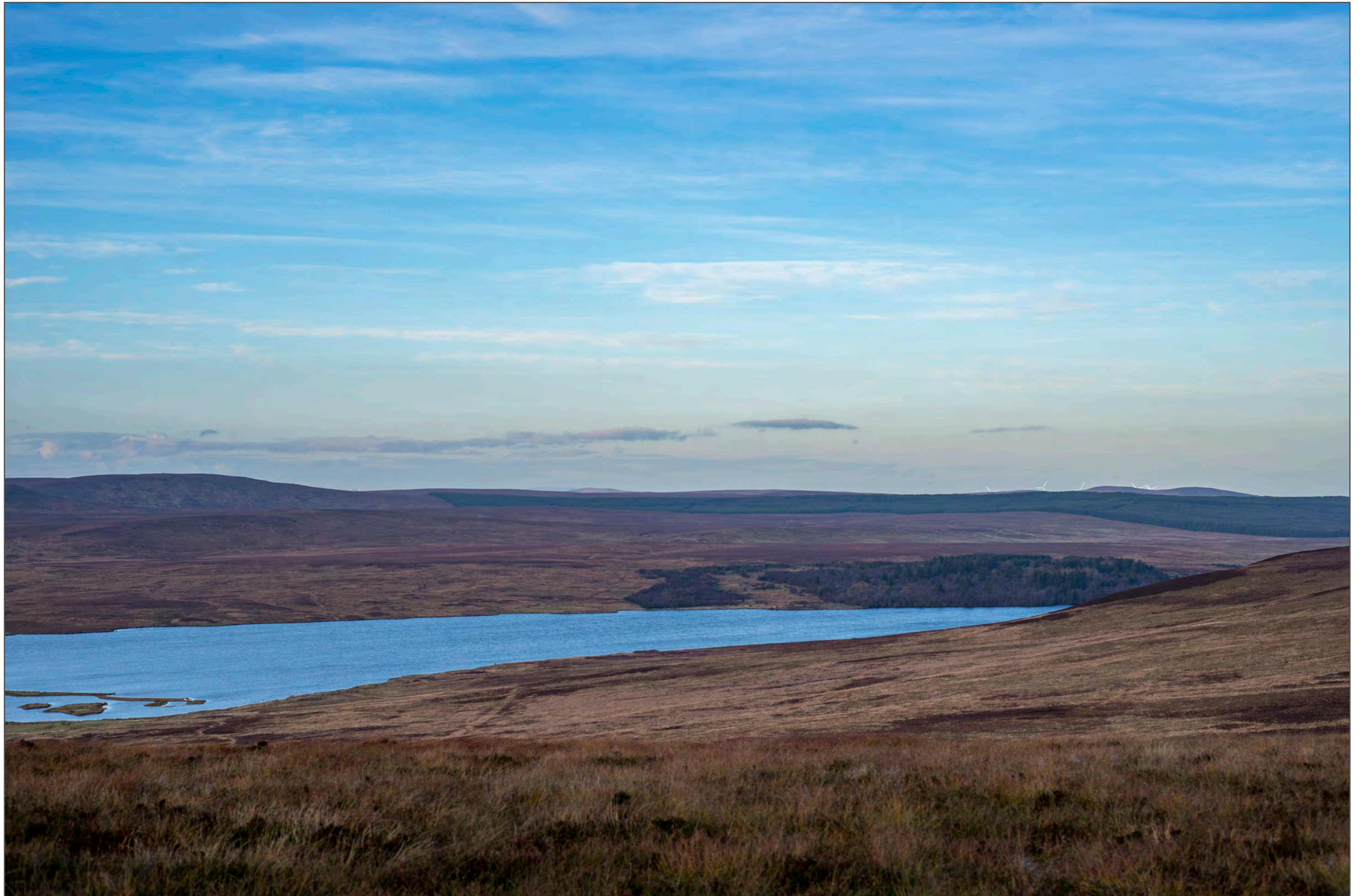
Viewpoint 13 (Figure 6.24j)