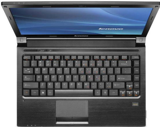
Lenovo IdeaPad V460