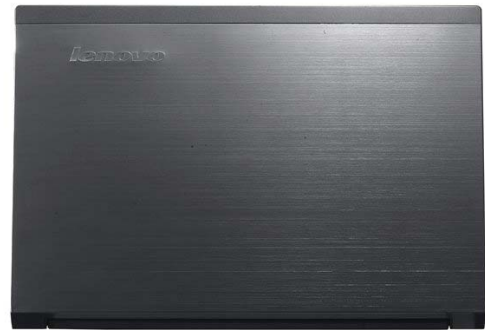
Lenovo IdeaPad V460