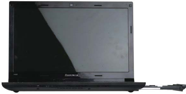
Lenovo IdeaPad V460