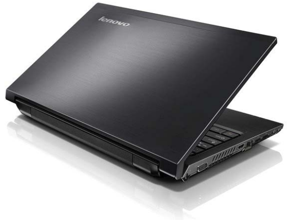
Lenovo IdeaPad V460