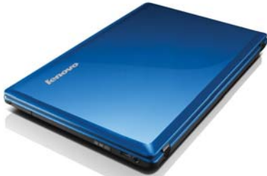
Lenovo G480/G580 Blue (Glossy)