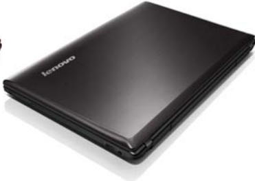
Lenovo G480/G580 Dark Brown (hairline)