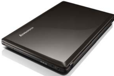
Lenovo G480/G580 Dark Brown (Glossy)