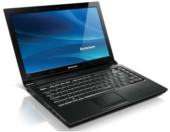
Lenovo IdeaPad V460