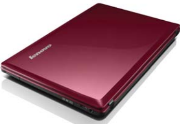
Lenovo G480/G580 Red (Glossy)