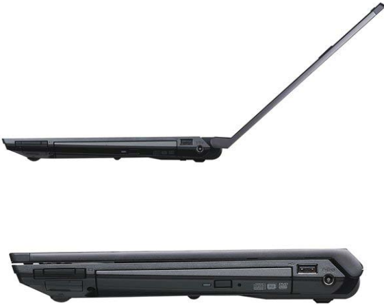
Lenovo IdeaPad V460