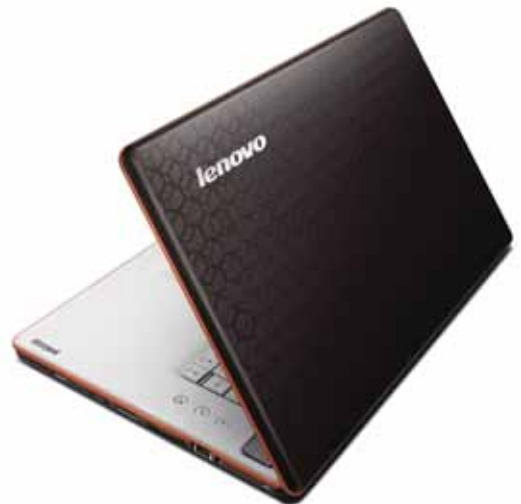
Lenovo IdeaPad Y650