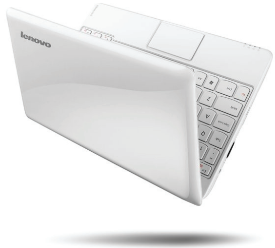
Lenovo IdeaPad S10-3s White