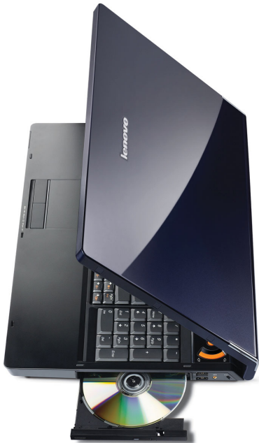
Lenovo IdeaPad Y710