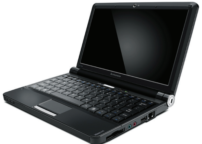
Lenovo IdeaPad S10e