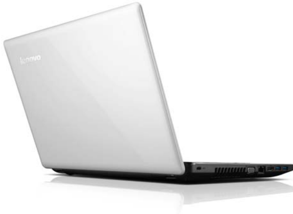
Lenovo IdeaPad Z580 (Enamel white)