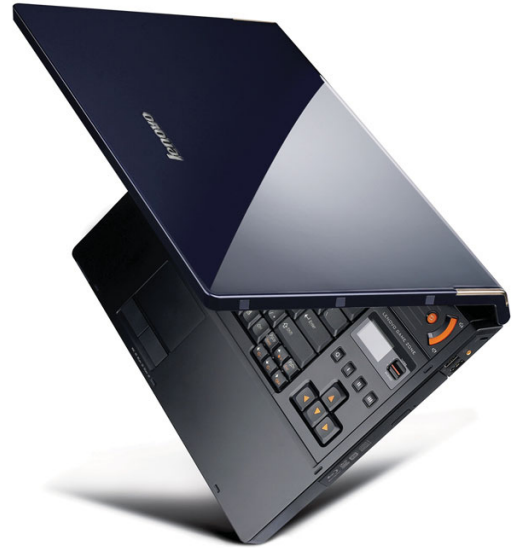
Lenovo IdeaPad Y710 (Game Zone on select models)