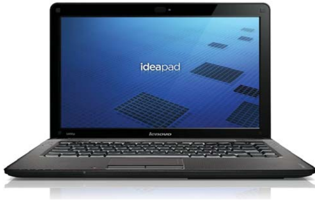
Lenovo IdeaPad U450p