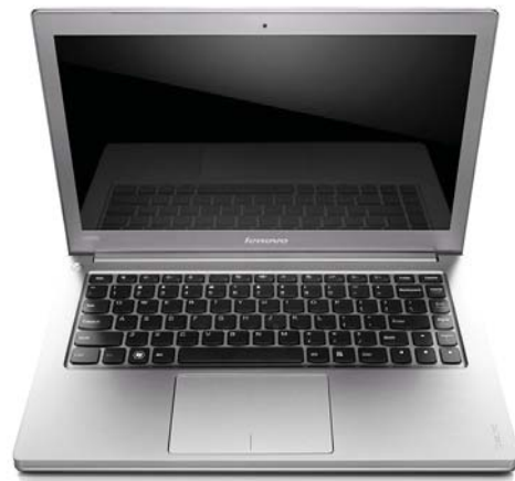
Lenovo IdeaPad U300e (Graphite Gray)