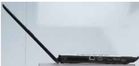
Lenovo IdeaPad Z560