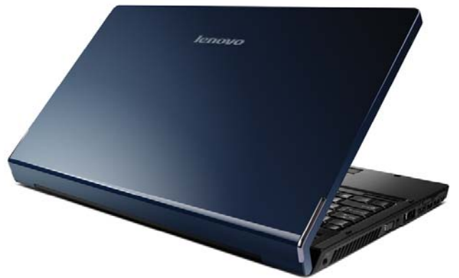
Lenovo IdeaPad Y730 Dark Blue, Glossy Finish