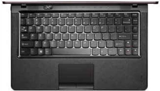
Lenovo IdeaPad U260