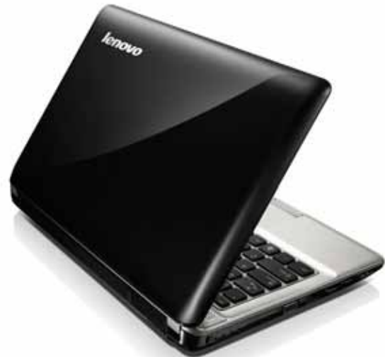
Lenovo IdeaPad Z360