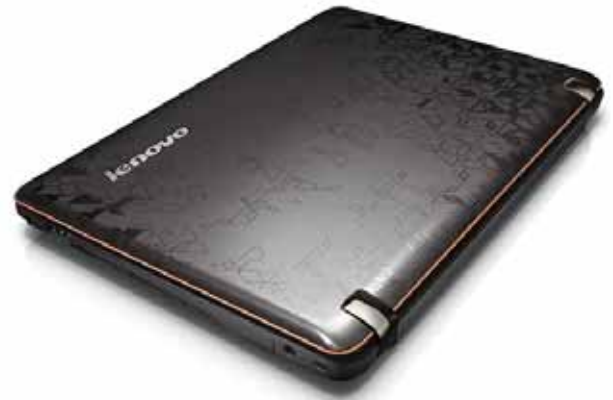
Lenovo IdeaPad Y560