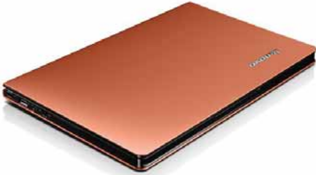
Lenovo IdeaPad U260 Clementine Orange cover