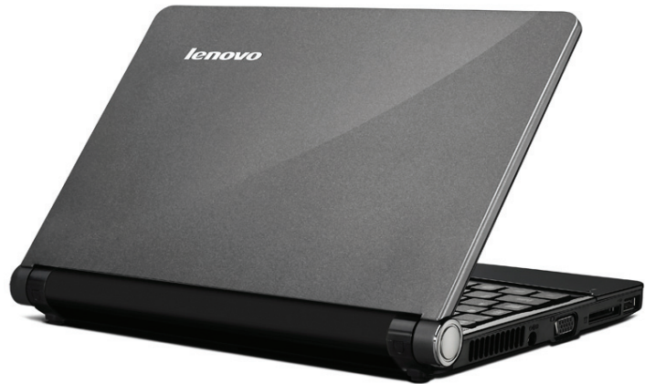
Lenovo IdeaPad S10e