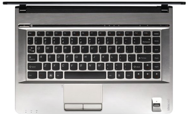
Lenovo IdeaPad U460/U460s