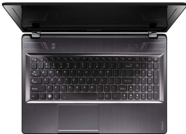
Lenovo IdeaPad Y580