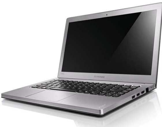
Lenovo IdeaPad U300e (Graphite Gray)