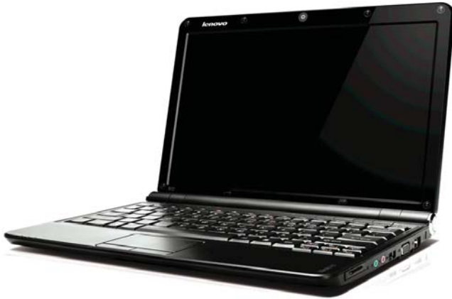
Lenovo IdeaPad S12 (VIA or Intel platform) Black with 3-cell battery