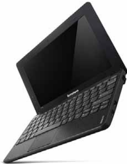
Lenovo IdeaPad S100 Black