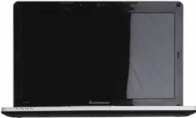
Lenovo IdeaPad U160