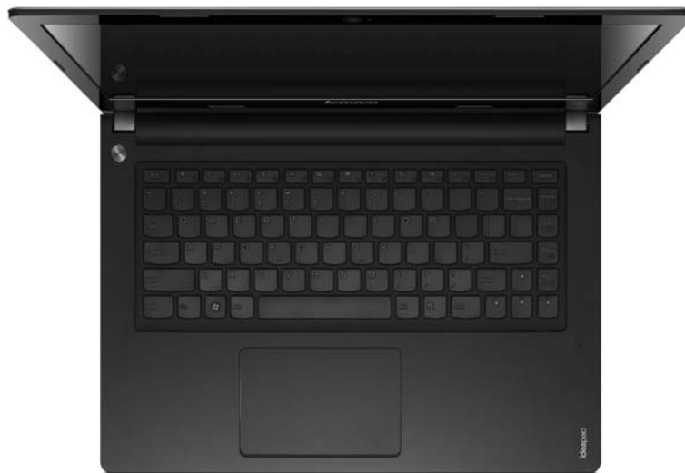
Lenovo IdeaPad 300