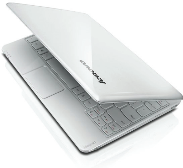
Lenovo IdeaPad S10-3s White