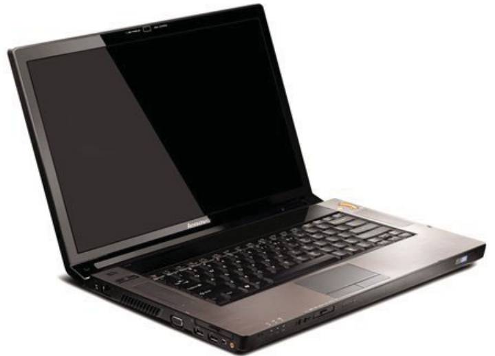
Lenovo IdeaPad Y510 with aluminum palm rest