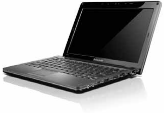
Lenovo IdeaPad S205