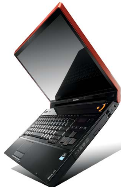
Lenovo IdeaPad Y730 Valencia Orange