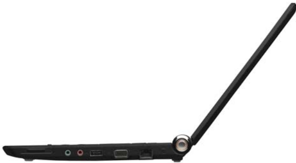
Lenovo IdeaPad S12 (VIA or Intel platform) Black with 3-cell battery