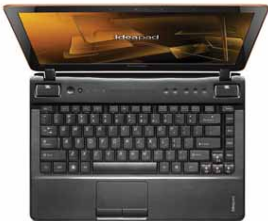
Lenovo IdeaPad Y460