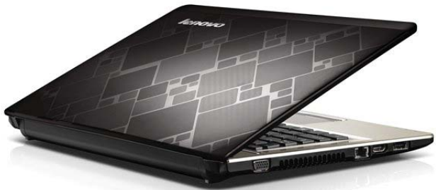
Lenovo IdeaPad U460/U460s Black cover