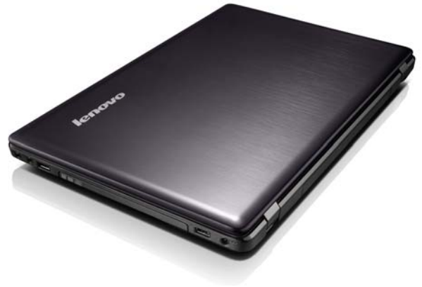
Lenovo IdeaPad Z580 (Graphite gray)