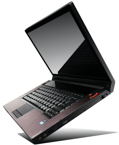
Lenovo IdeaPad Y530