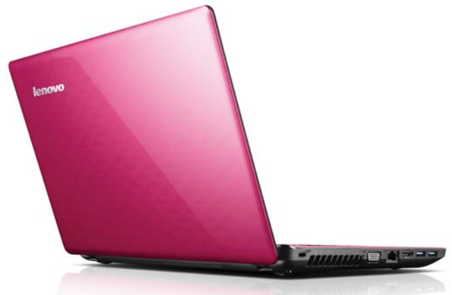
Lenovo IdeaPad Z380 (Peony pink)