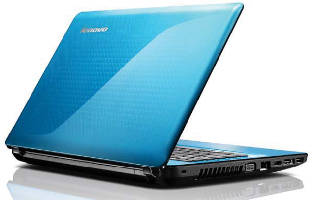
Lenovo IdeaPad Z470