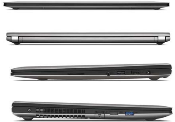
Lenovo IdeaPad S400