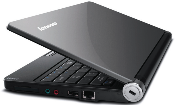
Lenovo IdeaPad S9e