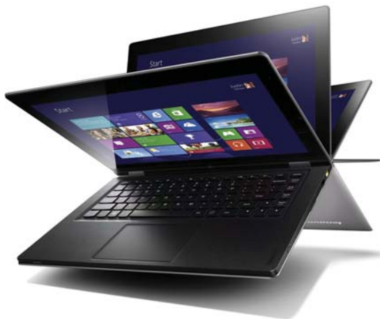
Lenovo IdeaPad Yoga 13 (Silver Gray)