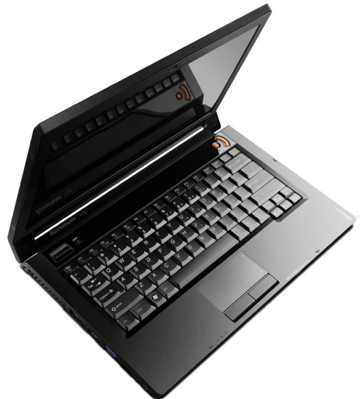
Lenovo IdeaPad Y430