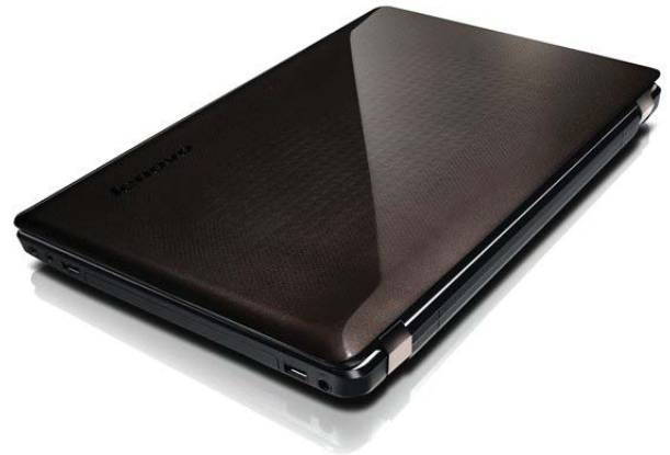
Lenovo IdeaPad Z470