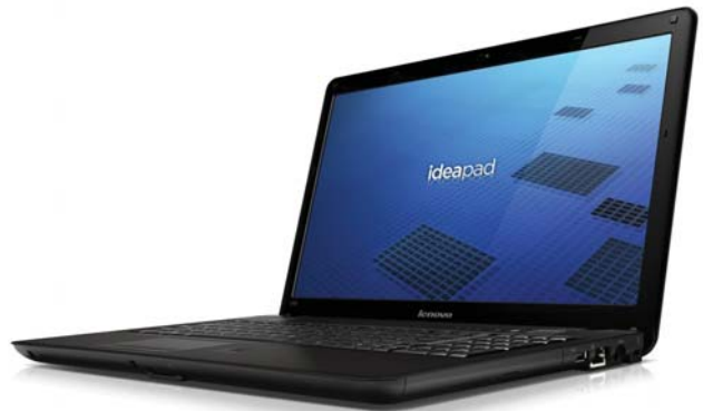
Lenovo IdeaPad U550 cover