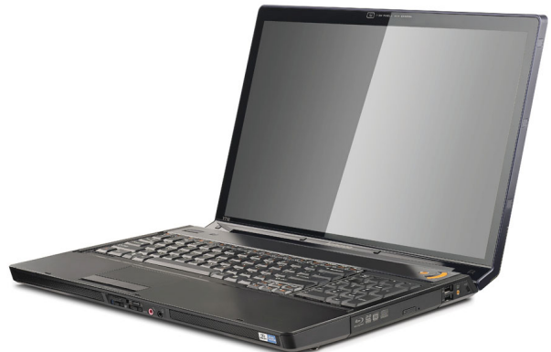
Lenovo IdeaPad Y710