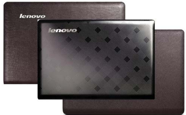
Lenovo IdeaPad U350 cover