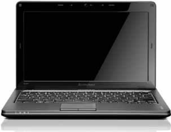
Lenovo IdeaPad S205