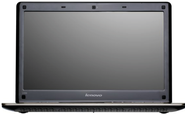
Lenovo IdeaPad U350