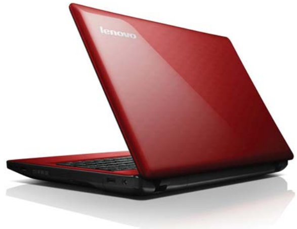
Lenovo IdeaPad Z580 (Cherry red)