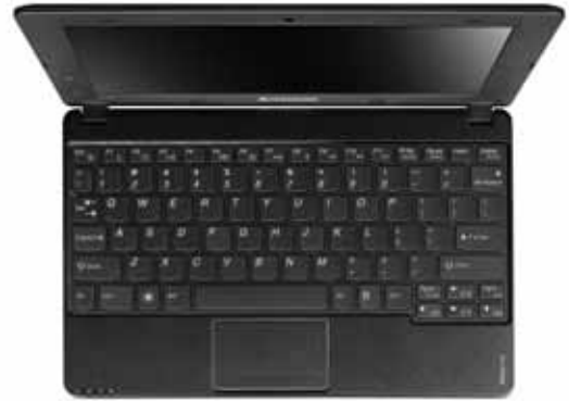
Lenovo IdeaPad S100 Black