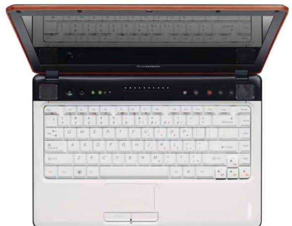
Lenovo IdeaPad Y450