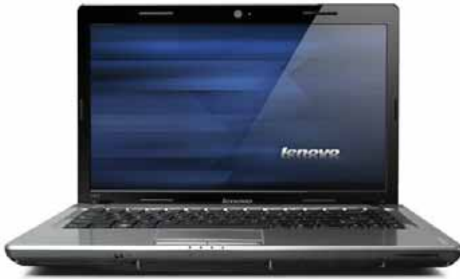
Lenovo IdeaPad Z460