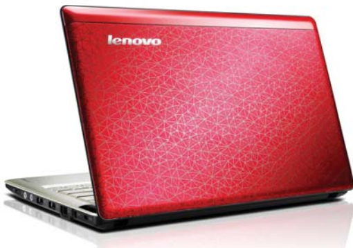
Lenovo IdeaPad U150 red cover