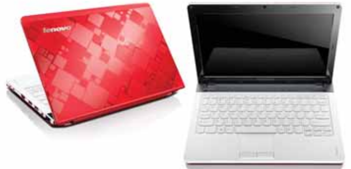
Lenovo IdeaPad U160 red cover