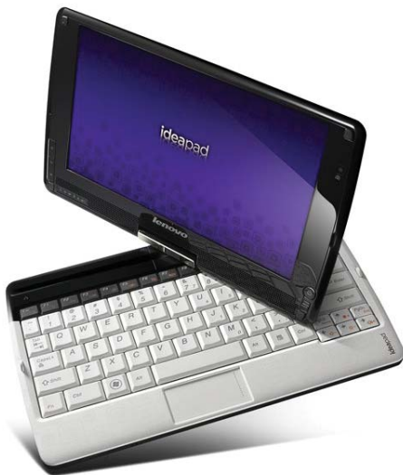
Lenovo IdeaPad S10-3t (4-cell model)