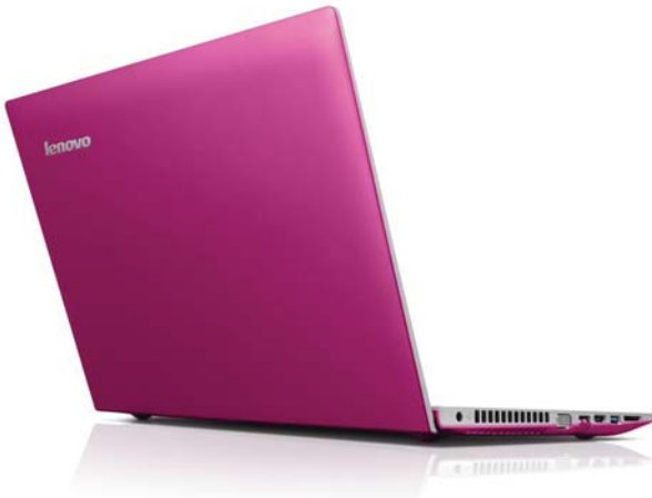
Lenovo IdeaPad Z400 (Pink)