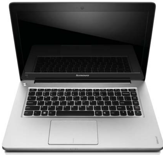
Lenovo IdeaPad U410 (Graphite Gray)