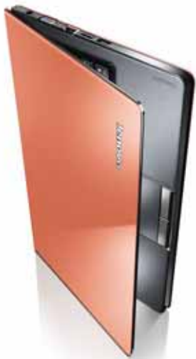
Lenovo IdeaPad U260 Clementine Orange cover