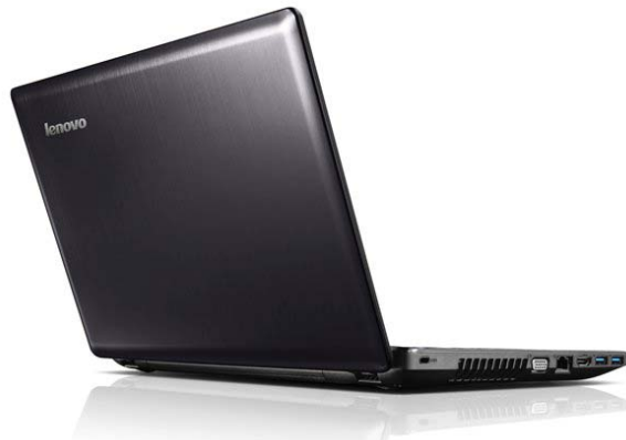
Lenovo IdeaPad Z480 (Graphite Gray)