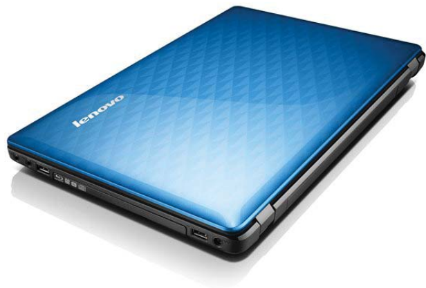
Lenovo IdeaPad Z480 (Coral Blue)