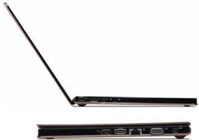
Lenovo IdeaPad U260 Mocha Brown cover