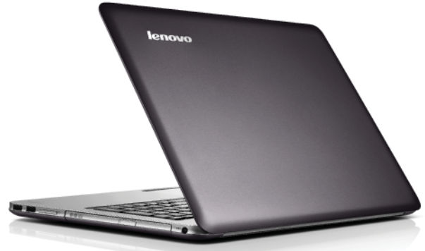
Lenovo IdeaPad U510 (Graphite Gray)