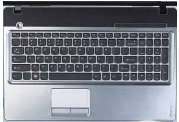
Lenovo IdeaPad Z560