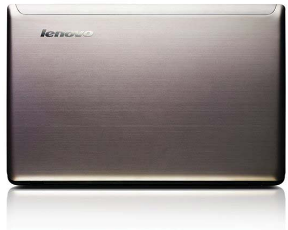
Lenovo IdeaPad Z570