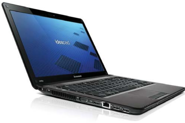
Lenovo IdeaPad U450p