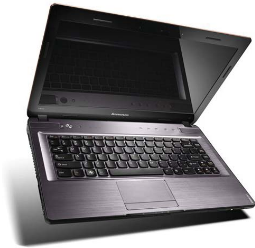
Lenovo IdeaPad Y470