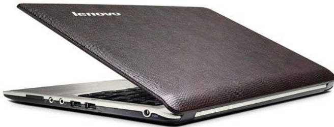
Lenovo IdeaPad U350 with with Lizard Skin pattern cover