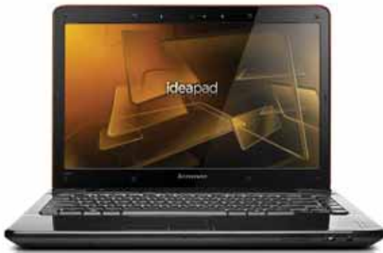
Lenovo IdeaPad Y460