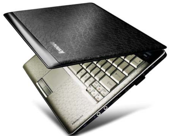
Lenovo IdeaPad U150 black cover