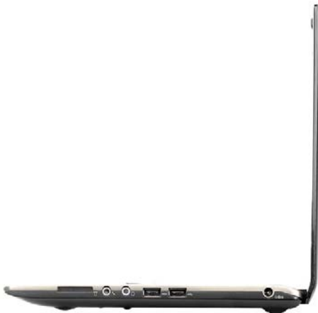
Lenovo IdeaPad U350