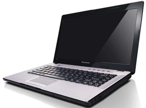
Lenovo IdeaPad Z470