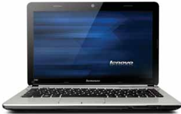
Lenovo IdeaPad Z360