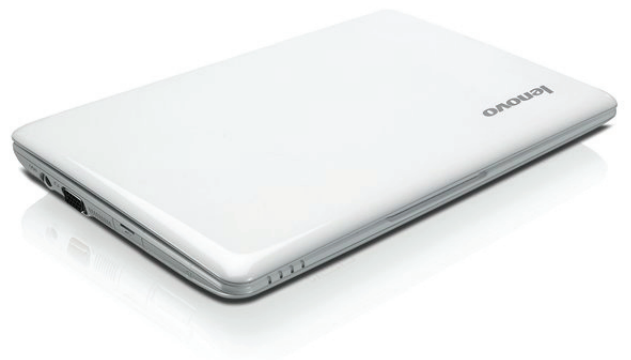
Lenovo IdeaPad S10-3s White