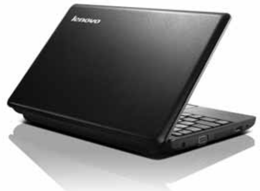
Lenovo IdeaPad S100 Black