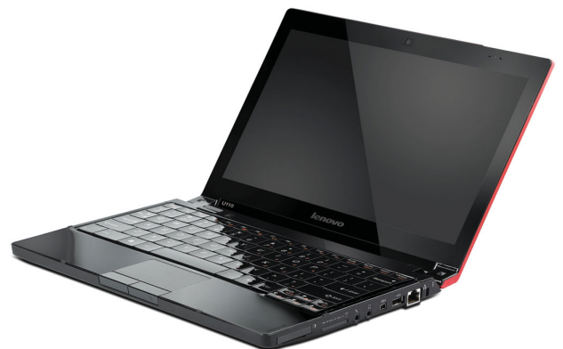
Lenovo IdeaPad U110