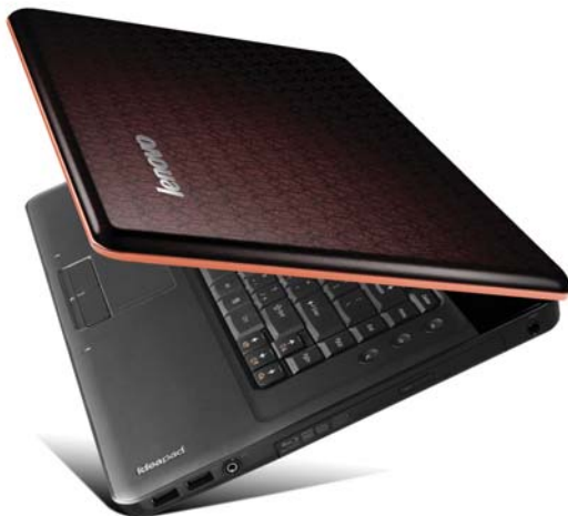
Lenovo IdeaPad Y550