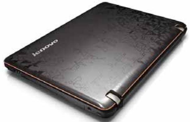
Lenovo IdeaPad Y460