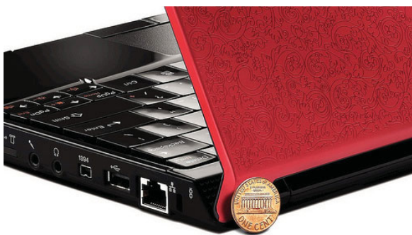
Lenovo IdeaPad U110 (also available with black top)