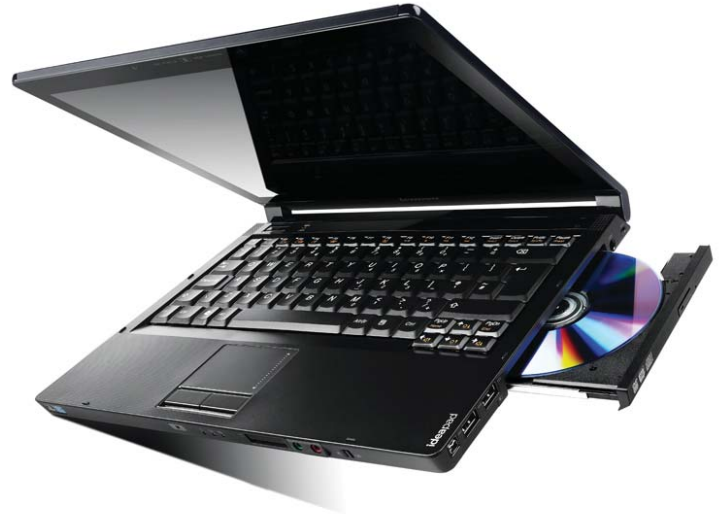
Lenovo IdeaPad U330