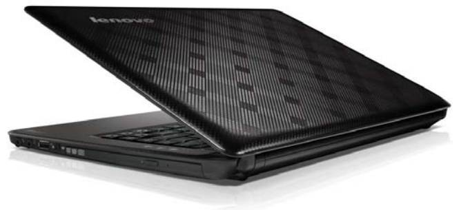
Lenovo IdeaPad U450p