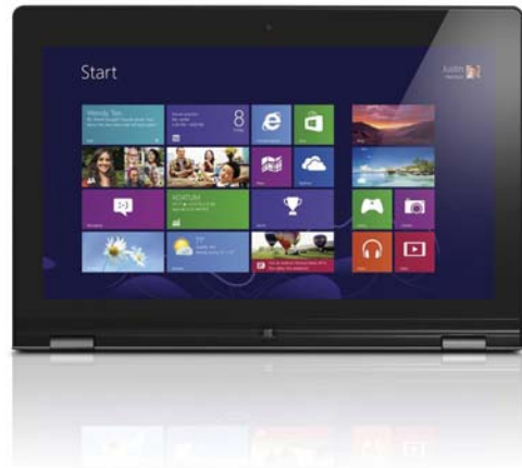
Lenovo IdeaPad Yoga 13 (Silver Gray)