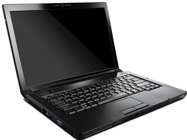
Lenovo IdeaPad Y430