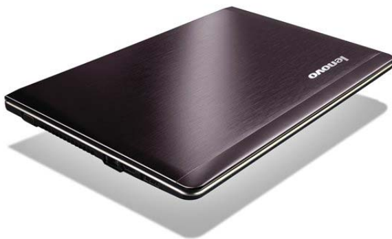
Lenovo IdeaPad U460/U460s Midnight Plum cover