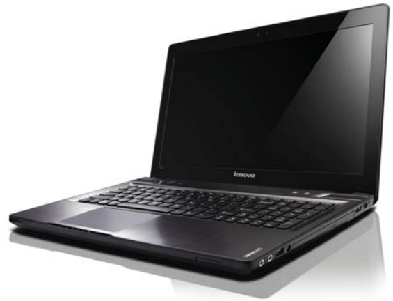
Lenovo IdeaPad Y580