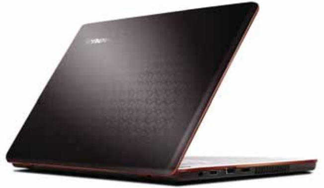
Lenovo IdeaPad Y650