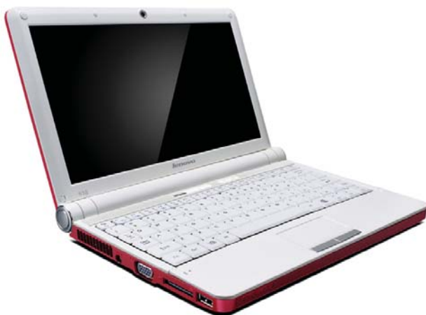
Lenovo IdeaPad S10 Ruby Red