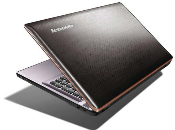
Lenovo IdeaPad Y570