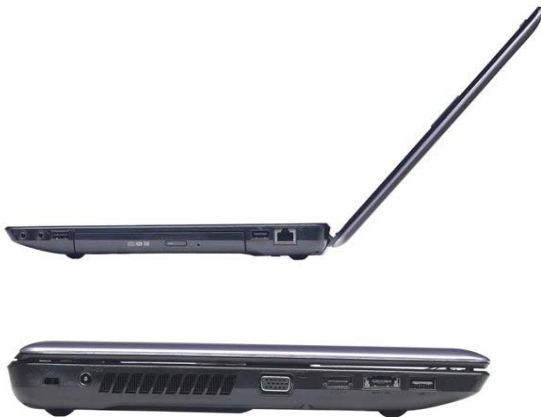
Lenovo IdeaPad Z570