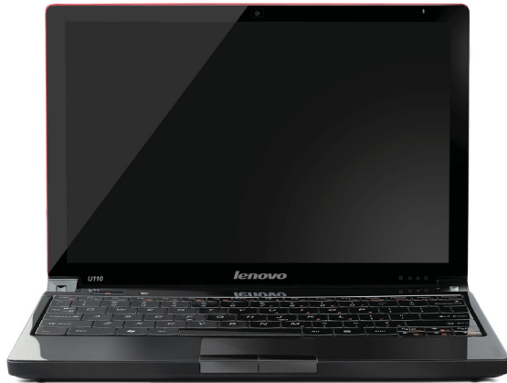
Lenovo IdeaPad U110