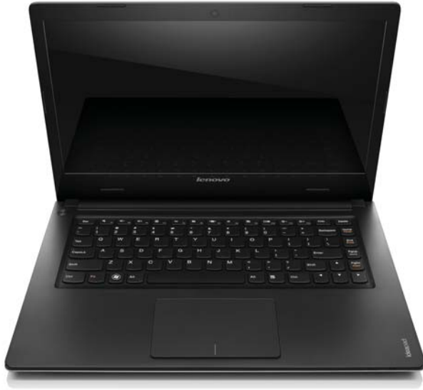
Lenovo IdeaPad S400 (Silver Gray)