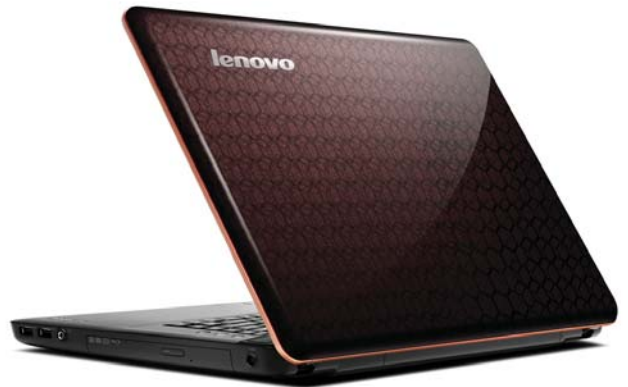
Lenovo IdeaPad Y550