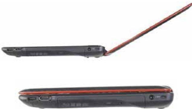
Lenovo IdeaPad Y460