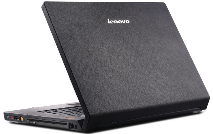
Lenovo IdeaPad Y510 with aluminum palm rest