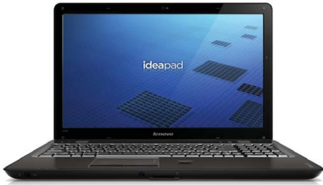
Lenovo IdeaPad U550