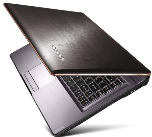
Lenovo IdeaPad Y470