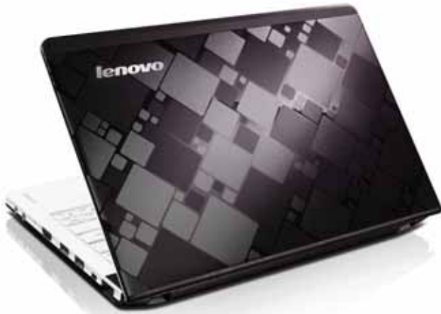
Lenovo IdeaPad U160 black cover