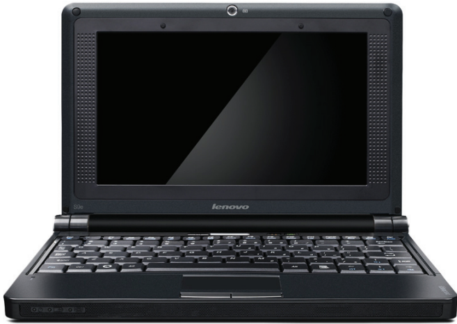
Lenovo IdeaPad S9e