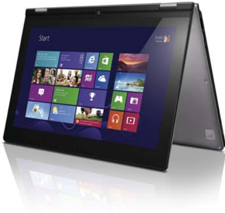
Lenovo IdeaPad Yoga 13 (Silver Gray)