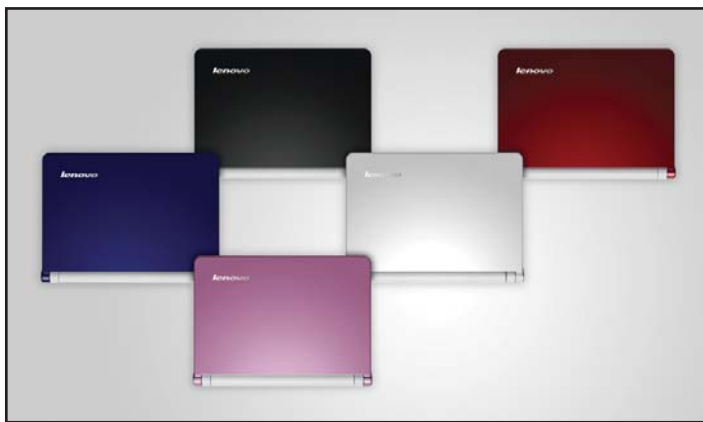
Lenovo IdeaPad S10 Bold Black, Ruby Red, Deep Blue, Classic White, Pastel Pink