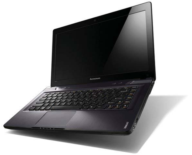
Lenovo IdeaPad Y480