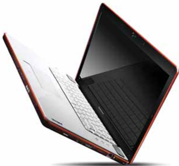
Lenovo IdeaPad Y650