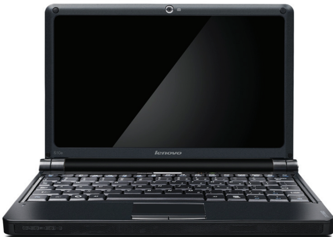
Lenovo IdeaPad S10e