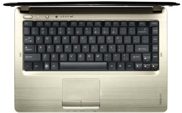
Lenovo IdeaPad U350