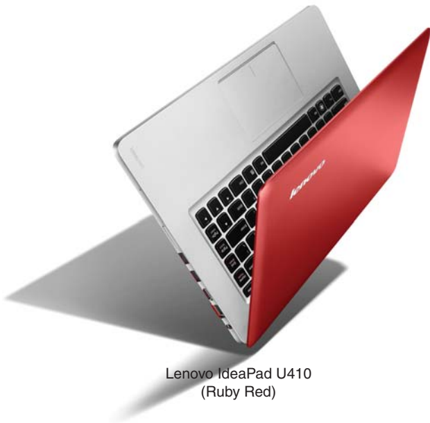
Lenovo IdeaPad U410 (Ruby Red)