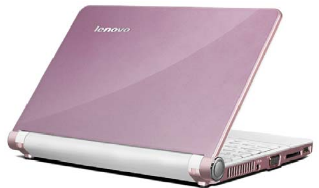
Lenovo IdeaPad S10 Pastel Pink