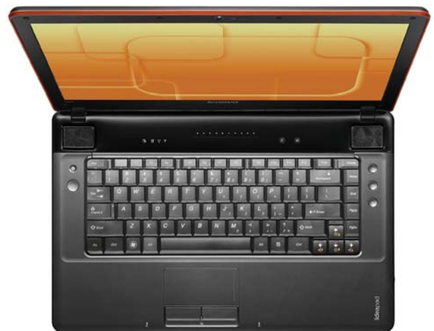
Lenovo IdeaPad Y550