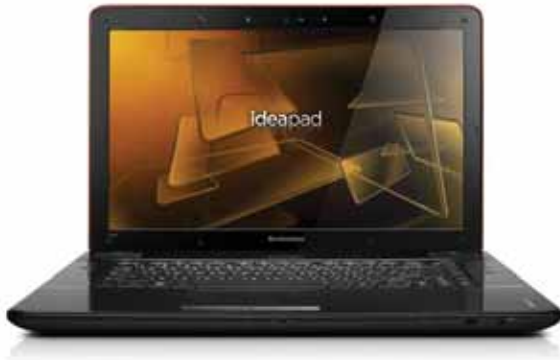
Lenovo IdeaPad Y560