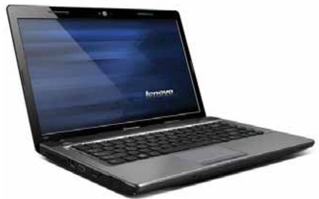
Lenovo IdeaPad Z460