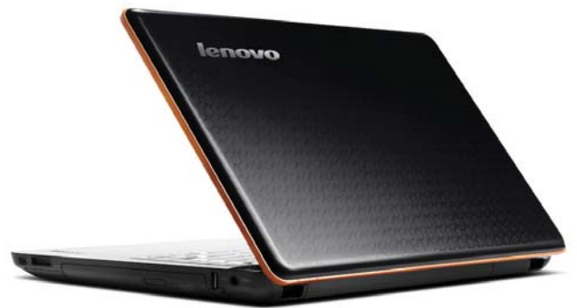
Lenovo IdeaPad Y450