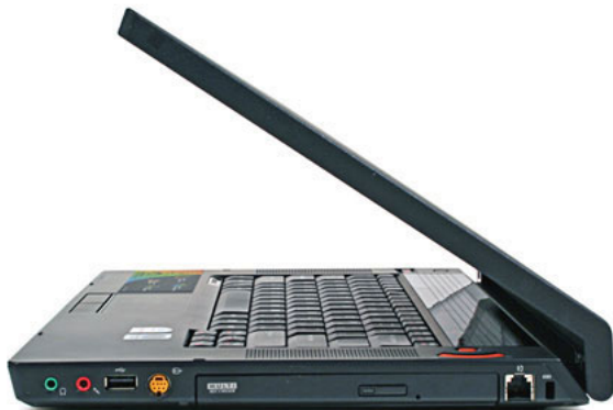
Lenovo IdeaPad Y510