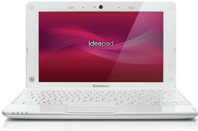
Lenovo IdeaPad S10-3s White