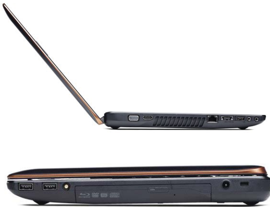
Lenovo IdeaPad Y570