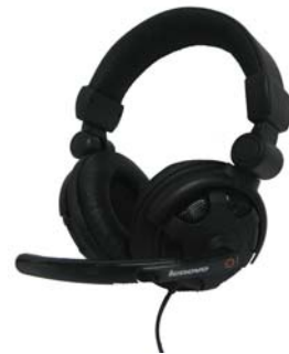
Lenovo Headset P950 (57Y6605)