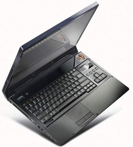
Lenovo IdeaPad Y710 (Game Zone on select models)