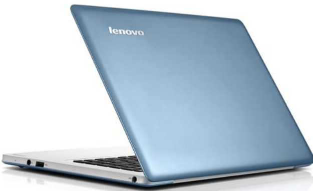
Lenovo IdeaPad U310 (Aqua Blue)