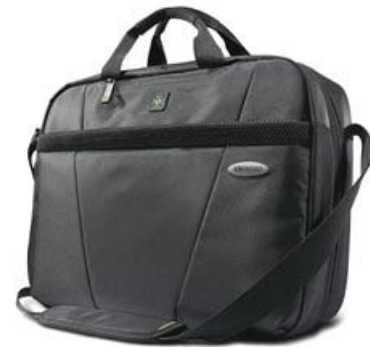
IdeaPad T150 TopLoader (55Y9397)