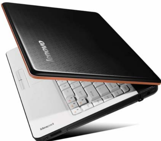
Lenovo IdeaPad Y450