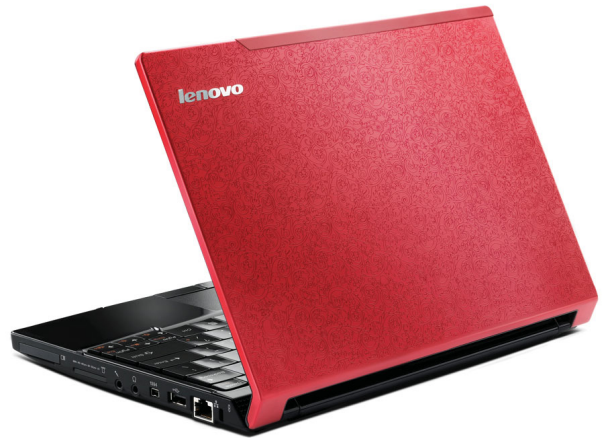
Lenovo IdeaPad U110 (also available with black top)