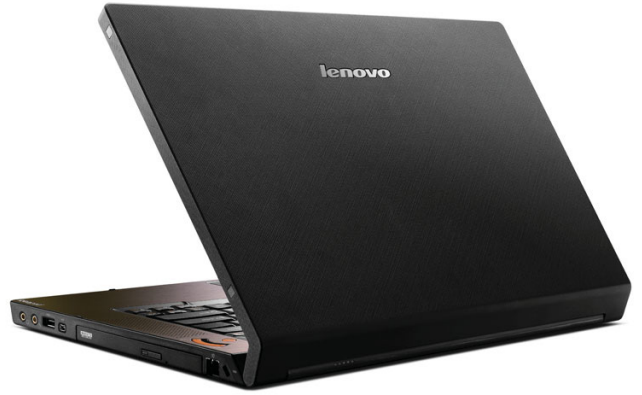
Lenovo IdeaPad Y530