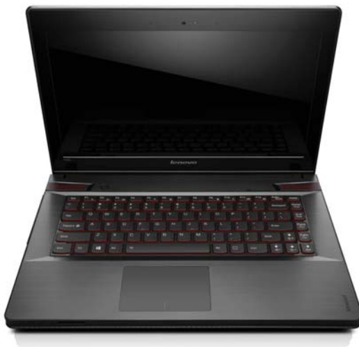
Lenovo IdeaPad Y400 with optional backlight keyboard