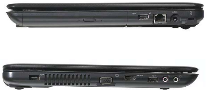
Lenovo IdeaPad U550 Lightweave pattern cover