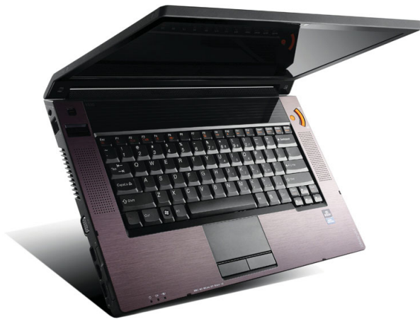
Lenovo IdeaPad Y530