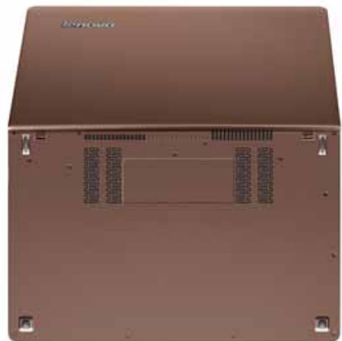
Lenovo IdeaPad U260 Mocha Brown cover