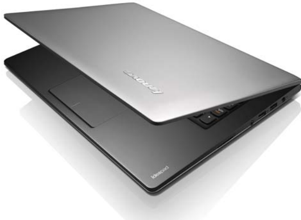
Lenovo IdeaPad S30 (Silver Gray)