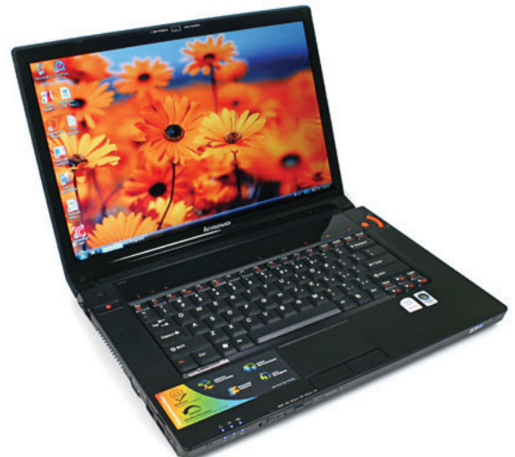
Lenovo IdeaPad Y510