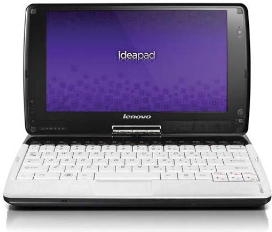
Lenovo IdeaPad S10-3t