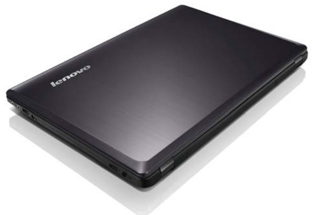
Lenovo IdeaPad Y580