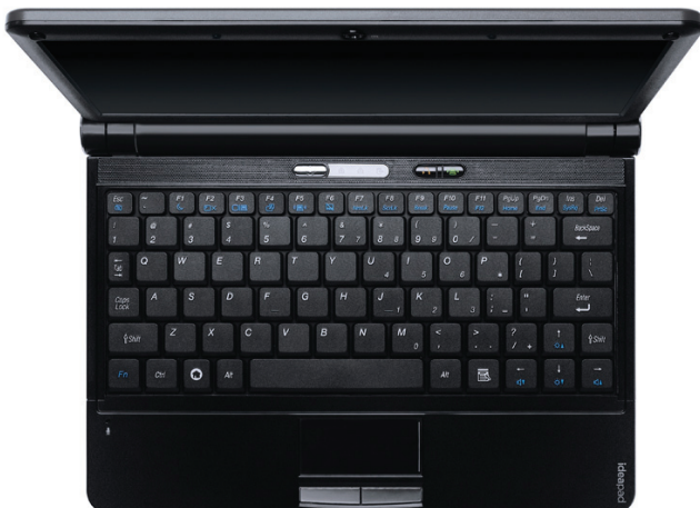
Lenovo IdeaPad S10e