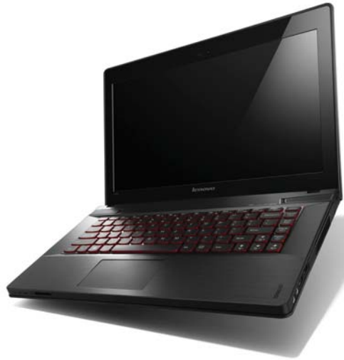
Lenovo IdeaPad Y400 with optional backlight keyboard