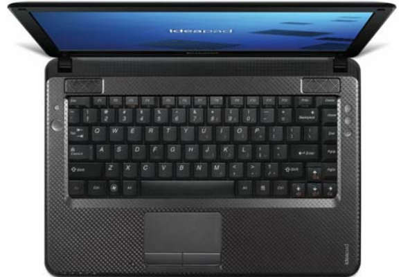
Lenovo IdeaPad U450p