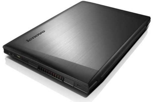
Lenovo IdeaPad Y500 with optional 2 nd fan or 2 nd Graphics