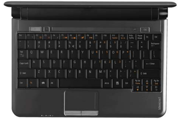
Lenovo IdeaPad S10-2 Gray