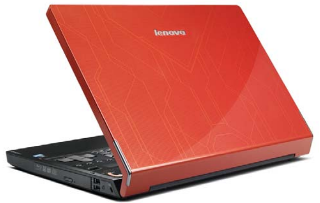
Lenovo IdeaPad Y730 Valencia Orange