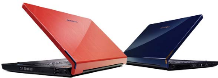
Lenovo IdeaPad Y730