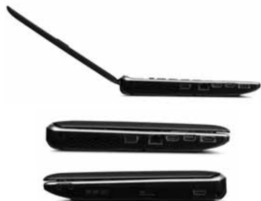
Lenovo IdeaPad Z360