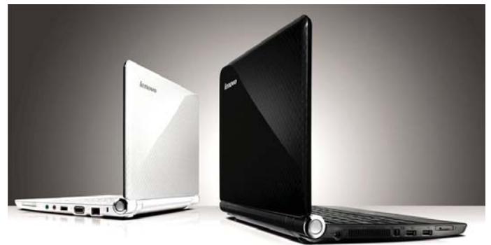
Lenovo IdeaPad S12 (VIA or Intel platform) White and Black with 3-cell battery