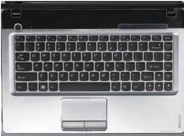
Lenovo IdeaPad Z460