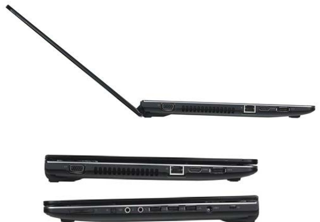
Lenovo IdeaPad U460/U460s