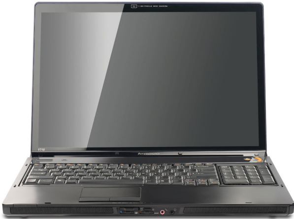
Lenovo IdeaPad Y710