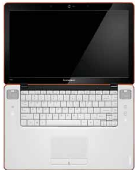
Lenovo IdeaPad Y650