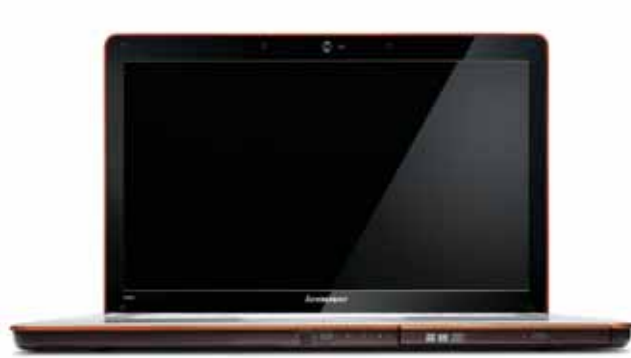
Lenovo IdeaPad Y650