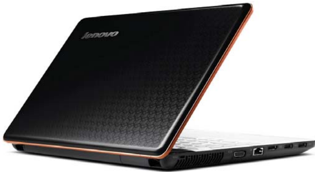
Lenovo IdeaPad Y450