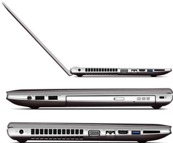
Lenovo IdeaPad Z400 (Dark chocolate)