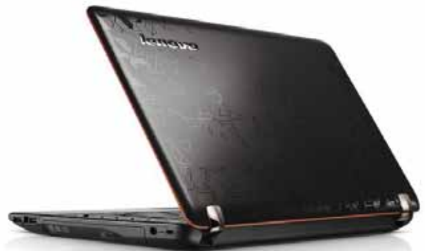
Lenovo IdeaPad Y460