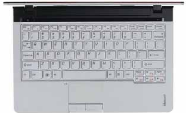
Lenovo IdeaPad U160