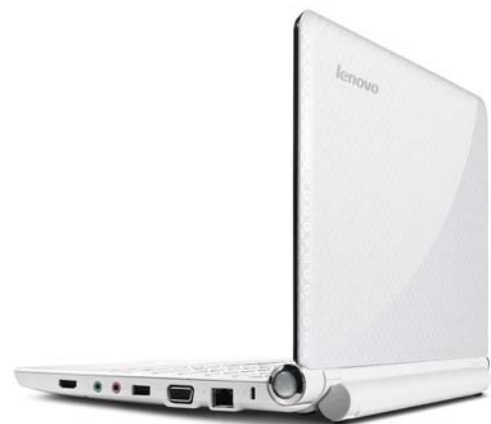
Lenovo IdeaPad S12 (NVIDIA ION platform*) White with 6-cell battery * ION models have HDMI port instead of ExpressCard/34