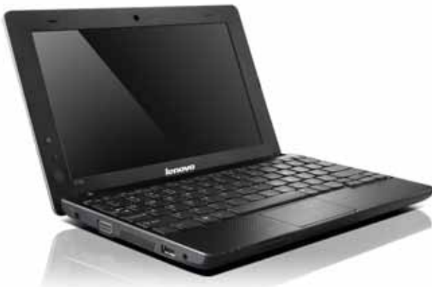
Lenovo IdeaPad S100 Black