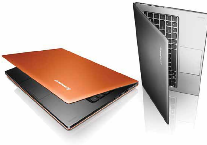
Lenovo IdeaPad U300s

Visit www.lenovo.com/psref for the latest version