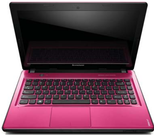
Lenovo IdeaPad Z380 (Peony pink)