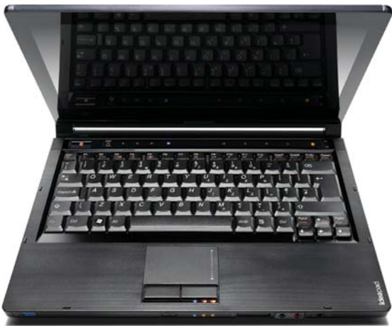
Lenovo IdeaPad U330