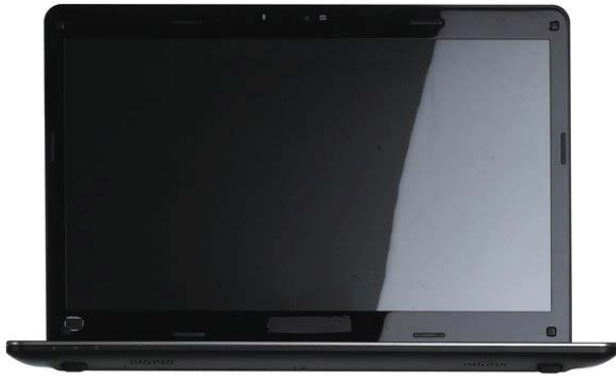
Lenovo IdeaPad U460/U460s