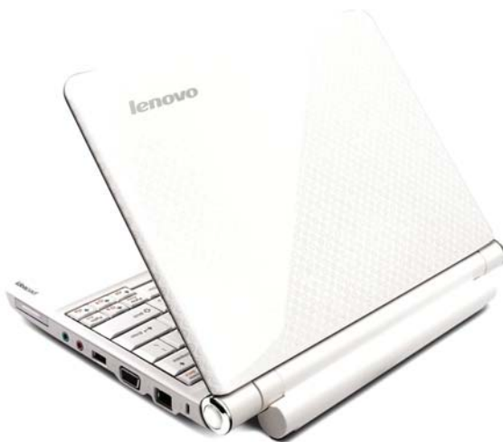
Lenovo IdeaPad S12 (VIA or Intel platform) White with 6-cell battery