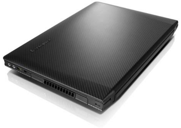
Lenovo IdeaPad Y400 with optional 2 nd fan or 2 nd Graphics