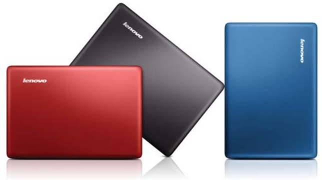
Lenovo IdeaPad U410