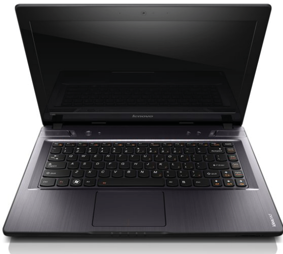
Lenovo IdeaPad Y480