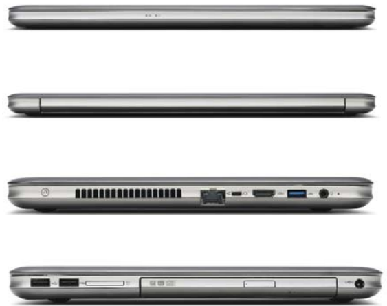
Lenovo IdeaPad U510