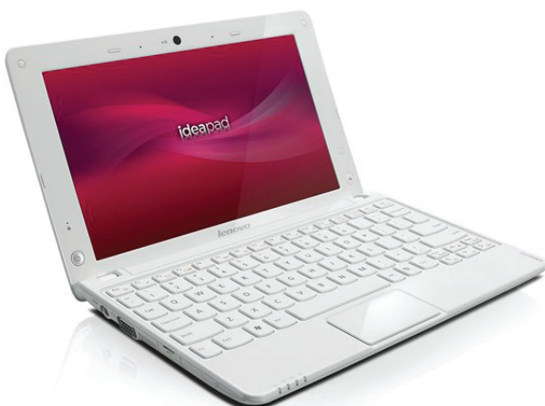
Lenovo IdeaPad S10-3s White