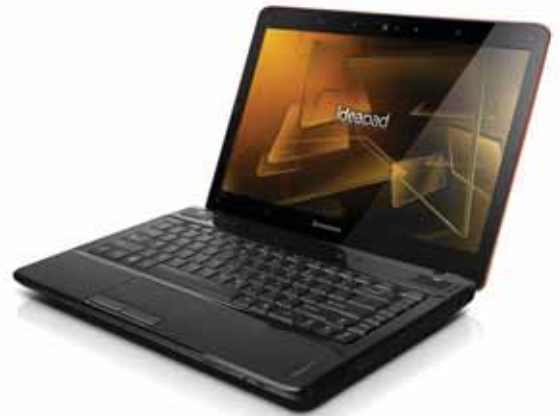
Lenovo IdeaPad Y460