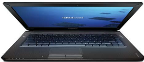
Lenovo IdeaPad U450p