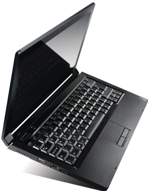
Lenovo IdeaPad U330