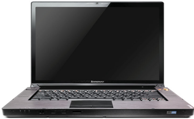
Lenovo IdeaPad Y530