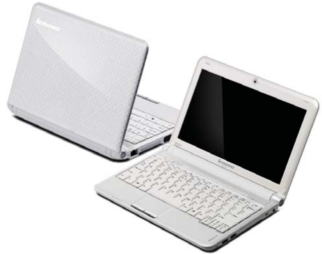
Lenovo IdeaPad S10-2 White