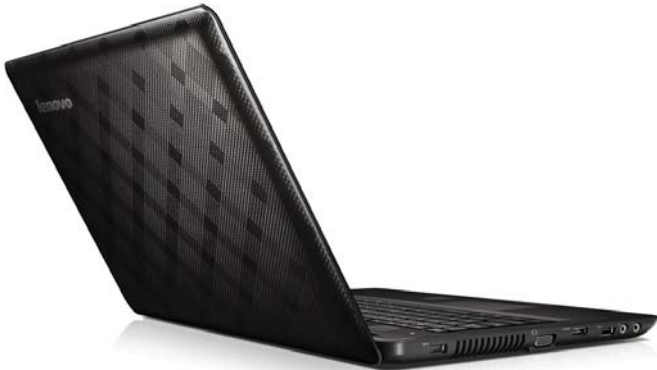
Lenovo IdeaPad U550