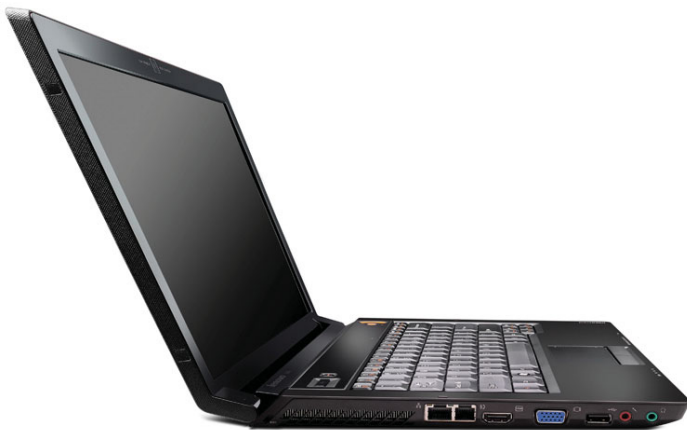
Lenovo IdeaPad Y430