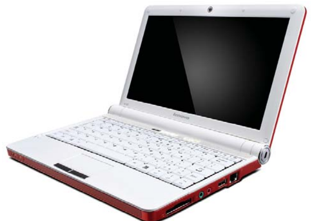
Lenovo IdeaPad S10 Ruby Red