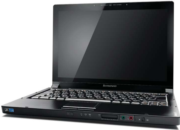
Lenovo IdeaPad U330