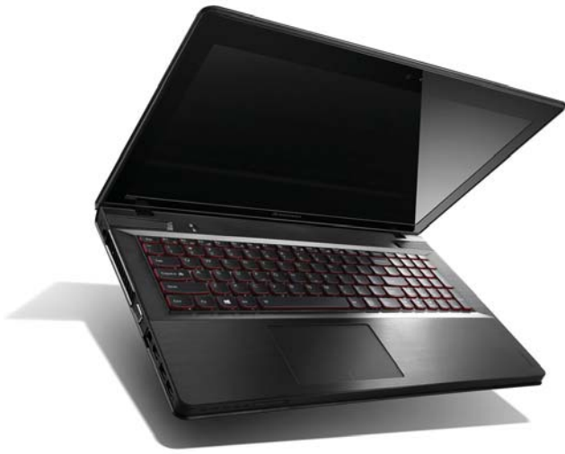
Lenovo IdeaPad Y500