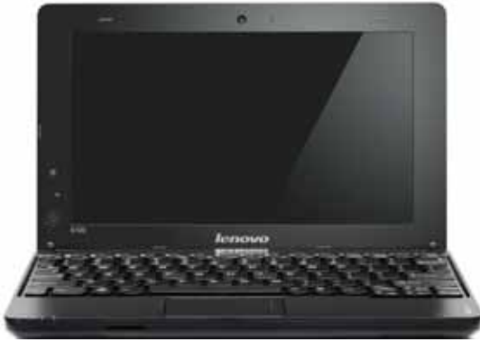
Lenovo IdeaPad S100 Black