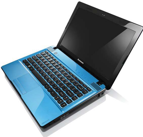
Lenovo IdeaPad Z370 (blue)