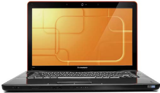
Lenovo IdeaPad Y550