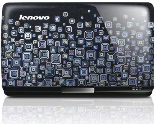
Lenovo IdeaPad S10-3t (4-cell model with Cosmic Wonder pattern)