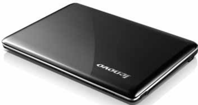
Lenovo IdeaPad Z360