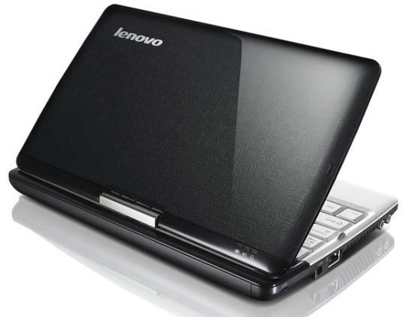
Lenovo IdeaPad S10-3t (4-cell model with Cosmic Night pattern)