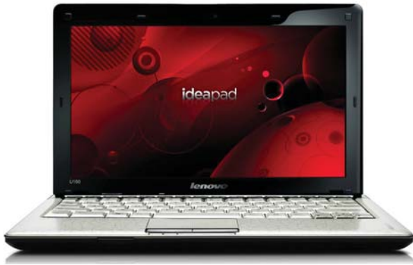
Lenovo IdeaPad U150