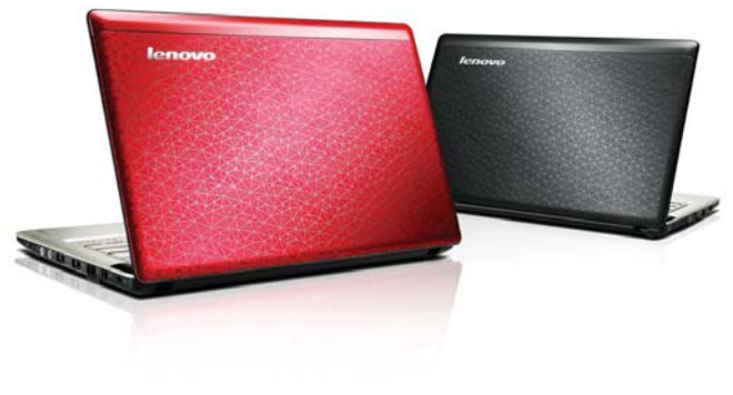
Lenovo IdeaPad U150