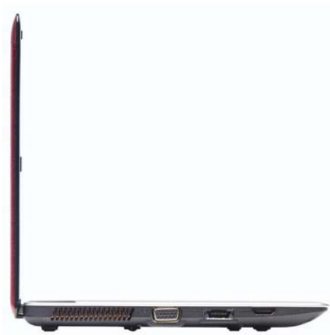
Lenovo IdeaPad U150