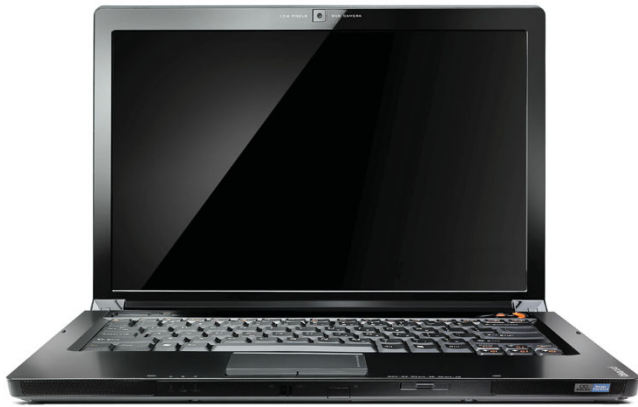
Lenovo IdeaPad Y430