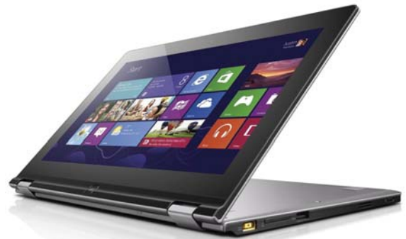
Lenovo IdeaPad Yoga 11 (Silver Gray)