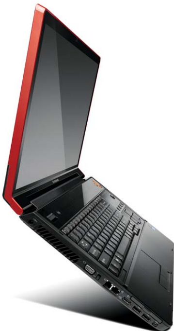
Lenovo IdeaPad Y730 Valencia Orange