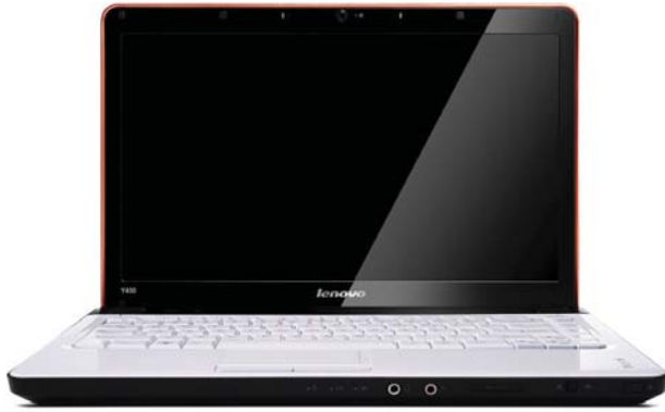
Lenovo IdeaPad Y450