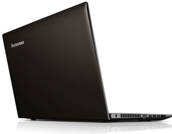
Lenovo IdeaPad Z500 (Dark chocolate)