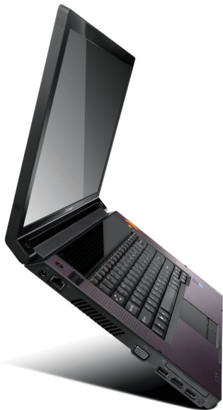
Lenovo IdeaPad Y530