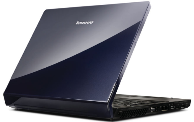
Lenovo IdeaPad Y710