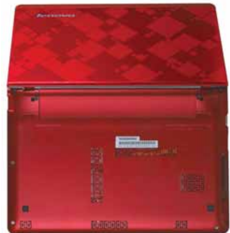
Lenovo IdeaPad U160 red cover