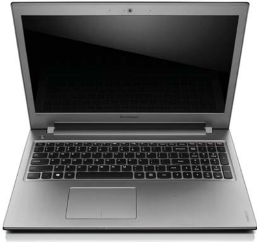
Lenovo IdeaPad Z500 (Dark chocolate)