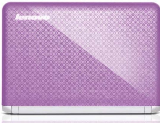
Lenovo IdeaPad S10-2 Pink