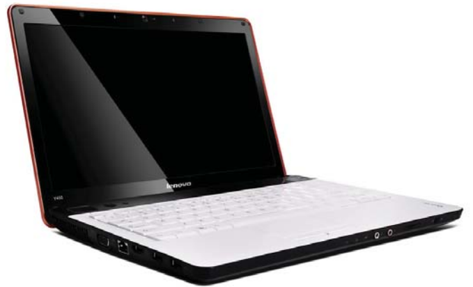
Lenovo IdeaPad Y450