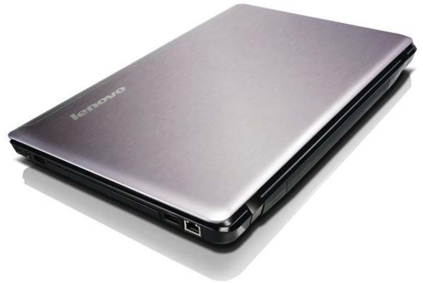
Lenovo IdeaPad Z570