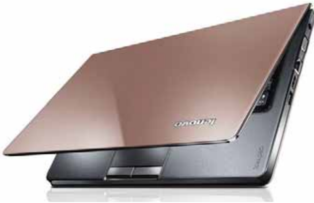
Lenovo IdeaPad U260 Mocha Brown cover