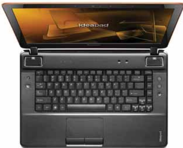
Lenovo IdeaPad Y560