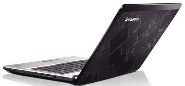
Lenovo IdeaPad U460/U460s Black cover