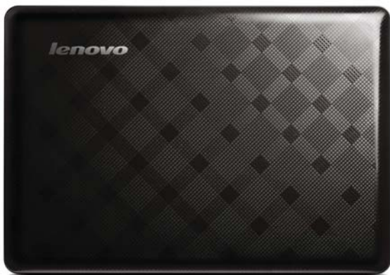
Lenovo IdeaPad U550