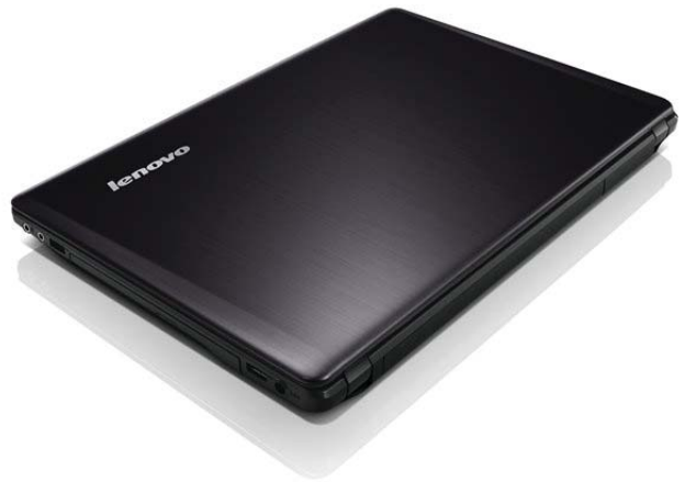
Lenovo IdeaPad Y480 Dark Gray with brushed metal