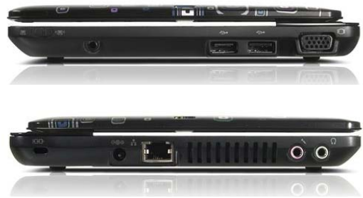
Lenovo IdeaPad S10-3t (4-cell model with Cosmic Wonder pattern)