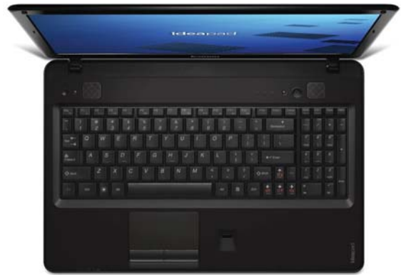
Lenovo IdeaPad U550