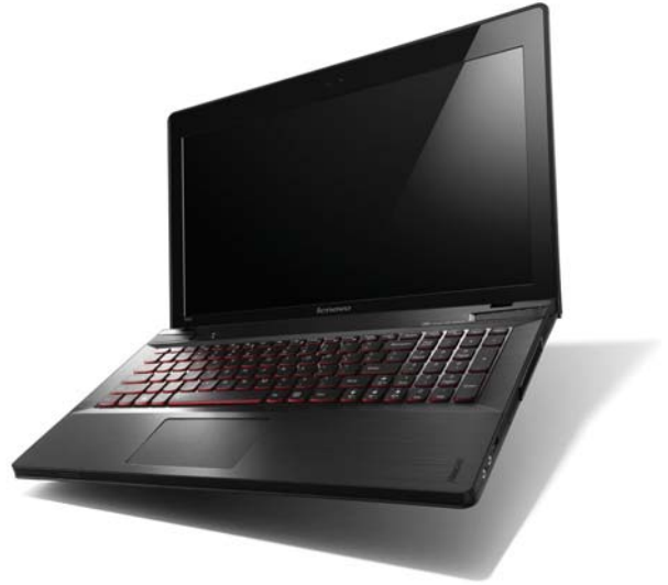
Lenovo IdeaPad Y500