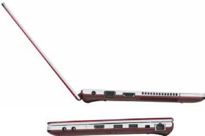
Lenovo IdeaPad U160 red cover