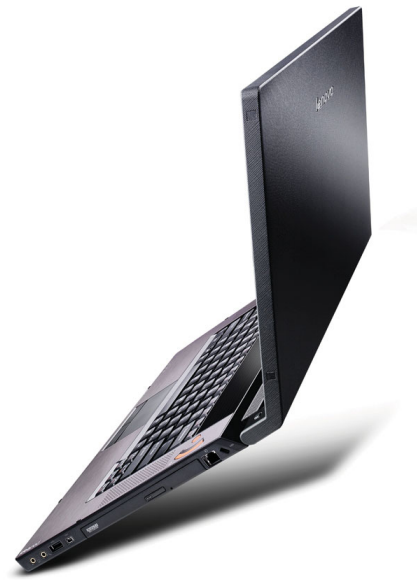
Lenovo IdeaPad Y530