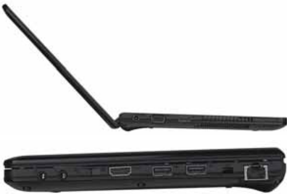
Lenovo IdeaPad S205