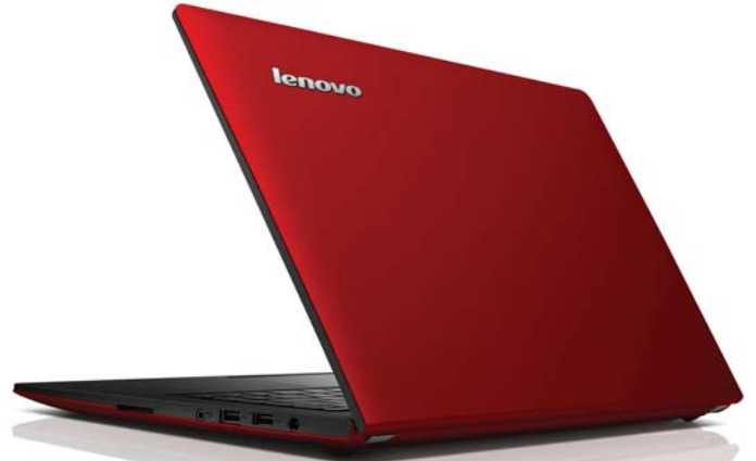
Lenovo IdeaPad S400 (Crimson Red)