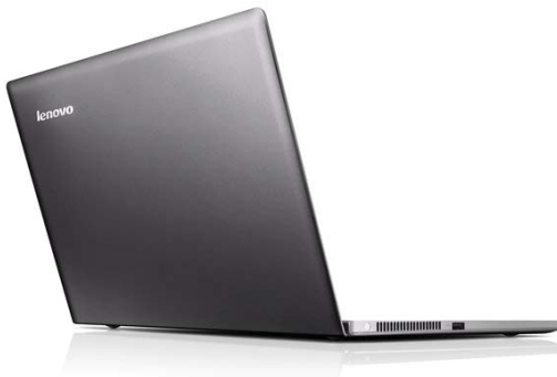
Lenovo IdeaPad U300s (Graphite Gray)