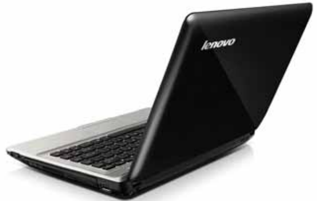
Lenovo IdeaPad Z360