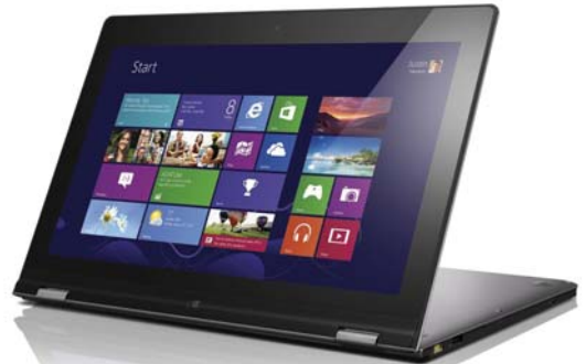
Lenovo IdeaPad Yoga 13 (Silver Gray)