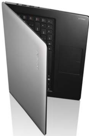
Lenovo IdeaPad S400 (Silver Gray)