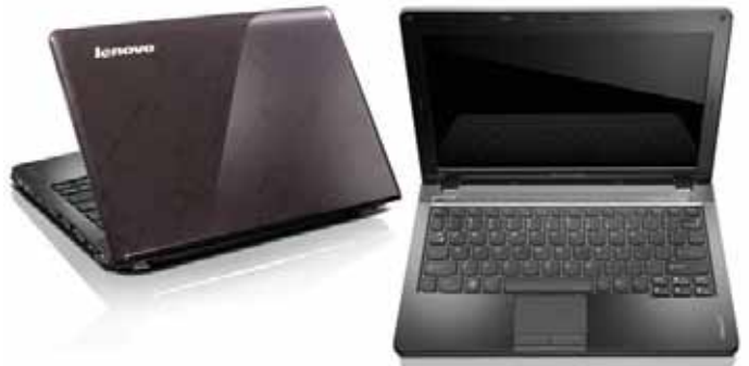
Lenovo IdeaPad S205