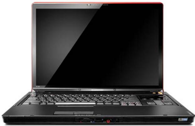
Lenovo IdeaPad Y730 Valencia Orange