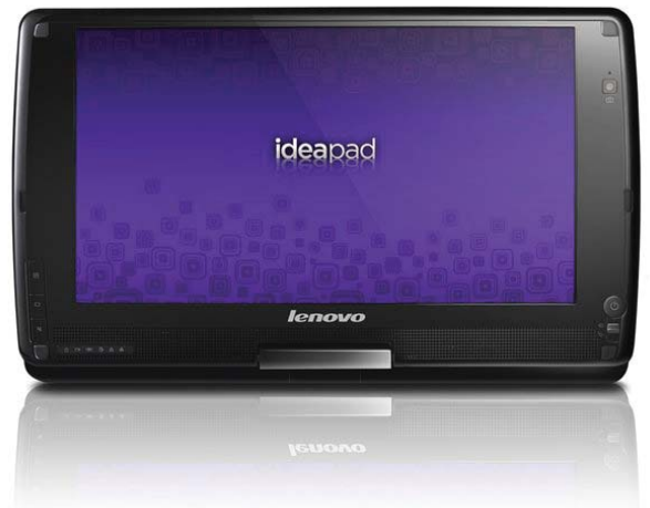
Lenovo IdeaPad S10-3t (4-cell model)