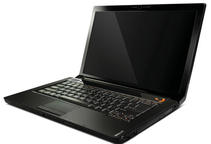
Lenovo IdeaPad Y430