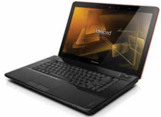
Lenovo IdeaPad Y560