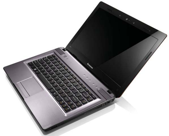
Lenovo IdeaPad Y470