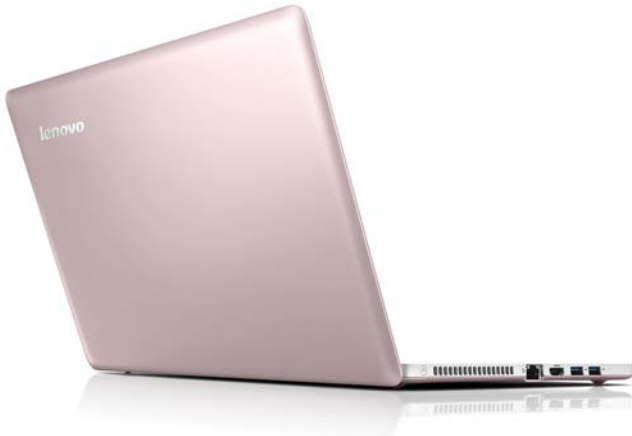
Lenovo IdeaPad U310 (Cherry Blossom Pink)