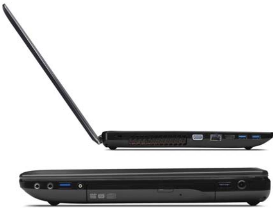
Lenovo IdeaPad Y580