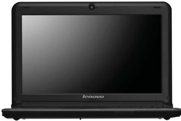
Lenovo IdeaPad S10-2 Gray