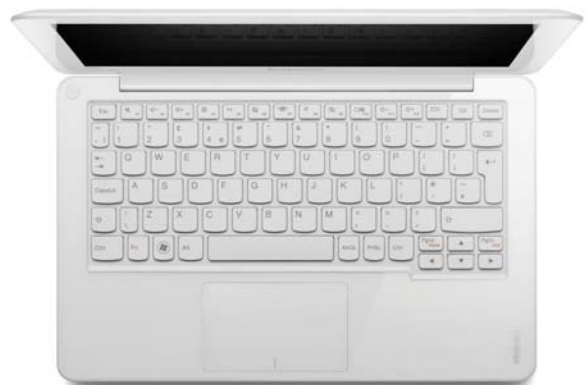
Lenovo IdeaPad S206 (White)