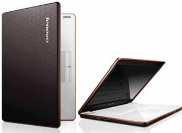
Lenovo IdeaPad Y650