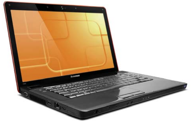
Lenovo IdeaPad Y550