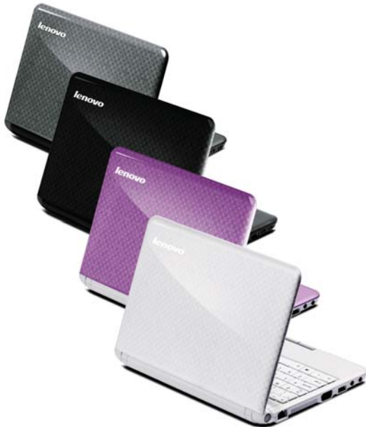
Lenovo IdeaPad S10-2 Black, White, Gray, and Pink