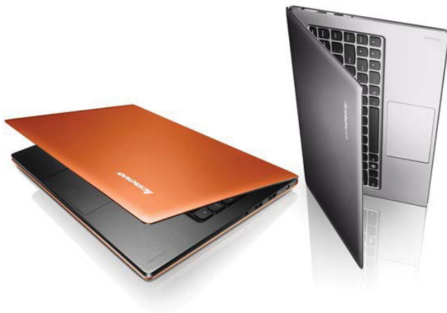
Lenovo IdeaPad U300s