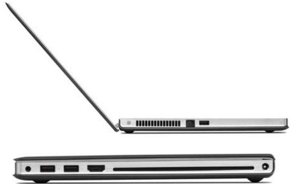
Lenovo IdeaPad U400 (Graphite Gray)