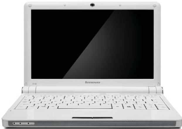
Lenovo IdeaPad S10 Classic White