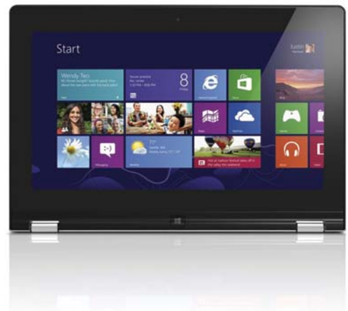
Lenovo IdeaPad Yoga 11 (Silver Gray)