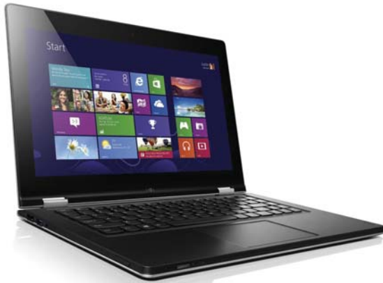
Lenovo IdeaPad Yoga 13 (Silver Gray)