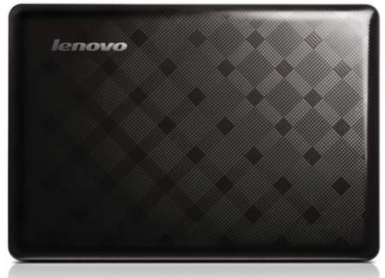
Lenovo IdeaPad U450p