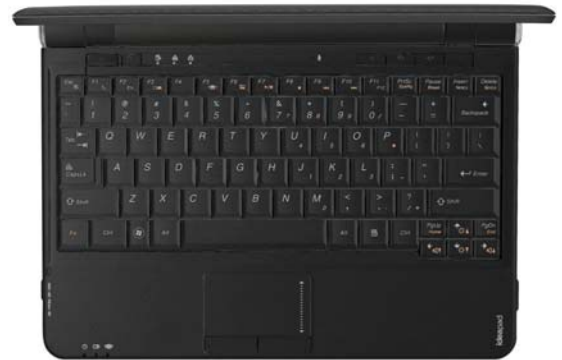
Lenovo IdeaPad S12 Black with 3-cell battery