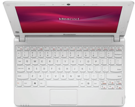
Lenovo IdeaPad S10-3s White