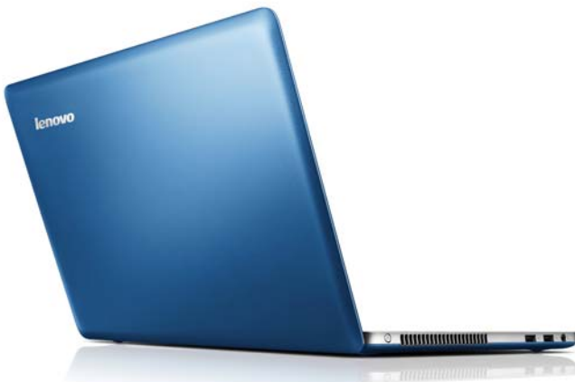
Lenovo IdeaPad U410 (Sapphire Blue)