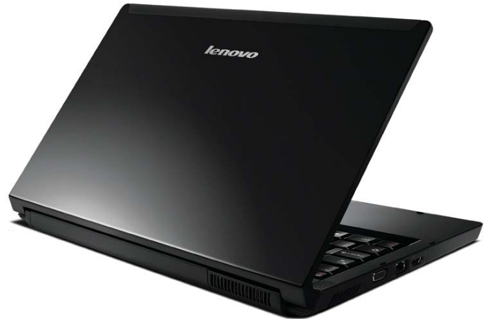
Lenovo IdeaPad U330