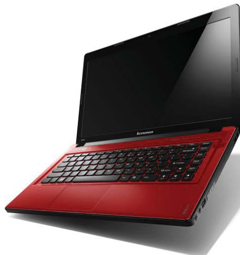
Lenovo IdeaPad Z480 (Cherry Red)