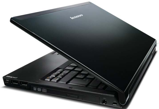
Lenovo IdeaPad U330