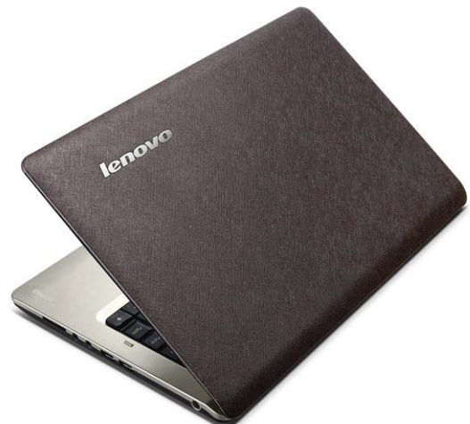
Lenovo IdeaPad U350 Lightweave pattern cover