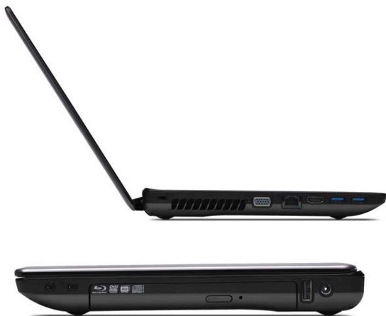
Lenovo IdeaPad Z380 (Graphite gray)