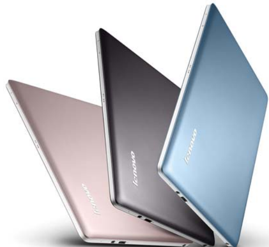
Lenovo IdeaPad U310