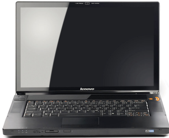
Lenovo IdeaPad Y510