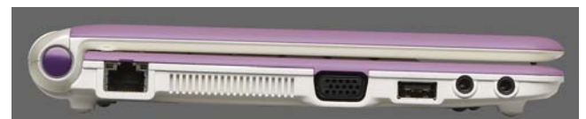
Lenovo IdeaPad S10-2 Pink