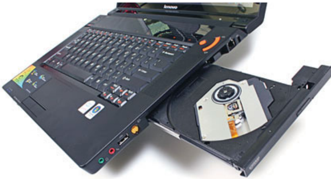
Lenovo IdeaPad Y510