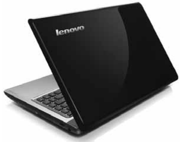
Lenovo IdeaPad Z460