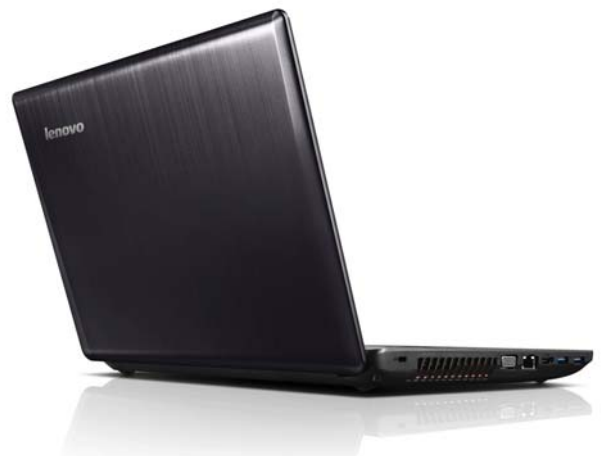
Lenovo IdeaPad Y580