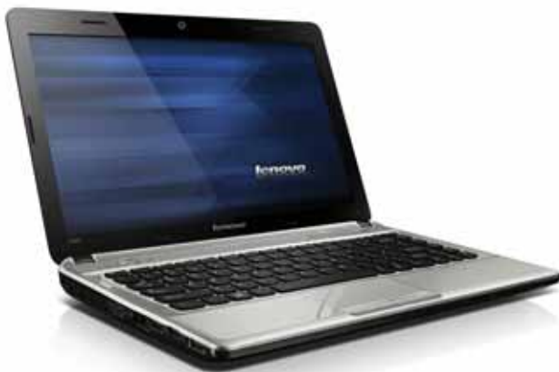
Lenovo IdeaPad Z360