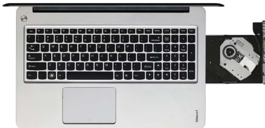
Lenovo IdeaPad U510