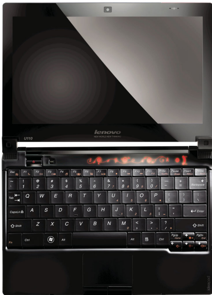
Lenovo IdeaPad U110