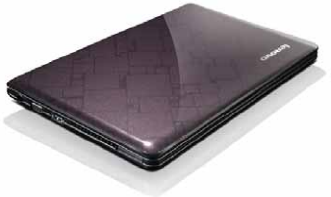
Lenovo IdeaPad S205