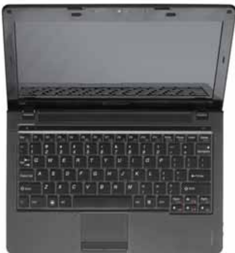
Lenovo IdeaPad S205