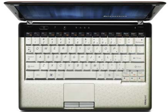
Lenovo IdeaPad U150