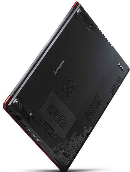
Lenovo IdeaPad U110