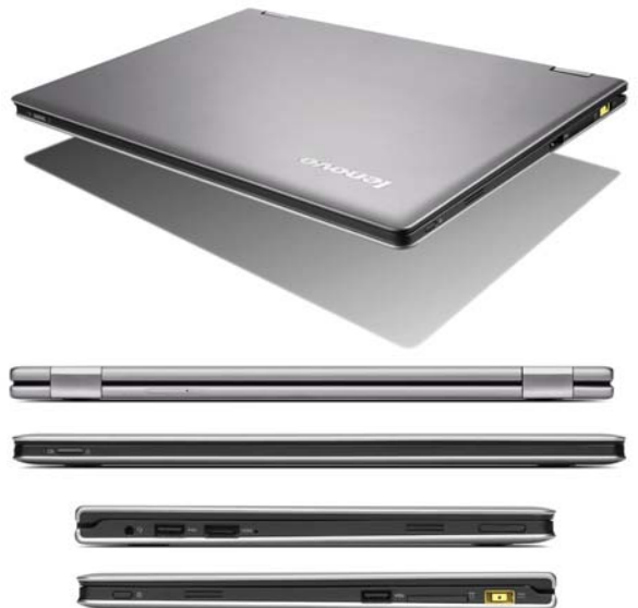
Lenovo IdeaPad Yoga 11 (Silver Gray)