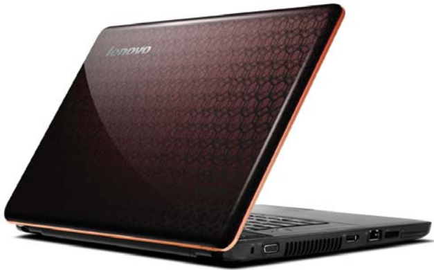
Lenovo IdeaPad Y550