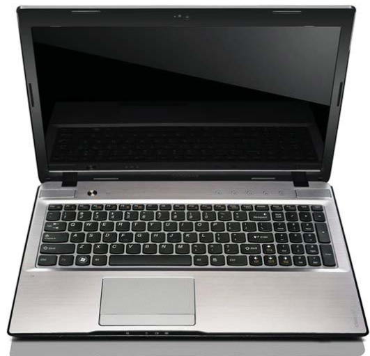
Lenovo IdeaPad Z570