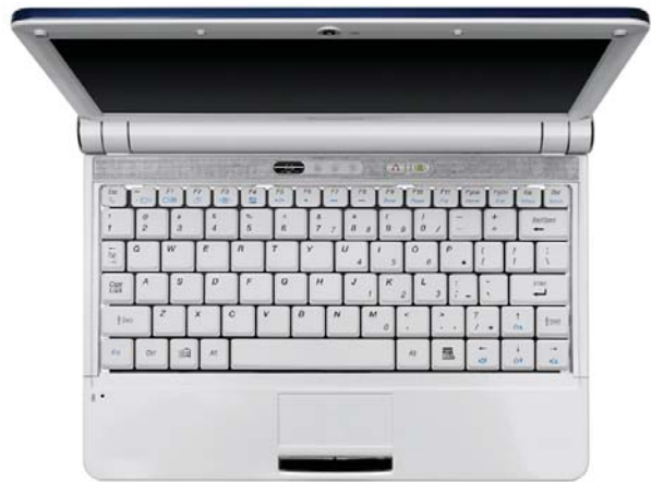
Lenovo IdeaPad S10 Deep Blue