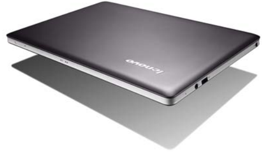
Lenovo IdeaPad U310 (Graphite Gray)