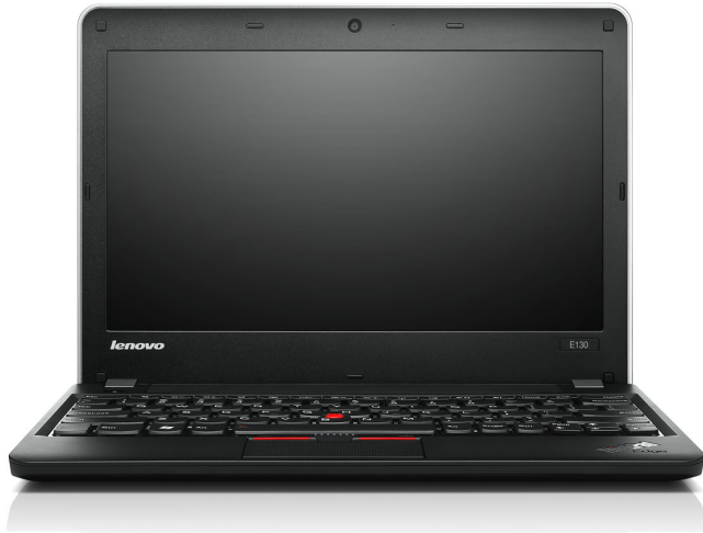
Lenovo® ThinkPad Edge E130