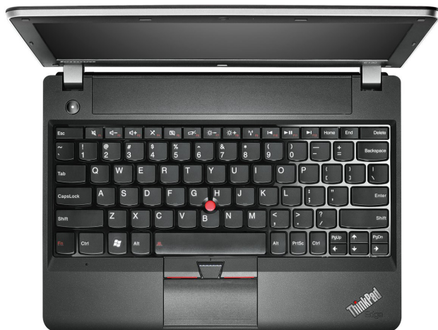
Lenovo ThinkPad Edge E130