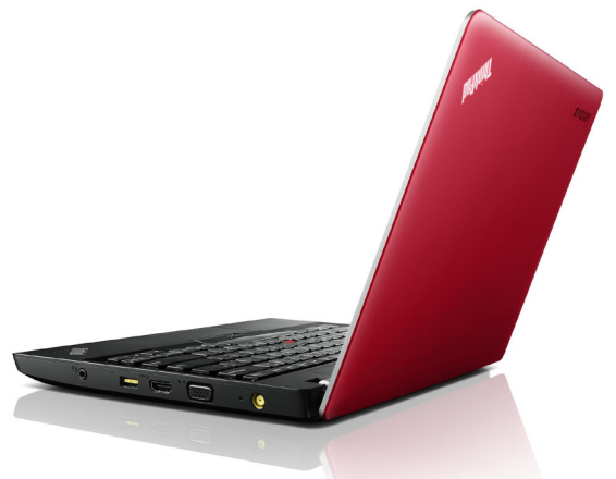
Lenovo ThinkPad Edge E335