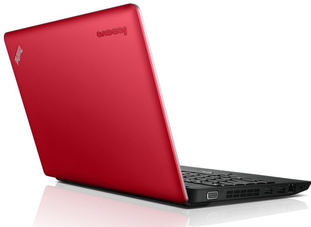
Lenovo ThinkPad Edge E130