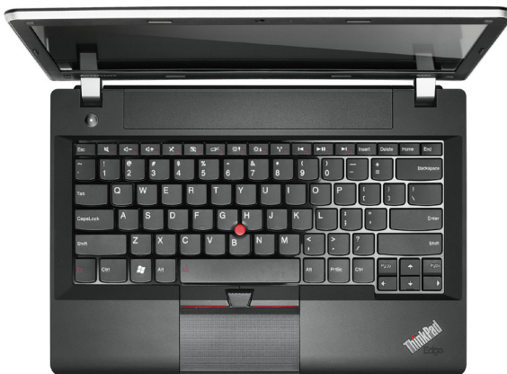
Lenovo ThinkPad Edge E330