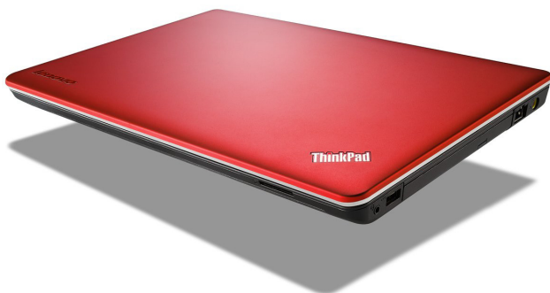
Lenovo ThinkPad Edge E530