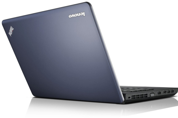
Lenovo ThinkPad Edge E530