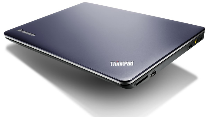
Lenovo ThinkPad Edge E130