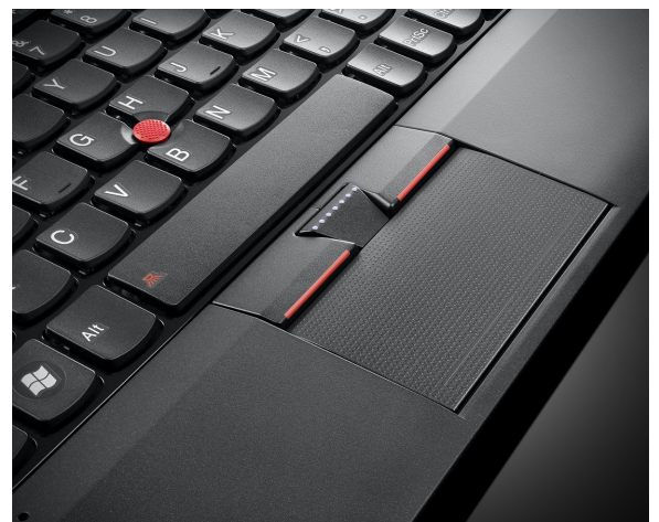
Lenovo ThinkPad Edge E130