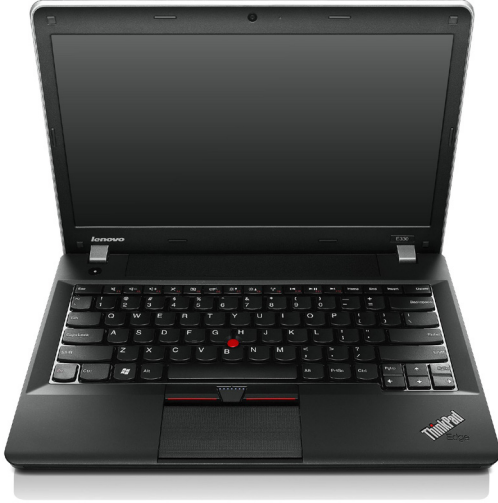
Lenovo® ThinkPad Edge E330