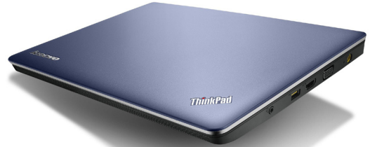
Lenovo ThinkPad Edge E330