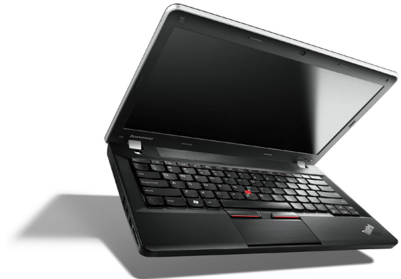
Lenovo ThinkPad Edge E330