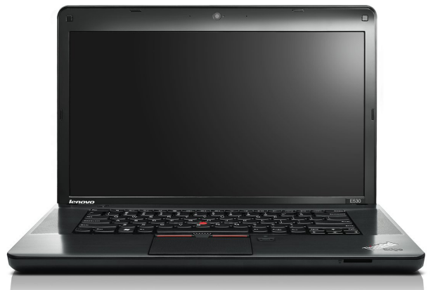
Lenovo ThinkPad Edge E530 without Numeric Keypad (Black aluminum)