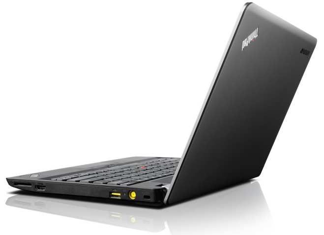
Lenovo ThinkPad Edge E130