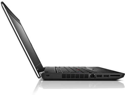
Lenovo ThinkPad Edge E330