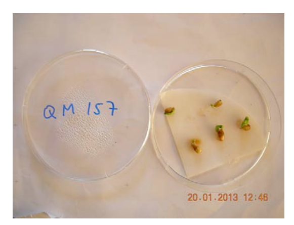
Mistletoe seed germination trials. Photo: Francisco E. Fontúrbel (2013).