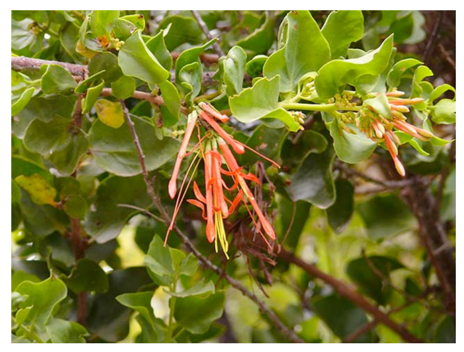
Figure 1. A mistletoe (Tristerix corymbosus) with flowers and fruits

Aim 3: To compare the magnitude, sign, and curvature of the selection gradients on the mistletoe ( Tristerix corymbosus ) fruit traits, related to the fruit removal by D. gliroides .