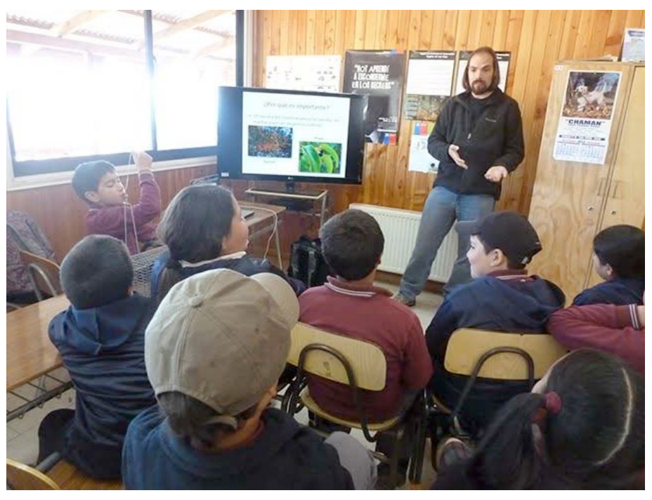
Figure 6. Workshop with 10-12 year-old children at the rural elementary school of Huape (November 2012).