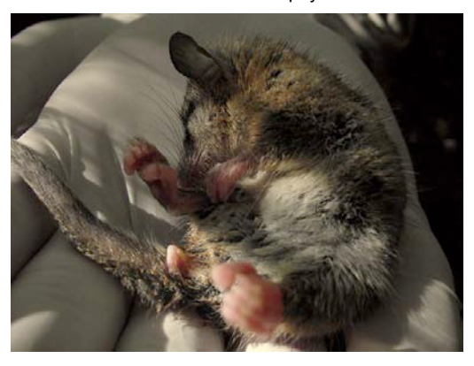
A Dromiciops gliroides captured at a native forest habitat.