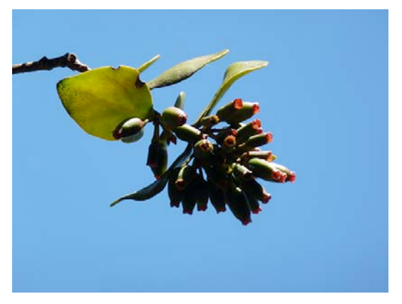
Ripening mistletoe fruits.