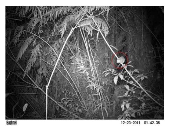
A Dromiciops gliroides individual captured at a degraded habitat stand. Bushnell Trophy Cam shot.