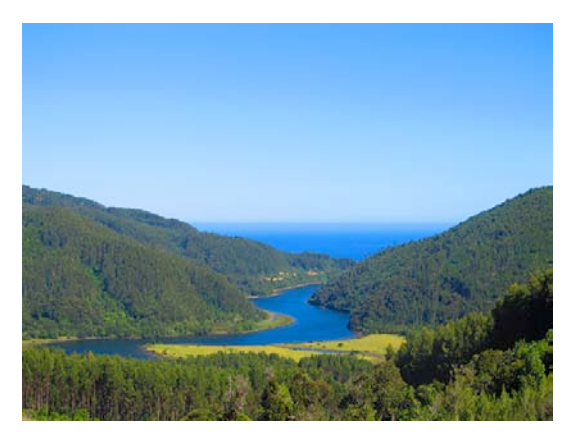
Valdivian Coastal Reserve overview.