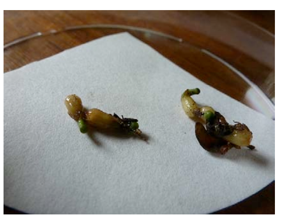
Defecated mistletoe seeds found at a seed collector: Photo: Alina Candia (2013).