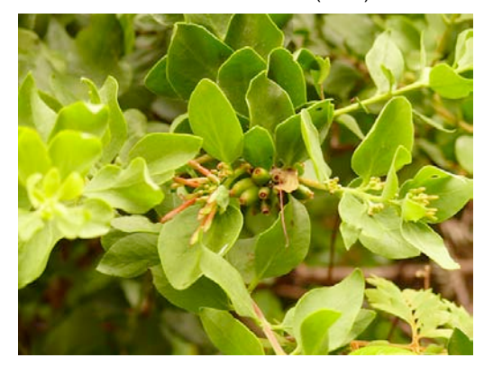
Mistletoe with ripening fruits.