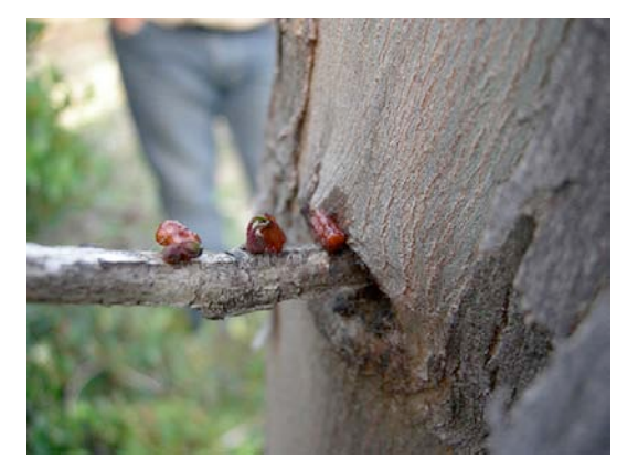
Mistletoe seedlings into a eucalyptus branch. Photo: Francisco E. Fontúrbel (2012).