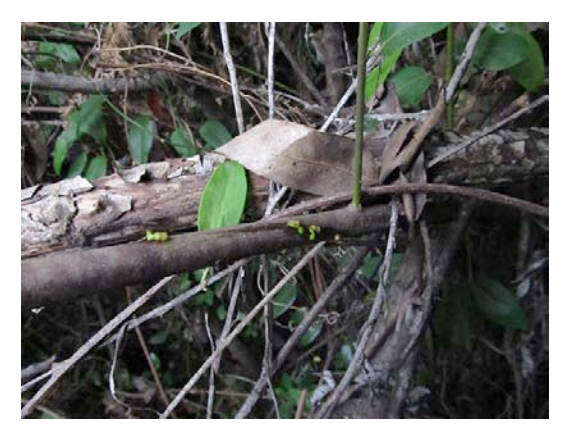
A branch of Aristotelia chilensis with many mistletoe saplings.