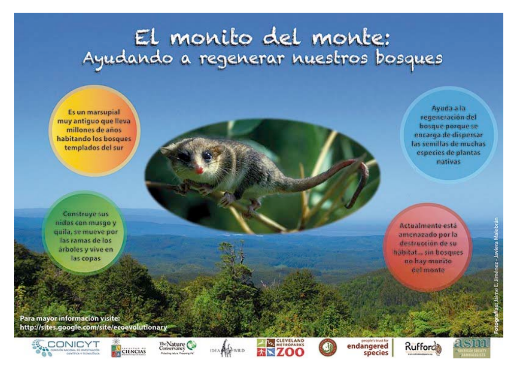
Figure 8. Educative poster produced.