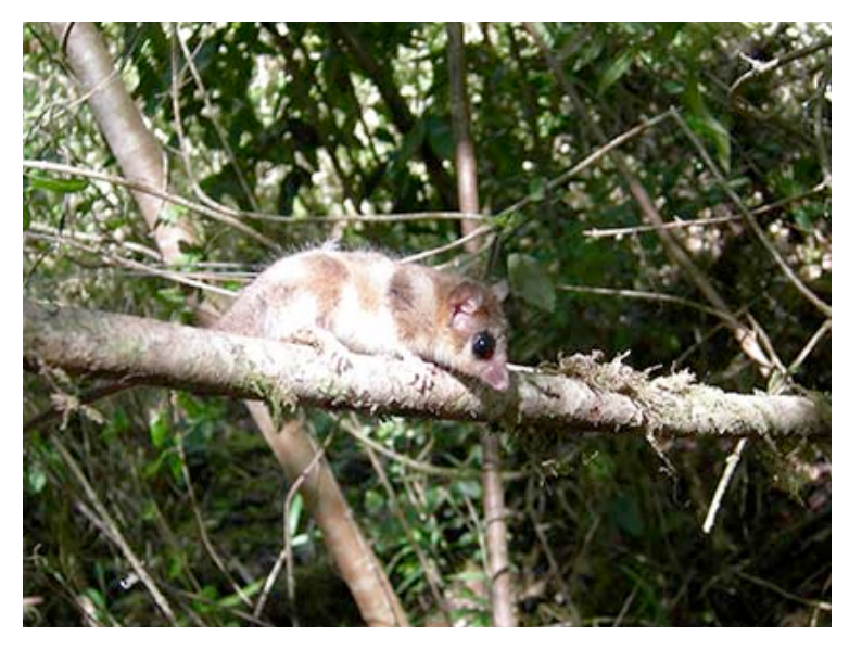
Figure 2. Dromiciops gliroides walking through a small branch.