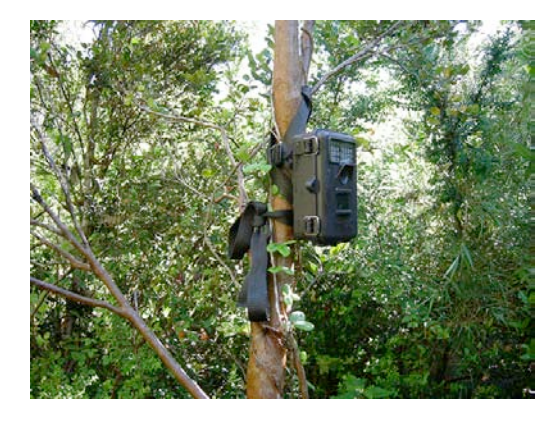
One of our camera-traps installed at native forest.

https://www.dropbox.com/s/bs99u1qbm70qzcl/PTES_pics_Fonturbel.zip