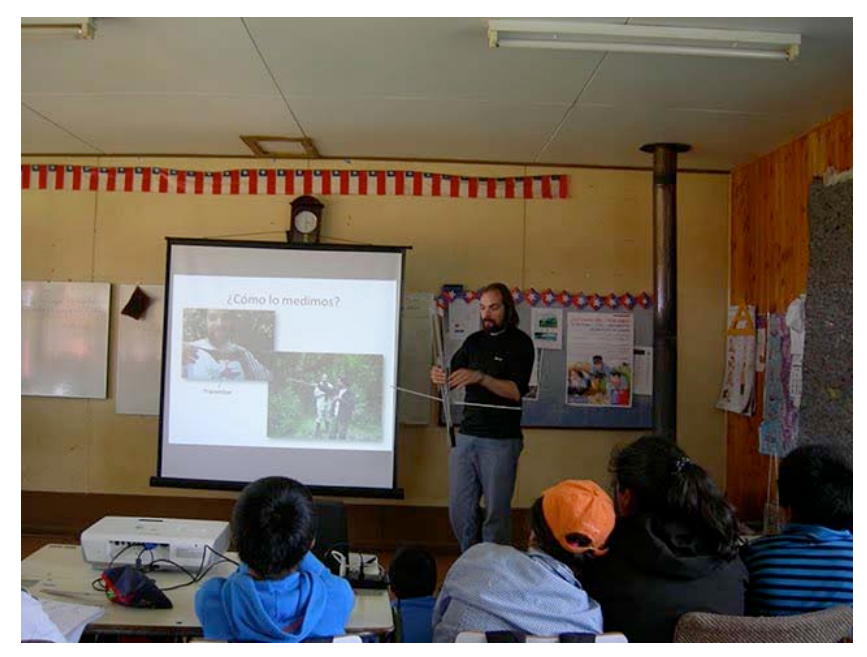
Figure 5. Workshop with 10-12 year-old children at the rural elementary school of Chaihuín (November 2012).

the protected area. Complementarily, I have designed and printer an educative poster (intended for children and people with no scientific knowledge; Figure 8) aiming to help retaining the workshop information and expecting to inform adult population as well. For detailed and updated information (project updates, field photos, videos, activities), please visit my website: <a href="http://sites.google.com/site/ecoevolutionary">http://sites.google.com/site/ecoevolutionary</a>