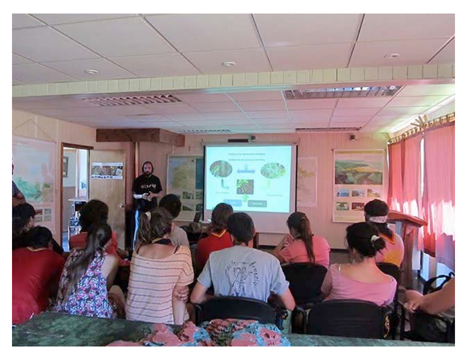
Figure 7. Workshop with young scouts (January 2013).