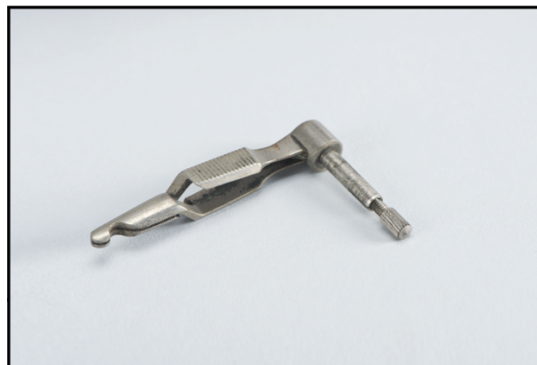
Figure 3: Fine-adjusting mechanism. The set screw was used to calibrate the height of the forceps.

The instrument was likely used in laboratories that aimed to access the hearing of study participants. I have found no evidence that the instrument was commercially used (i.e. by medical professionals). I estimate the time commitment to determine the hearing thresholds to at least a