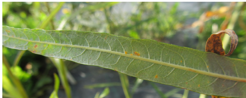
Figure 1. Photograph of a Salix viminalis leaf infected by Melampsora spp.