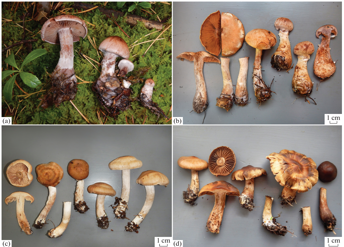
Fig. 2. Cortinarius adustorimosus (a), C. alborufescens (b), C. disjungendus (c), C. nodosiporus (d).

spores, smaller than e.g. C. suberi . In Altay the species was found in mossy, herb-rich Pinus sylvestris forest on sand-pebble deposits in the Kokshi delta. This species seems to prefer sandy pine forests, and is so far reported from a few places in Fennoscandia (Niskanen et al., 2009) and North America (Niskanen et al., 2013). This is the first report from Russia, Siberia, and apparently also from Asia.