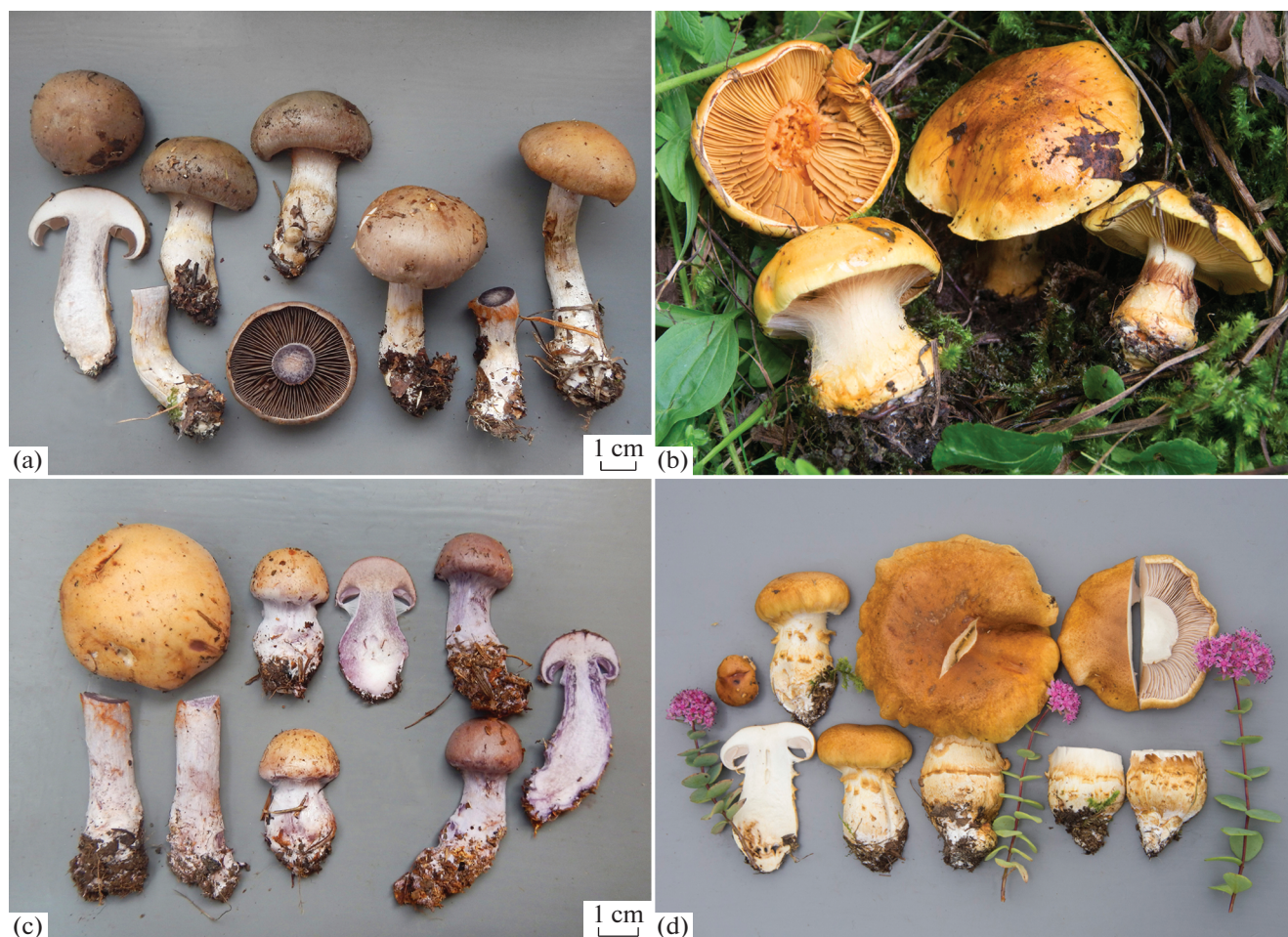
Fig. 4. Cortinarius infractus (a), C. olearioides (b), C. porphyropus (c), C. triumphans (d).

the only member of the large sect. Calochroi s.l. that was found. The species was found in a calcareous Betula pendula forest on steep slope adjacent to ski-lift, south of Mayma River at the south-east side of the city of Gorno-Altaysk. Here, the species produced fairy rings in a hot-spot also with large rings of the calciphilous telamonioid C. disjungendus and C. nodosiporus . In Europe Cortinarius olearioides is associated with calcareous, thermophilous deciduous forests with Quercus , Corylus , Carpinus and Tilia in nemoral-bore-nemoral regions. In Scandinavia, the species follows more or less calcareous Corylus woodlands, or Corylus screes into the southern boreal zone (Brandrud, Bendiksen, 2001). The occurrences of C. olearioides in (warm) Betula -forests seem to be unique to Siberia. The species is also found and verified by sequence data from the Tomsk Region (Vaishlya, pers. comm.), and the species is probably associated with Betula also here, since there is no natural Quercus – Corylus – Tilia -forests in W. Siberia. The species is reported from 11 regions of Russia, and also reports under the name C. subfulgens , such as that from Quercus forests of the Volga basin (Iwanow, Durandin, 1996), very probably