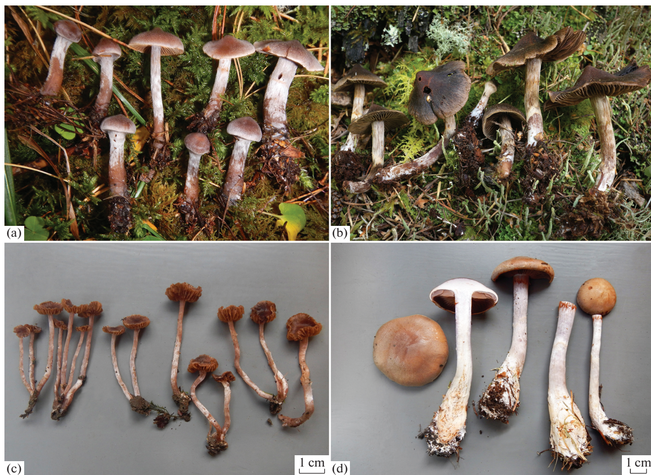
Fig. 3. Cortinarius comptulus (a), C. umbrinolens (b), C. aff. vernus (c), C. epsomiensis (d).

* Cortinarius balaustinus Fr. – Kokshi, TEB 217-18 (LE 315524).