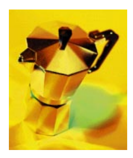
This information is intended to assist you. IBM does not warrant its accuracy or completeness.

Jar or zip files without service programs have long class search and load times. When a class has to be loaded from the zip file, the zip file is opened, its directory searched for the class, and a nonpersistent service program has to be created for each class to be executed. Because the service program is nonpersistent, this process is performed every time the zip file is used.