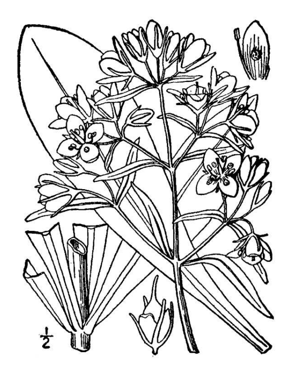
Figure 1. Frasera caroliniensis (Britton and Brown, 1913)