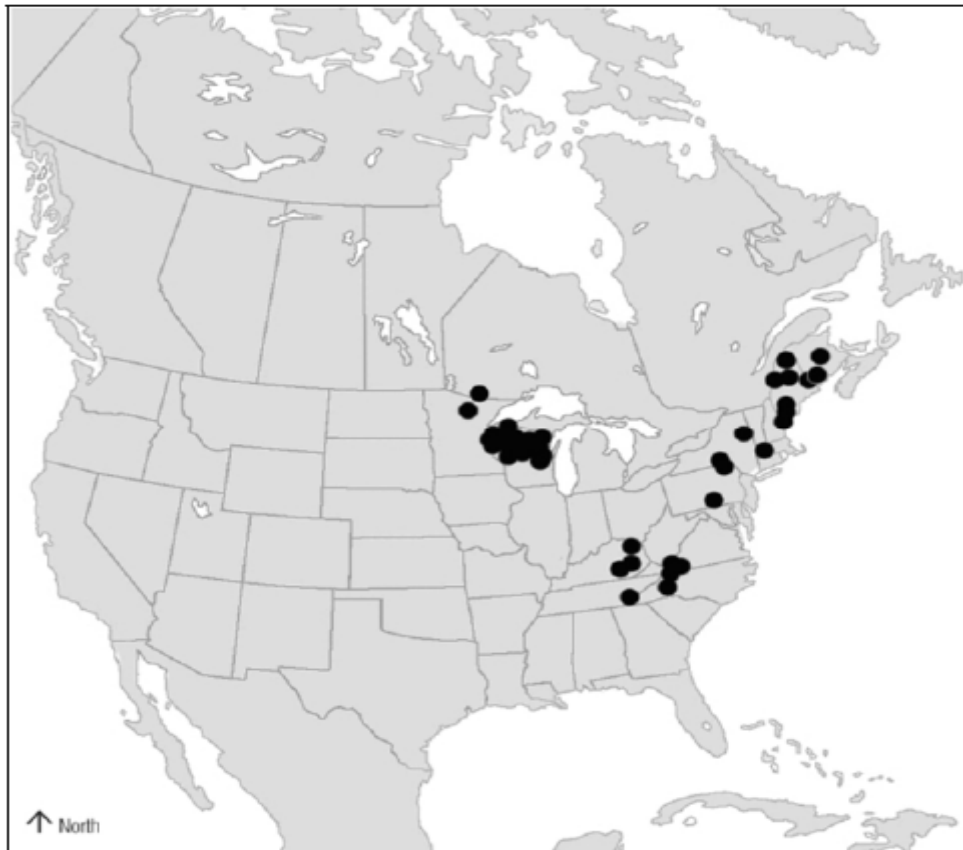
Figure 1a. The North American distribution of Pygmy Snaketail.