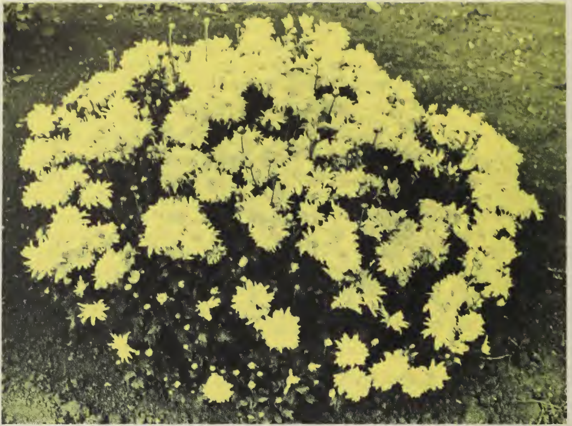
'Canary', one of the best chrysanthemums for the prairies. It has profuse, yellow, double flowers and healthy foliage.

Morden chrysanthemum breeding program. The best cultivars for the prairie region include the following: 'Morden Canary', 'Morden Eldorado', 'Morden Gaiety', 'Morden Bonfire', 'Minnesota Autumn', 'Morden Delight', 'Morden Garnet', 'Morden Cameo', 'Morden Everest', 'Susan Brandon', and 'Morden Fiesta'.