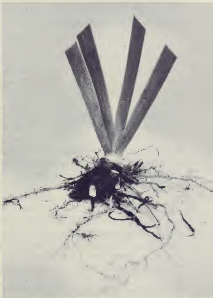
Above Bearded iris plant before division ( left ). Single division of bearded iris root ( right ). The fan of leaves is cut to an inverted V.