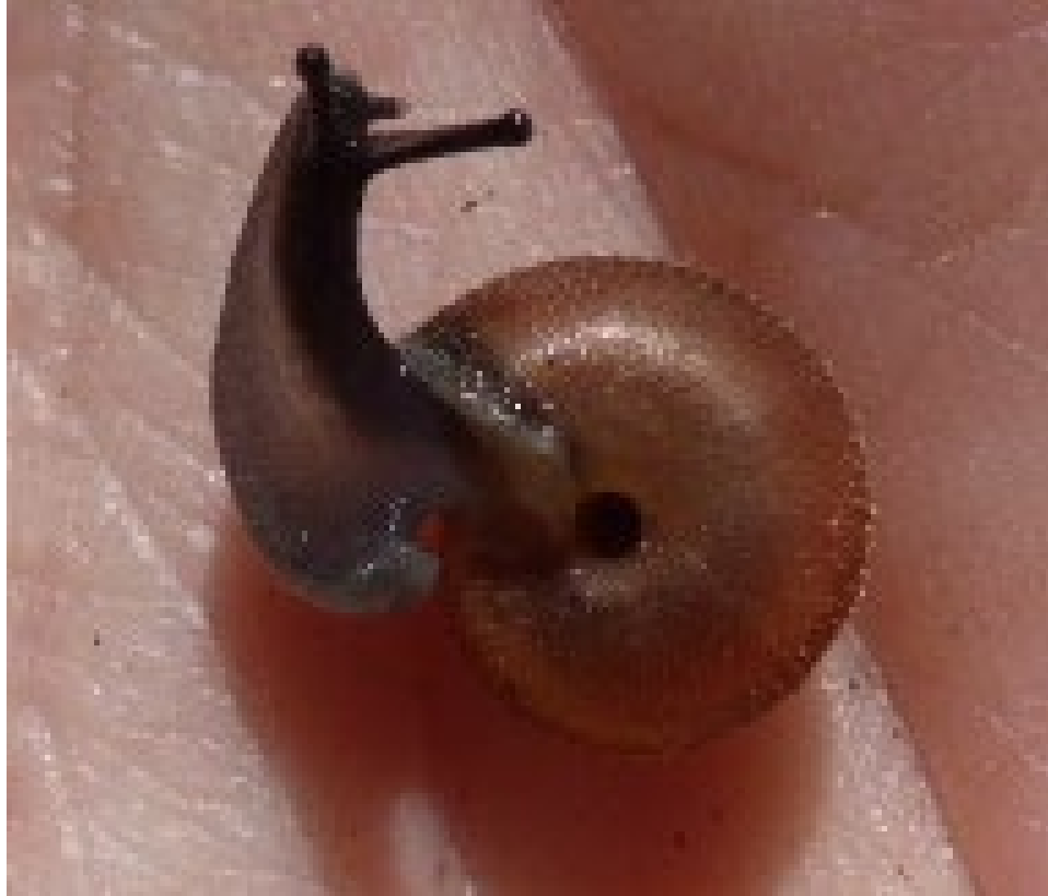
Figure 1. Juvenile Shagreen ( Inflectarius inflectus ) on Middle Island, Point Pelee National Park, 15 September 2017. The scaly periostracum resembles short hairs and the shell is still perforate.