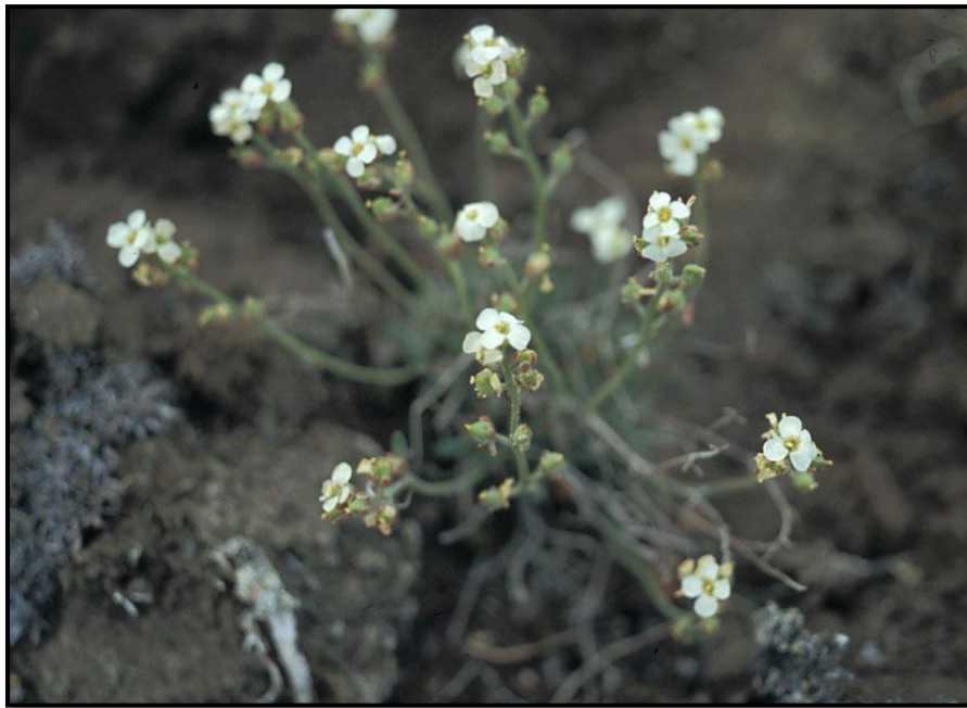
Figure 1. Photograph of hairy braya, by James G. Harris, 2004.

Hairy braya is a perennial plant that is considered long-lived (surviving for more than ten years). Its life cycle and reproduction have not been studied, but it appears to be cross-pollinated (pollination takes place between two different flowers). Hybridization may be occurring between hairy braya and smooth braya ( Braya glabella ), and possibly with Greenland braya ( Braya thorild-wulffii ). Genetic sequencing of the ITS region indicates that the closest relative of hairy braya is Greenland braya (J. Harris unpubl. data 2015) and there is good genetic separation between hairy braya and smooth braya (B. Bennett pers. comm. 2015).