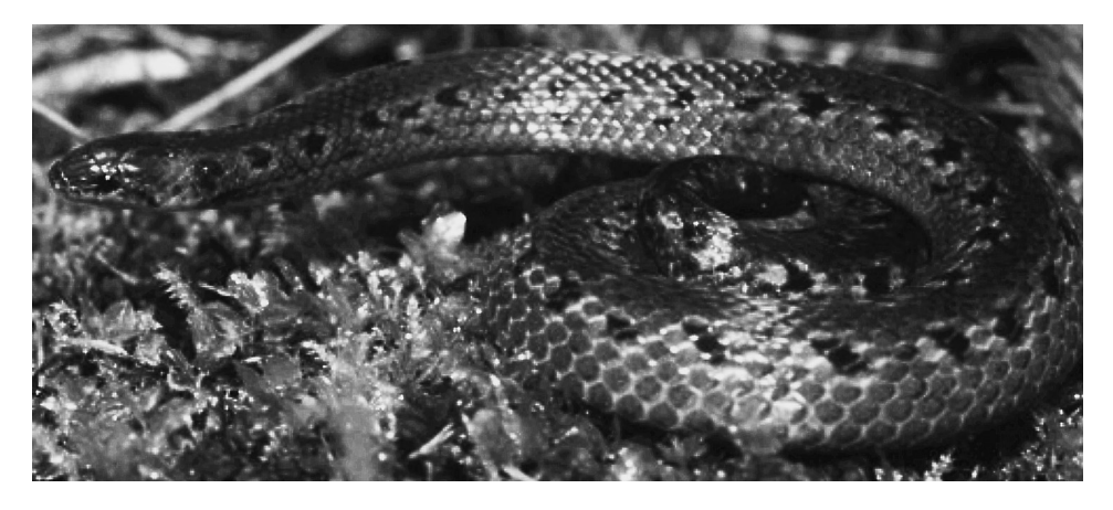
Figure 2. A living specimen (not collected) of Atractus dunni Savage from Bellavista (Pichincha, Ecuador).

26 to 37 in males; (5) ventrals plus caudals 160 to 173; (6) Dorsal pattern variable, from clear brown with a pattern composed of three series of spots to a nearly uniform dark brown with diffused shadows suggesting the series of spots. Sometimes there is a dark shadow suggesting a vertebral stripe; in some individuals there is a true vertebral stripe, but usually it is present just on the anterior part of the body, getting divided into dots or disappears at the middles and end of the body; (7) ventral pattern with light cream / brown ground with a pair of irregular dark ventral stripes separated from the first dorsals by a paired light stripes. The dark stripes get expanded in some specimen covering almost the entire ventral plates and suggesting a dark venter with clear botches; (8) an incomplete light nuchal collar, in some specimens weakly defined; (9) six to seven supralabials and five to seven infralabials; and (10) adults reaching maximum 357 mm TL in males and 353 mm TL in females.