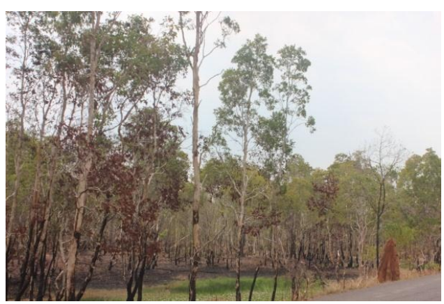
Figure 7. Undisturbed swamp forest in Sota

Undisturbed swamp forest plots were set up in Merauke, located in Malind, Sota and Tanah Miring and were dominated by Acacia crassicarpa, Melaleuca cajuputi and Melaleuca leucodendron (Figure 7).