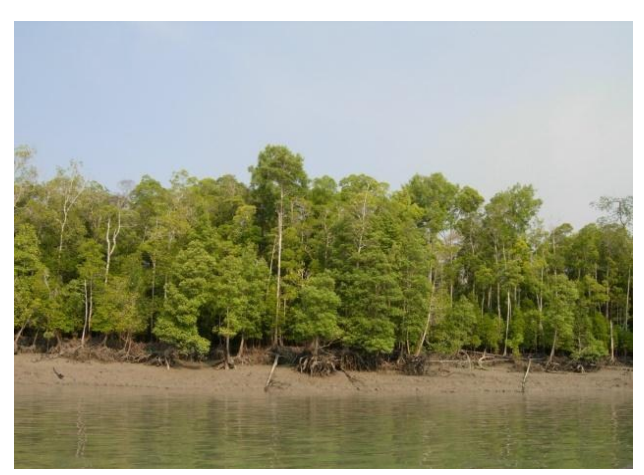
Figure 8. Undisturbed mangrove in Merauke

Undisturbed mangrove plots were set up in Merauke and Semangga and contained various mangrove species (Figure 8).