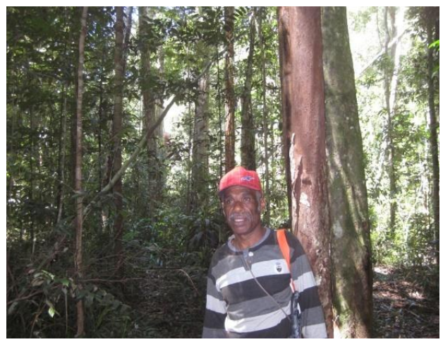
Figure 3. Undisturbed forest of Yepase village

Undisturbed dry land forest in the Jayapura plot samples ranged from low land mixed forest in Yepase (Figure 3) and Harapan village to the higher elevation of Waena village. In Jayawijaya, plot sampling occurred in Wosiala, Gotlan, Sagma II, Sekan and Wililimo villages; while in Merauke, sampling was in three villages of Yagebob, Ulilin, Muting and Eligobel.