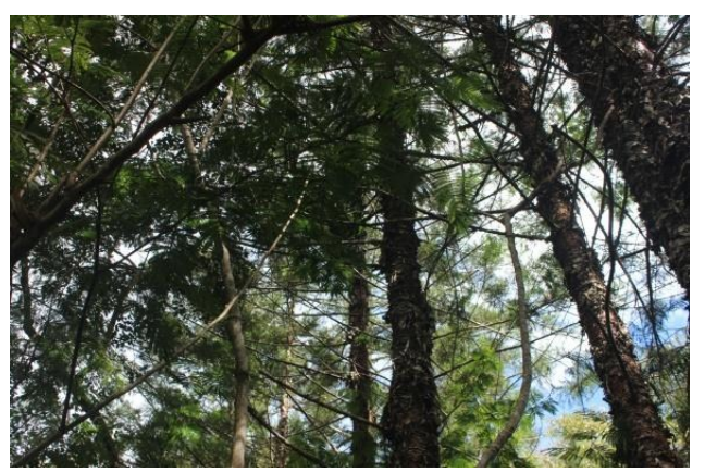
Figure 5. Pine forest in Jayawijaya

Pine forest is present in Jawajaya as part of mountain forest ecosystems that are dominated by Casuarina papuana and Araucaria cunninghammii (Figure 5).