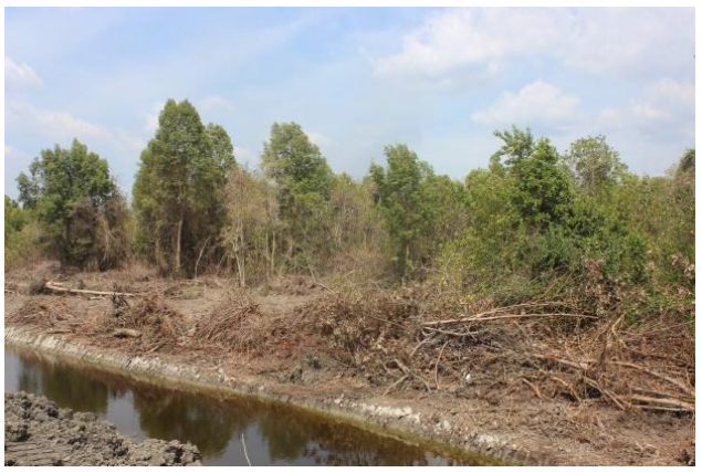
Figure 9. Disturbed mangrove in Merauke