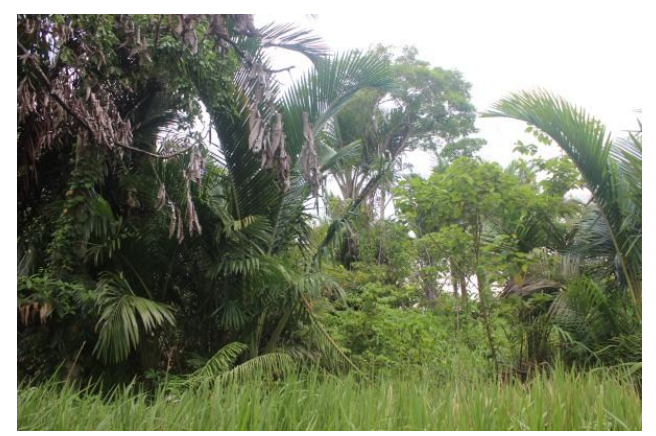
Figure 4. Mixed sago forest

Sago plot samples for Jayapura District were located in six villages of Folobo, Kehiran, Kenehulu, Kleublow, Loba and Wambena in areas of monoculture and mixed sago forest (Figure 4).