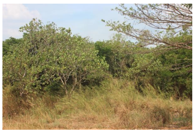
Figure 10. Shrub on dry land

Shrubs commonly grow as natural regeneration from forest after disturbance from fire or logging activity. Late succession and pioneer species are found in shrub land cover (Figure 10). Shrub plot samples were set up in Sota, Tanah Miring and Jagebob.