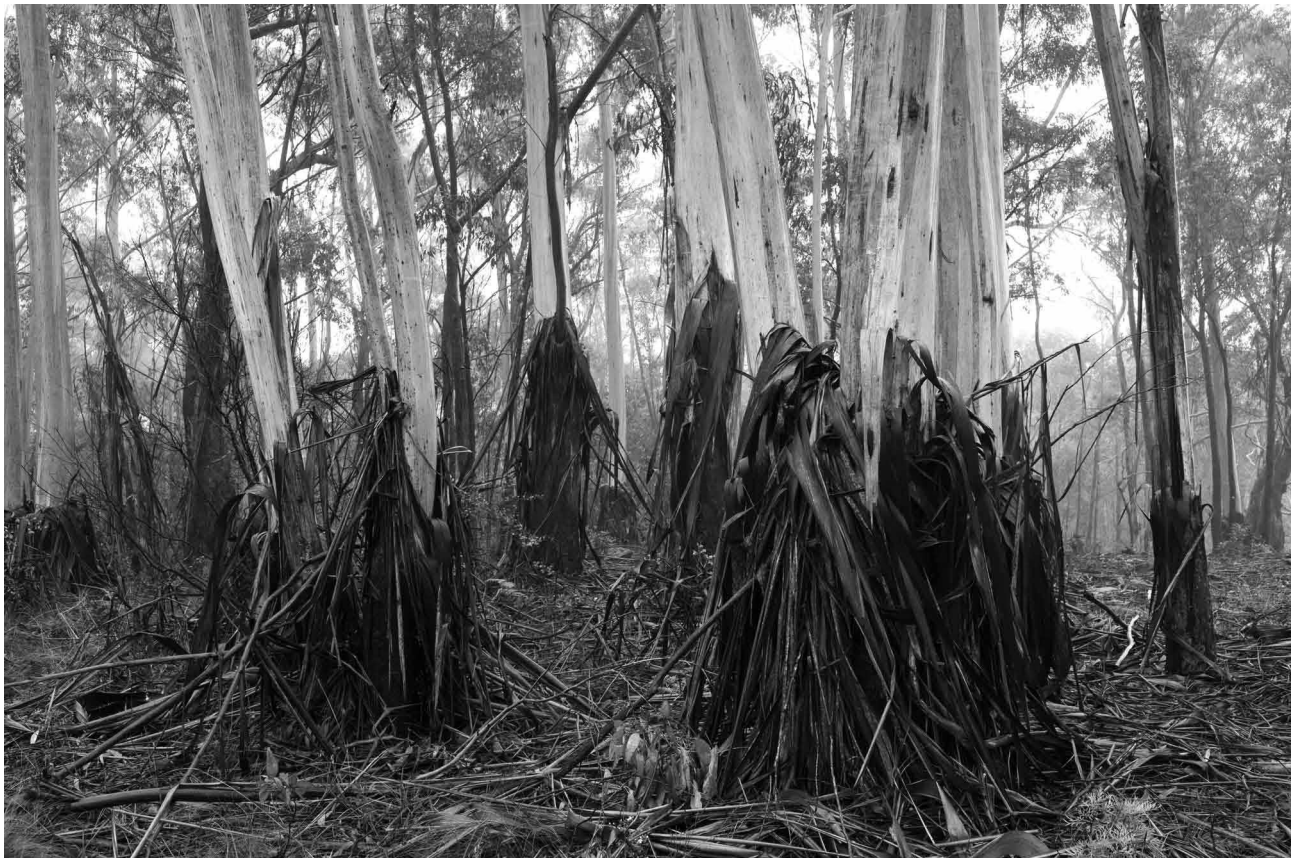
Fig. 5. Unlike most eucalypt species, mature Eucalyptus oreades trees (Blue Mountains Ash) are killed by fire; vigorous post-fire seedling recruitment leading to groves of even-aged saplings as here in the misty forests of Blue Mountains National Park.