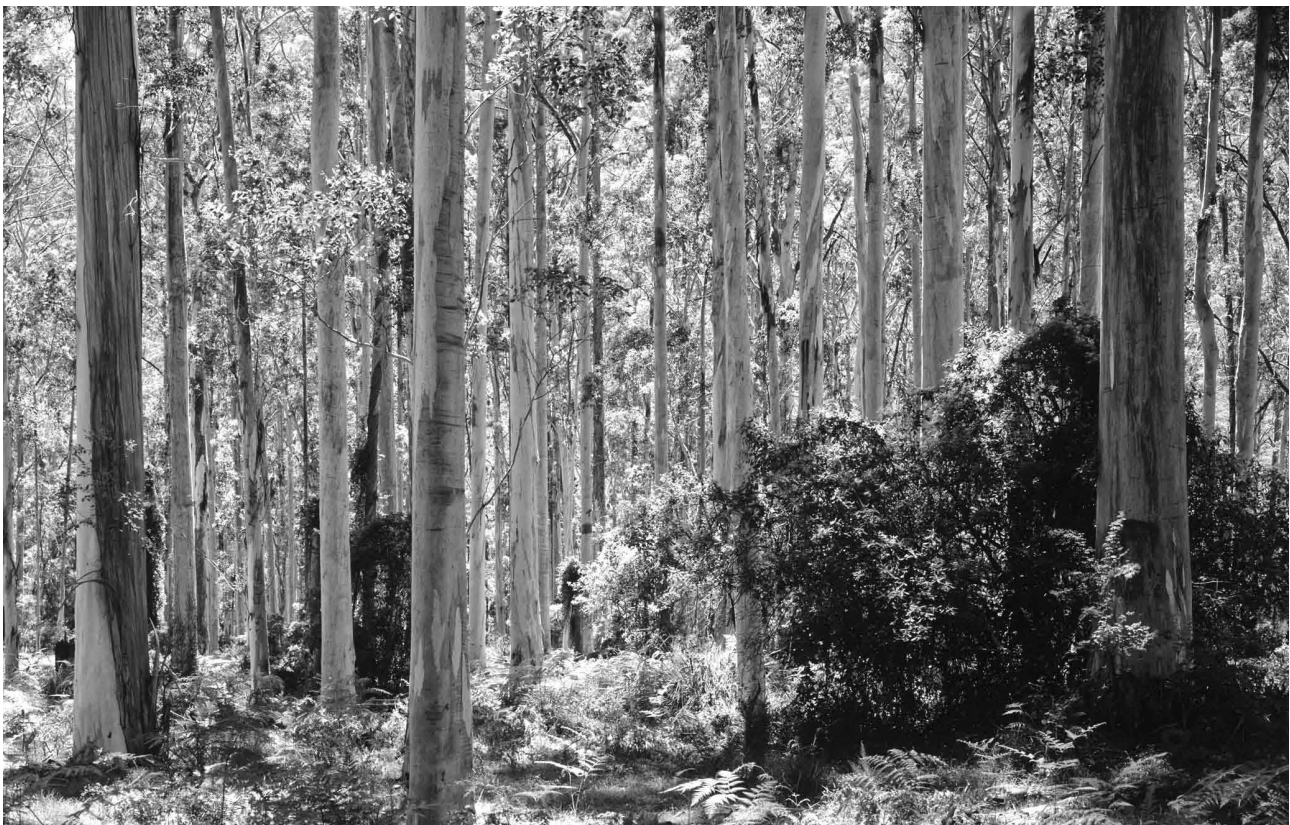
Fig. 3. Smooth straight trunks of Eucalyptus deanei in Blue Gum Forest in Blue Mountains National Park

The oldest rocks of the GBMWhA are of Siluro-Devonian age and are mainly found in the southern Blue Mountains. Tectonic plate movements and volcanic intrusions have caused considerable deformation to them. Deposition of the Sydney Basin sediments commenced in the early Permian with marine sediments and coal deposits which outcrop below the major escarpments. The sandstones that are so extensive across the region were deposited next, as river sediments in late Permian to mid Triassic. More fertile shales were occasionally deposited above these sandstones. The most recent phase were the basalt flows of the Miocene, which remain as caps on a number of mountains.