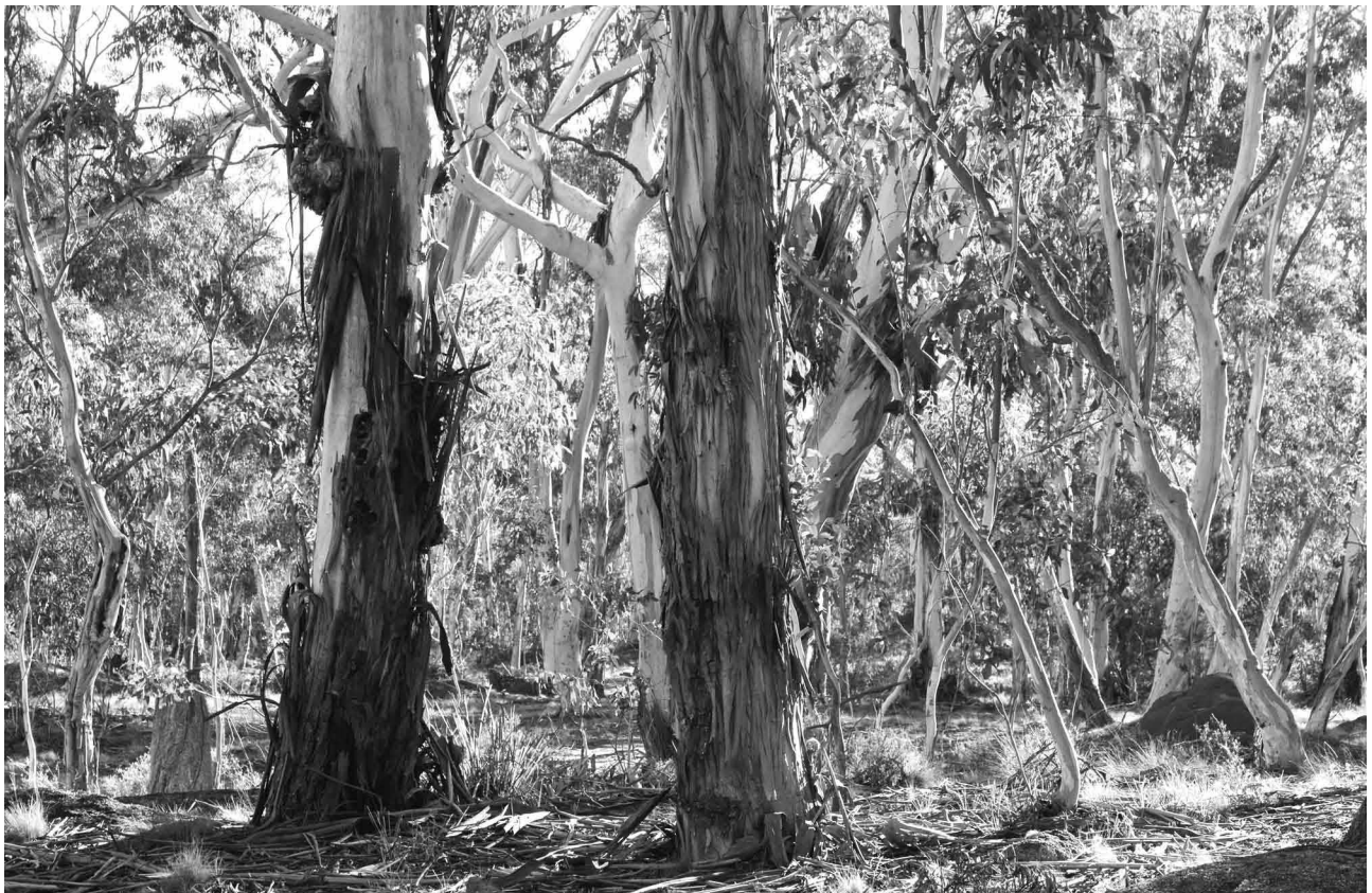
Fig. 4. Mountain Gum forest in Kanangra-Boyd National Park. Large shaggy trunks of Eucalyptus dalrympleana with smaller trees of Eucalyptus pauciflora , Snow Gum, in background.

The aspect of the slope determines how much sunlight it gets, and which winds it is more exposed to. In general, north-facing slopes are drier and hotter, supporting a different suite of smaller eucalypts than south-facing slopes. Exposed sites associated with cliff-lines in the upper mountains may frequently have the mallees e.g. Eucalyptus cunninghamii , Eucalyptus stricta , though these sites are also influenced by drainage and slope characteristics.