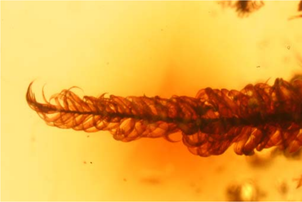
Fig. 1: Hypnum sp. (Velten 16)