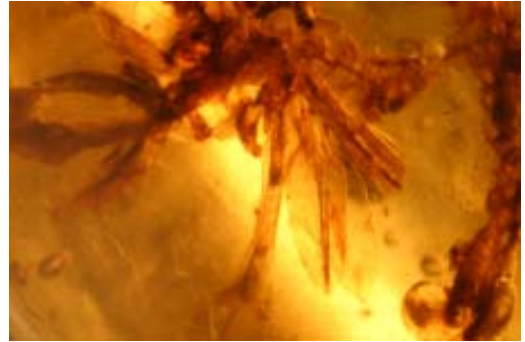
Fig. 4: Syrropodon cf. flexifolius