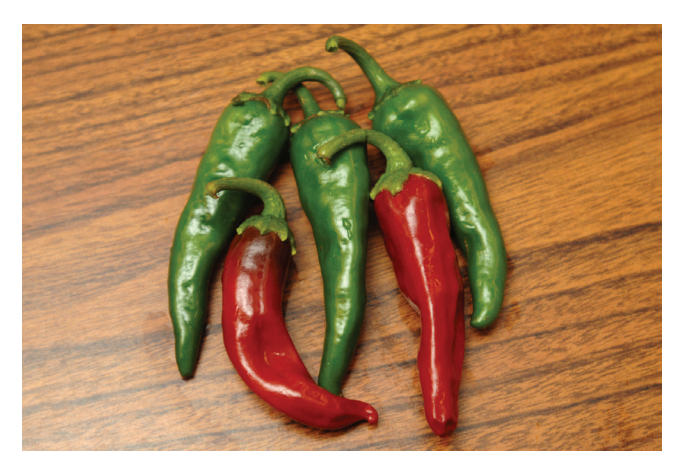
Figure 3. Fruit of the 'Escondida' landrace chile pepper.