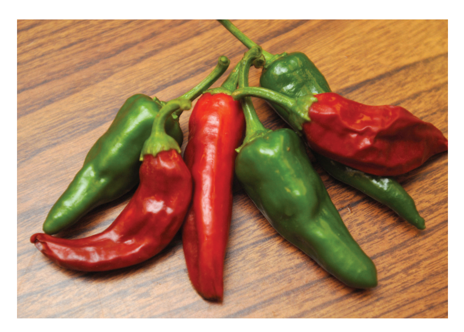
Figure 5. Fruit of the 'Zia Pueblo' landrace chile pepper.