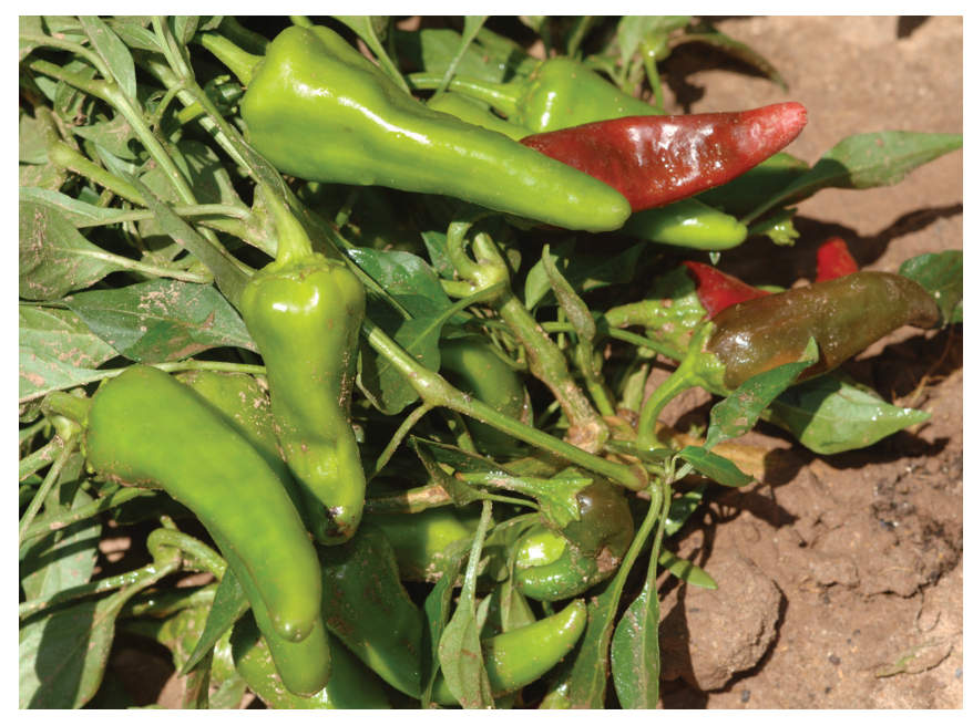
Figure 1. 'Santo Domingo Pueblo' landrace chile pepper plant with fruit in Los Lunas, 2012.

Although surviving written records indicate that chile pepper seed was first introduced to the New Mexico territory by Spanish explorers in the late 1580s, pre-Columbian trade routes suggest possible introduction before the arrival of the Spanish (Andrews, 1999). Written records document an introduction of chile pepper before the year 1600, indicating that the New Mexico landrace chile peppers were developed over a period of more than 400 years as seed was saved from ripe red fruit that had matured before the season's first freeze and from plants that survived local environmental stresses. The seed from landrace chiles was passed on from generation to generation, bringing forward genetic traits that