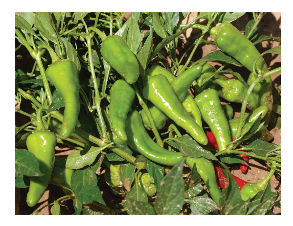
Figure 6. A 'San Felipe Pueblo' landrace chile pepper plant with fruit in Los Lunas, 2012.