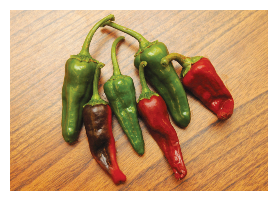
Figure 4. Fruit of the 'Velarde' landrace chile pepper.