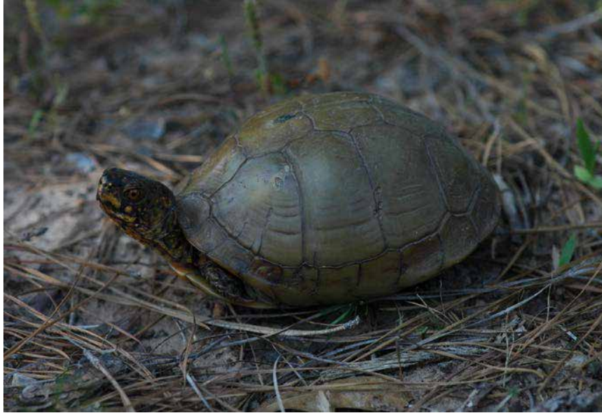
Figure 10. A three-toed box turtle ( Terrapene carolina triunguis ), so named because of the number of toes on the back feet, at Caddo Lake National Wildlife Refuge, Texas. Their range extends from east Texas to the Florida Panhandle.

Numerous species of birds reside year-round or migrate through the refuge during spring and fall including eastern bluebird ( Sialia sialis ), American woodcock ( Scolopax minor ), yellow-breasted chat ( Icteria virens ), rufous-sided towhee ( Pipilo erythrophthalmus ), and white-throated sparrow ( Zonotrichia albicollis ). Butterflies and numerous other insects can be seen along the roadsides in spring and fall (fig. 11). Widening of grassy areas along the refuge's Auto Route and other interior roads could provide additional habitat for native pollinators and other grassland insect species.