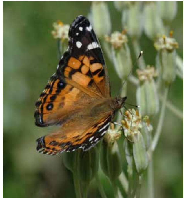
Figure 11. American lady butterfly ( Vanessa virginiensis ) nectaring on the flowers of groovestem Indian plantain ( Arnoglossum plantagineum ) on a roadside along the Auto Route in Caddo Lake National Wildlife Refuge, Texas. A wide variety of butterflies and skippers occur on the refuge.

Roadsides within the refuge provide a colorful show of wildflowers. Trees, with their leaf, flower, and seed displays, create a vivid natural experience for visitors. Many of the species listed as constituents of shortleaf pine understory are present on the refuge and could be restored as part of the refuge's goal of restoring shortleaf pine savanna. Such a restoration strategy would enhance the value of these forests for wildlife, as well as create a more rewarding experience for refuge visitors.