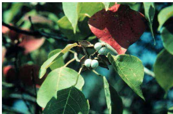
Figure 6. Chinese tallow tree ( Triadica sebifera ), an invasive nonnative species that is currently controlled by refuge management at Caddo Lake National Wildlife Refuge, Texas. Pictured here in the fall of the year is a branch bearing white seeds and leaves beginning to turn colors.

Of the 511 taxa identified in this study, 62 were introduced (table 2 at end of report). Most nonnative species have become naturalized and make up a small part of the flora, although several are invasive and pose a risk to native vegetation and wildlife habitat quality. Chinese tallow tree ( Triadica sebifera ) is highly invasive and is a management priority for refuge staff (figs. 6 and 7). Other nonnative trees including flowering pear ( Pyrus calleryana ), silk tree ( Albizia julibrissin ), and Chinaberry tree ( Melia azedarach ) are