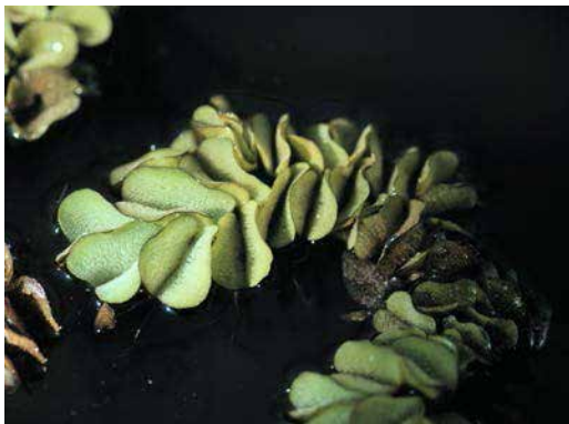
Figure 9. Giant salvinia ( Salvinia molesta ), considered one of the world's worst aquatic pests. It has become a major problem on Caddo Lake at Caddo Lake National Wildlife Refuge, Texas.

Giant salvinia ( Salvinia molesta ), considered one of the world's worst aquatic pests (Oliver, 1993), has become a major problem in Caddo Lake (fig. 9). A native of Brazil (Everitt and others, 2007), giant salvinia impedes navigation and reduces sunlight and oxygen, killing beneficial plants, insects, and fish. It can clog agricultural irrigation ditches