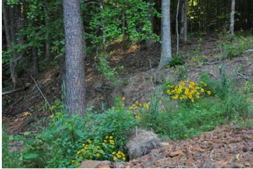
Figure 4. Pine-hardwood forest predominant on slopes and other well-drained sites in Caddo Lake National Wildlife Refuge, Texas.