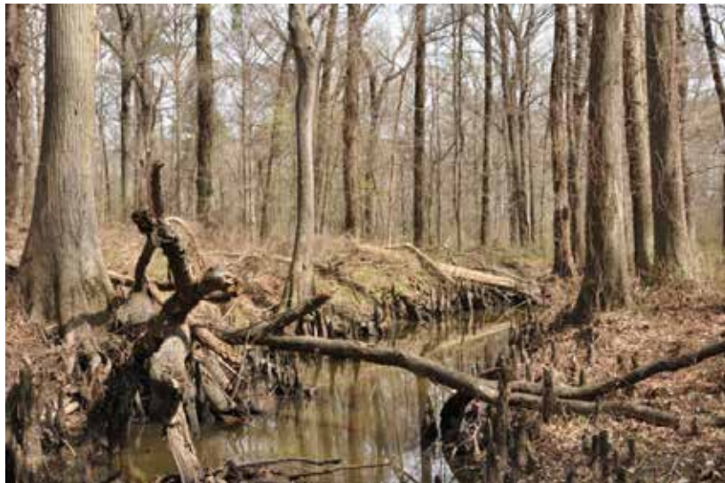
Figure 5. Bottomland hardwoods dominated by baldcypress ( Taxodium distichum var. distichum ) along drainages and in frequently flooded parts of Caddo Lake National Wildlife Refuge, Texas.