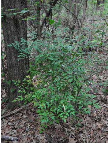
Figure 8. An invasive understory shrub, sacred bamboo ( Nandina domestica ), that was collected on a small outholding of Caddo Lake National Wildlife Refuge, Texas, north of Texas Farm to Market Road 2198 (FM 2198).

Giant salvinia ( Salvinia molesta ), considered one of the world's worst aquatic pests (Oliver, 1993), has become a major problem in Caddo Lake (fig. 9). A native of Brazil (Everitt and others, 2007), giant salvinia impedes navigation and reduces sunlight and oxygen, killing beneficial plants, insects, and fish. It can clog agricultural irrigation ditches