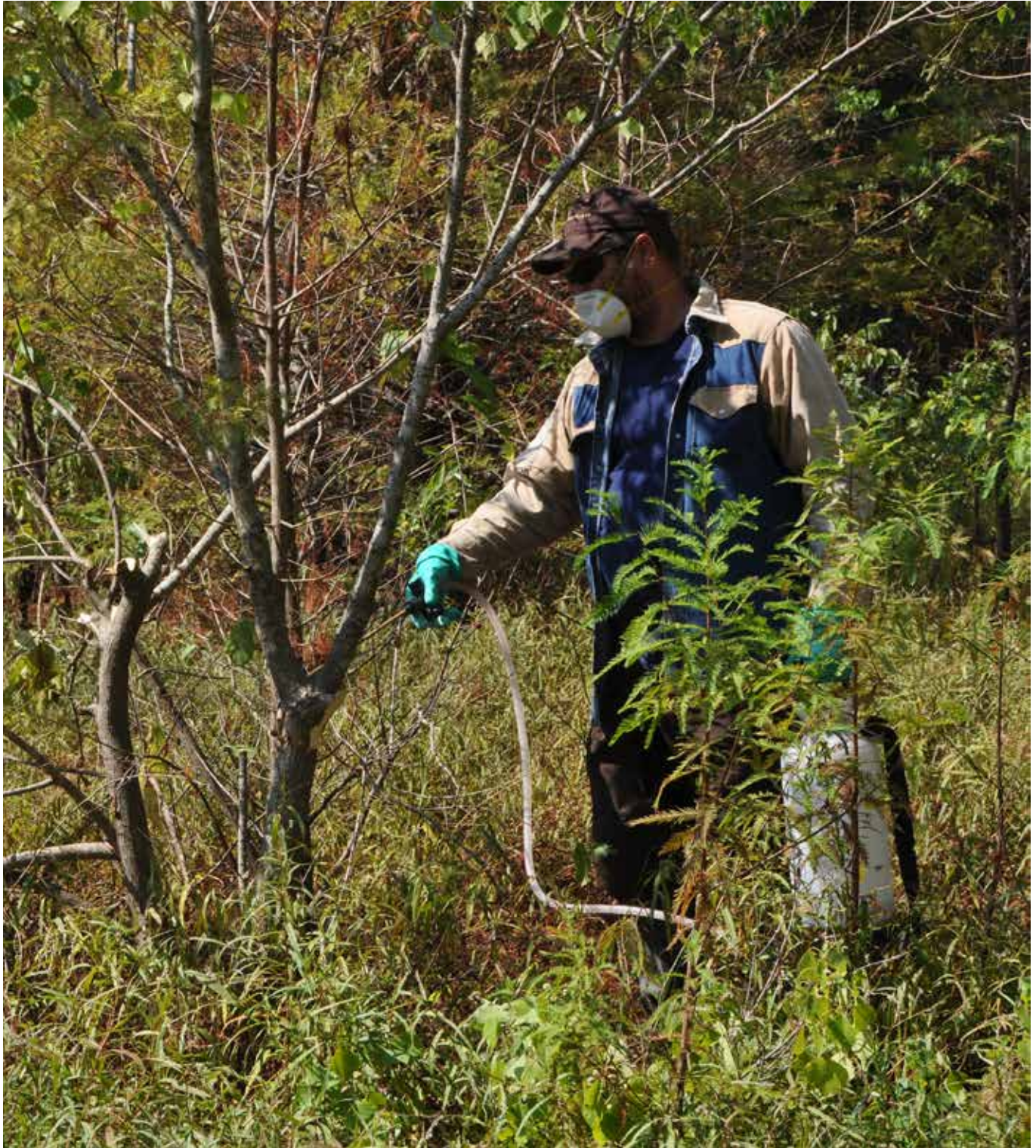
Figure 7. Staff of Caddo Lake National Wildlife Refuge, Texas, using herbicide to treat small Chinese tallow trees ( Triadica sebifera ) before these nonnative, highly invasive trees can bear seeds and colonize additional area.