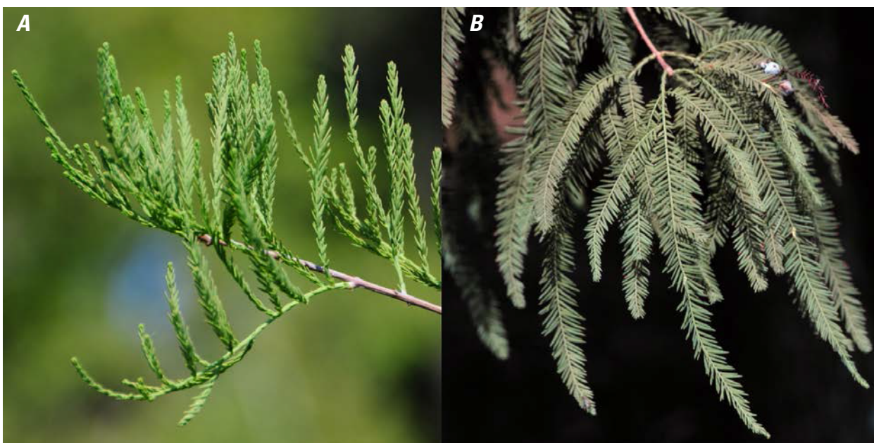
Figure 3. The differences in leaf form of two varieties of Taxodium distichum occurring on Caddo Lake National Wildlife Refuge, Texas. A, Taxodium distichum var. imbricarium , a new taxon for Texas, has scale-like leaflets on upward oriented leaves. B, Taxodium distichum var. distichum has descending leaves and linear leaflets.

Tree species that occurred in low areas along creek drainages and in frequently flooded parts of the refuge include baldcypress, overcup oak ( Quercus lyrata ), water oak, willow oak, green ash ( Fraxinus pennsylvanica ), bitter pecan ( Carya aquatica ), and sweetgum (fig. 5). Common smaller trees and shrubs include planertree ( Planera aquatica ), swamp privet ( Forestiera acuminata ), water locust ( Gleditsia aquatic ), buttonbush ( Cephalanthus occidentalis ), and possumhaw ( Ilex decidua ). Herbaceous ground cover in wet areas included mostly sedges, rushes ( Juncus spp.), smartweeds ( Persicaria spp.), heliotrope ( Heliotropium indicum ), camphorweeds ( Pluchea spp.), lizard's tail ( Saururus cernuus ), primrose-willows ( Ludwigia spp.), and rosemallow ( Hibiscus moscheutos ssp. lasiocarpos ). Vines most common in these areas were climbing hempvine ( Mikania scandens ), buckwheat vine ( Brunnichia ovata ), and climbing dogbane ( Thyrsanthella difformis ).