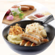
Grilled Pork Sausages