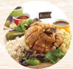
Crispy Oven-Roasted Pork Knuckle