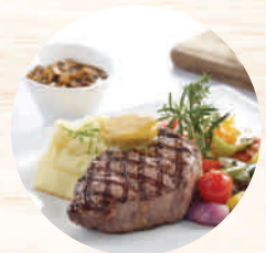
Premium Grilled Tenderloin