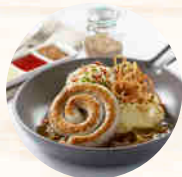
Thüringer Snail Sausages