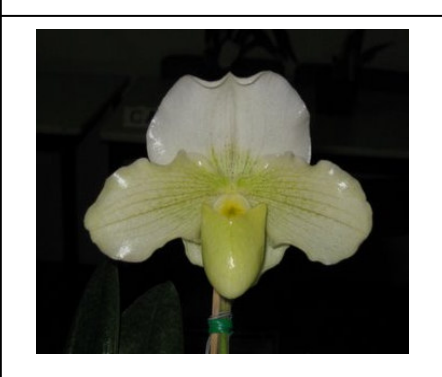
Paph. White Knight Plant :-Grower:-Tierney M