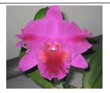
Plant :-C. Unknown Grower:-Tierney M