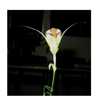
Plant:-Stelis peliochyla Yong Gee G Grower:-