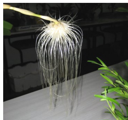
Plant :-Bulb. medusae Grower:-Yong Gee G