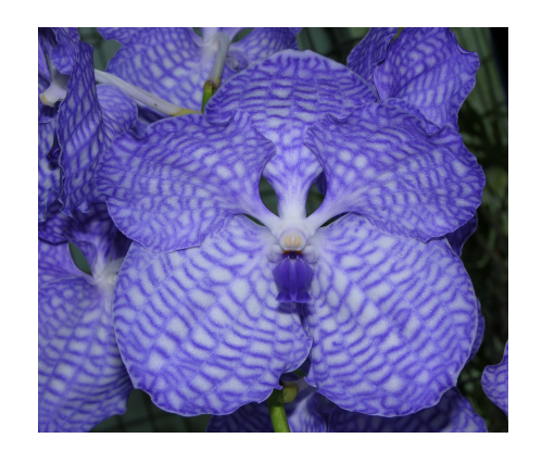
V. coerulea 'True Blue' Grown by McCubbin J & M Awarded AM/QOS 31/12/2008 Points 82.7, Length 101mm, Width 107mm