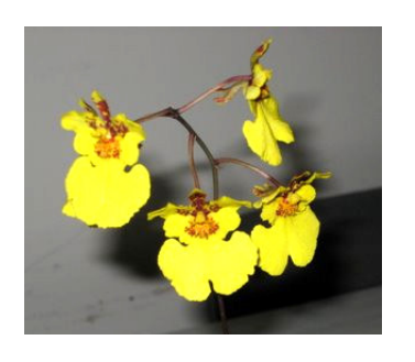
Plant :-Zlm. (Onc.) Liz 'Full Moon' Grower :- Haynes F