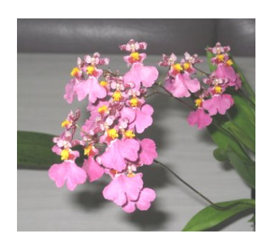
Plant:-Ocd. (Onc.) Kutoo Grower:-Kidd I R