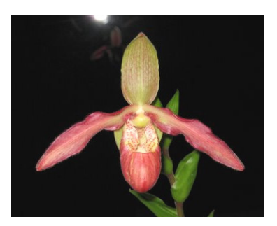
Plant :-Phrag. richteri x Dick Clements