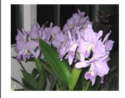
Plant :-Ctt. (C.) Portiata Grower:- Roulstone N & T