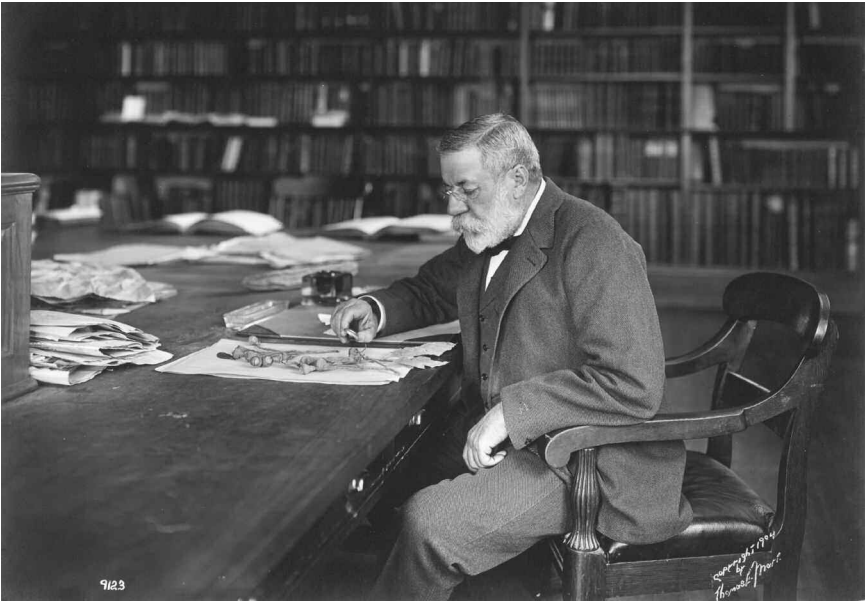
FIGURE 6. Dr. Charles Sprague Sargent, Director, Harvard University Arnold Arboretum (Photo ca. 1910;).