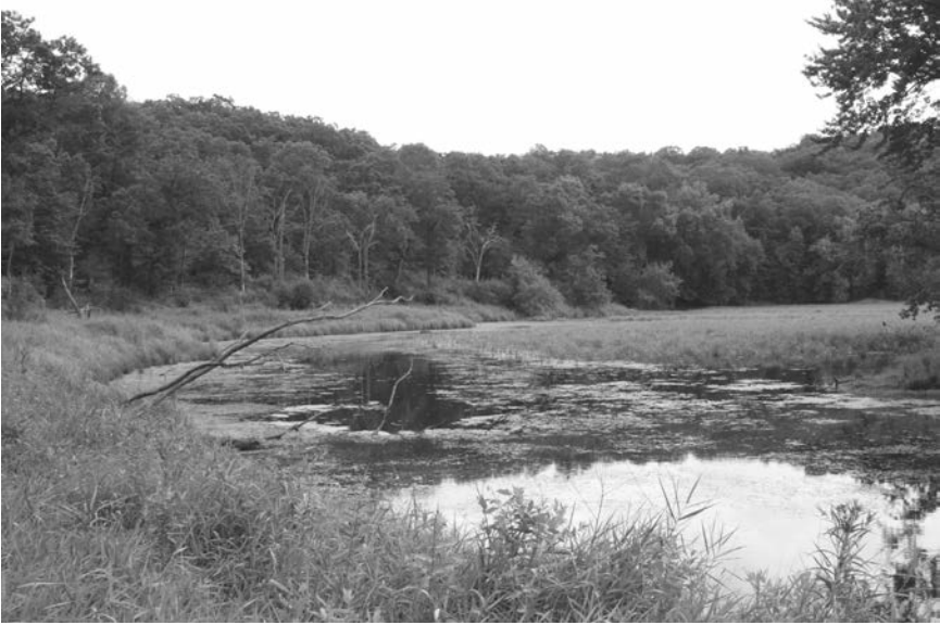
FIGURE 10. The north end of the river backwater named Folsom Lake. River bulrush ( Bolboschoenus fluviatilis ) dominates in the right center area of the photograph. The open water contains long-leaved pondweed ( Potamogeton nodosus ) and slender pondweed ( P. pusillus ). Photograph by Derek Anderson, July 27, 2012.