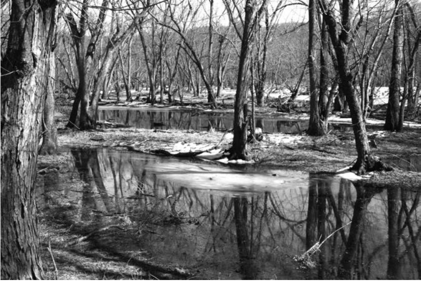
FIGURE 4. The floodplain forest along the St. Croix River in early spring. The forest is dominated by silver maple ( Acer saccharinum ); hackberry ( Celtis occidentalis ) and cottonwood ( Populus deltoides ) are also present. Water begins to pool in old channels as the snow and ice begin to melt. The water in this area of the Park can easily rise an additional 3 to 6 meters (10 to 20 feet) as spring rain and seasonal snowmelt occurs in the greater watershed. Photograph by Derek Anderson, April 2, 2011.