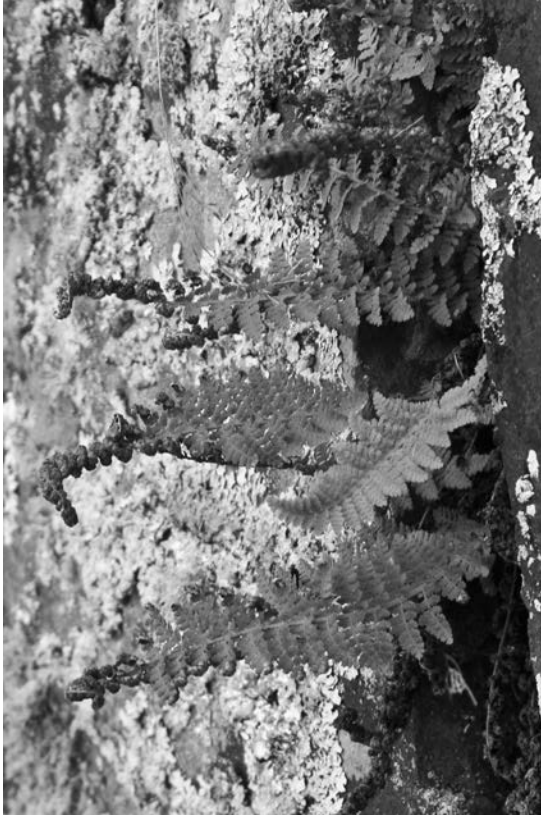
FIGURE 6. The state special concern fragrant fern ( Dryopteris fragrans ) has long been documented in the area of the Park. It is typically found growing from the cracks of basalt near the St. Croix River.

river channels, such as in the area of Meadow Valley. At the bases of some of these cliffs are large talus slopes and fields where the basalt has weathered from the cliffs. The sandstone cliffs are most prominent in the southern region of the Park west of the Silverbrook Mansion and are not readily accessible by trail.