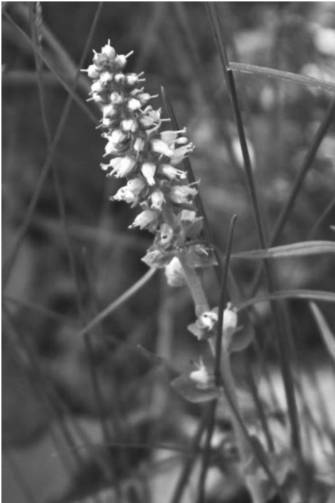
FIGURE 7. Kitten tails ( Besseya bullii ) in an oak woodland near a transition between woodland and bedrock glade. This species is listed as threatened in Wisconsin. Photograph by Derek Anderson, June 2, 2013.

The oak woodland plant community is found between the bedrock glades and the dry-mesic forests throughout the Park. It is also found as an inclusion within the mesic forests where large portions of bedrock are exposed. Typically, this community has an interrupted or patchy canopy, dominated by Quercus macrocarpa , Q. alba , and Q. ellipsoidalis . Juniperus virginiana is an associate in some stands. Shrubs are sparse, but include Corylus americana , C. cornuta , Rhus typhina , R. glabra , and Zanthoxylum americanum . The ground layer includes Elymus hystrix , Andropogon gerardii , Solidago spp., Toxicodendron rydbergii , and Galium boreale . This community also provides habitat for the state Threatened Besseya bullii (Figure 7).