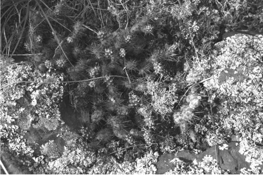
FIGURE 9. The brittle prickly pear cactus ( Opuntia fragilis ) is listed as threatened in Wisconsin. This species is restricted to areas of bedrock glade habitat within the Park. Photograph by Derek Anderson June 28, 2011.

larger context of Phalaris arundinacea . These remnants tend to be dominated by Carex lacustris , although a few are dominated by Carex stricta . Other graminoids found in this community include Glyceria canadensis , G. striata , Poa palustris , Calamagrostis canadensis , and several species of Carex and Scirpus . Several forbs are also present, including Doellingeria umbellata , Eutrochium maculatum , Epilobium ciliatum , E. leptophyllum , Asclepias incarnata , and Campanula aparinoides .