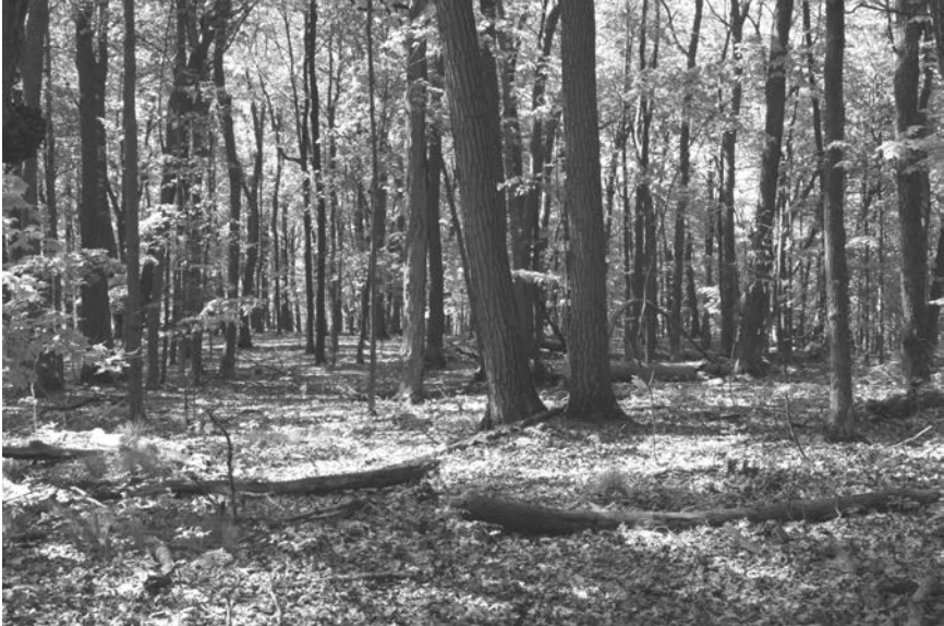
FIGURE 3. Typical forest community on south-facing slopes and ridge tops that lack bedrock near the surface. The forest is dominated by red oak ( Quercus rubra ) and basswood ( Tilia americana ). Sugar maple ( Acer saccharum ) is common in the understory, and there is a diverse ground layer. Photograph by Derek Anderson, May 10, 2012.

are dominated by Acer saccharum . Occasionally Quercus rubra , Tilia americana , Carya cordiformis , Fraxinus americana , and F. pennsylvanica are canopy co-dominants. The understory is dominated by Acer saccharum and Ostrya virginiana . The ground layer is diverse and consists of Trillium grandiflorum , T. cernuum , Hepatica americana , H. acutiloba , Hydrophyllum virginianum , Adiantum pedatum , Athyrium filix-femina , Caulophyllum thalictroides , and many other spring ephemerals.