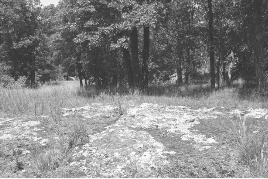
FIGURE 8. One of several bedrock glades found throughout the Park. Lichen and moss covered basalt is in the foreground. Prairie vegetation and oak woodlands with Quercus macrocarpa , Q. ellipsoidalis , and Q. alba surround the exposed bedrock. Photograph by Derek Anderson, July 23, 2011.