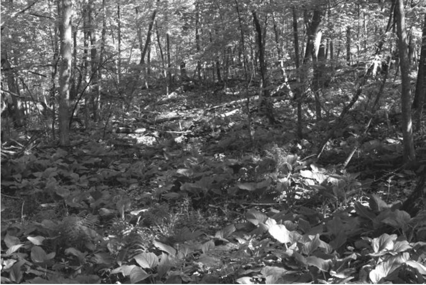
FIGURE 5. A forested seep located along the slopes above the St. Croix River. The canopy is patchy and dominated by black ash ( Fraxinus nigra ). The ground layer is dominated by skunk cabbage ( Symplocarpus foetidus ). Photograph by Derek Anderson, May 12, 2012.

zones in these areas underlie a patchy canopy dominated by Fraxinus nigra , with Ulmus americana and Betula allegheniensis as occasional co-dominants. Slight rises in the topography surrounding the seepage areas tend to support Acer saccharum and Tilia americana . In the areas of ground water seepage, Symplocarpus foetidus is dominant (Figure 5), and there is a continuous cover in the ground layer. Other species present in the seeps include Impatiens capensis , Hydrocotyle americana , Viola sororia , Poa palustris , Packeria aurea , and Micranthes pennsylvanica . Many of these seeps feed small streams that eventually reach the St. Croix River.