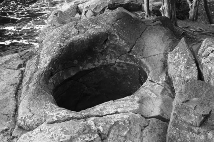
FIGURE 1. A glacial pothole carved into the basalt bedrock along the St. Croix River. Photograph by Derek Anderson, October 1, 2010.

dating, B. occidentalis persisted in the region for about 4,000 years, with the greatest presence between ca. 8,000–7,000 calibrated years B.P. (Hawley et al. 2013). Over 1400 bison, deer, and elk bones were recovered from the excavation site, as well as one copper tool.