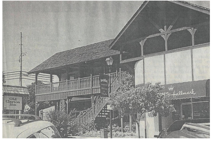
Exterior embellishments were added later in the twentieth century, which completely altered the hotel's appearance.