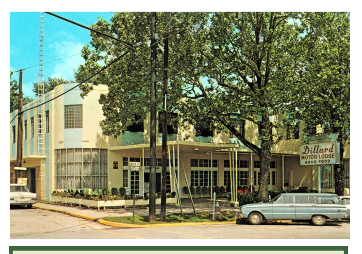
For a while, during the 1970s, this version of the inn was known as the Dillard Motor Lodge.