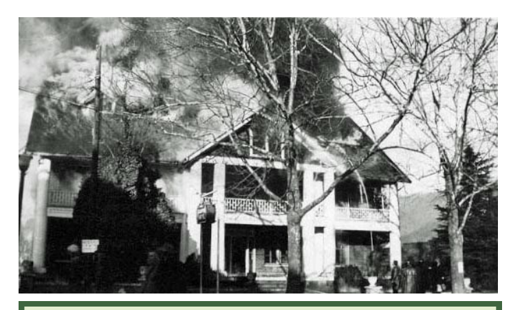
A devastating fire in January of 1946 completely destroyed the hotel and its contents.