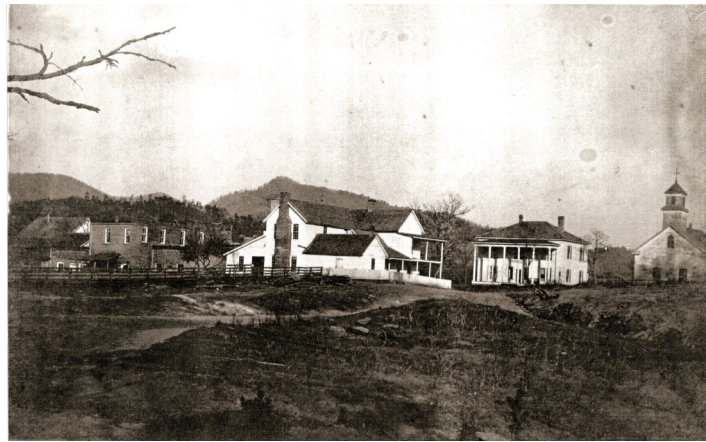
This photograph is a view of the Clayton Hotel from the rear. Across the street is the Dozier Hotel, later known as the Green Hotel, and Clayton Methodist Church

Several proprietors followed the Langstons, including Colonel Dozier who owned the hotel across Main Street. The Holdens, the Greens and Louise Dillard Coldren were among the owners in later decades. The hotel's name also changed over the years, from the Clayton Hotel to the Dillard Motor Lodge to the Old Clayton Inn.