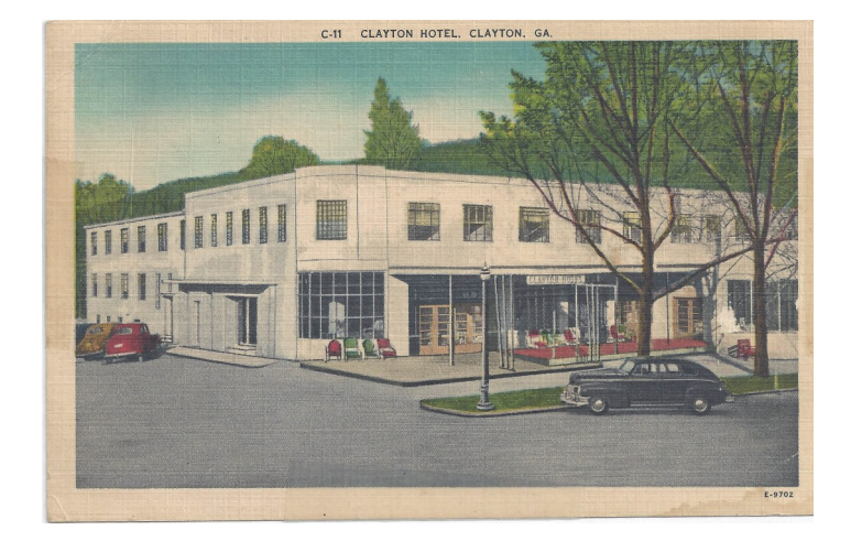
The Clayton Hotel company rebuilt an "ultra-modern" structure of steel, concrete and glass which would accommodate 150 guests in its spacious dining room. The formal opening was in October of 1947.