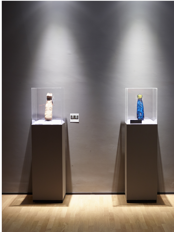
Figure 21. The mummy cat and its copy in the Museum des Beaux-Arts in Rennes.