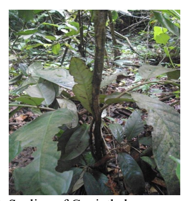
Figure 3. Sapling of Goniothalamus macrophyllus

The highest INP value at the sapling level is Decapermum paniculatum with a value of 47.62% at an altitude of 432 m asl., While the lowest INP value is Ki Surarung with a value of 18.83% at an altitude of 859 m asl. G. macrophyllus at dominant sapling level at an altitude of 864 m asl., 997 m asl., And 1,175 m asl. with respective values of 26.21%, 44.48%, and 33.69%. sapling of G. macrophyllus can be seen in Figure 3.