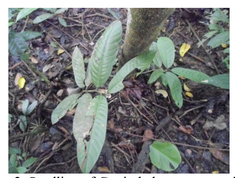
Figure 2. Seedling of Goniothalamus macrophyllus

The highest INP value at the seedling level is Coffea spp. with a value of 141.46% at an altitude of 695 m above sea level, while the lowest INP value was G. macrophyllus with a value of 20.51% at an altitude of 859 m asl. G. macrophyllus at seedling level is dominant at an altitude of 442 m asl, 859 m asl, and 1,175 m asl. with respective values of 25.58%, 20.51%, and 29.28%. G. macrophyllus seedlings can be seen in Figure 2.