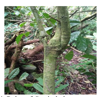
Figure 4. Poles of Goniothalamus macrophyllus

The highest INP value at the pole level was Villebrunea rubenscens with a value of 248.83%, while the lowest INP value was Maesopsis eminii with a value of 7.05. At the pole level G. macrophyllus did not dominate. Poles of G. macrophyllus can be seen in Figure 4.