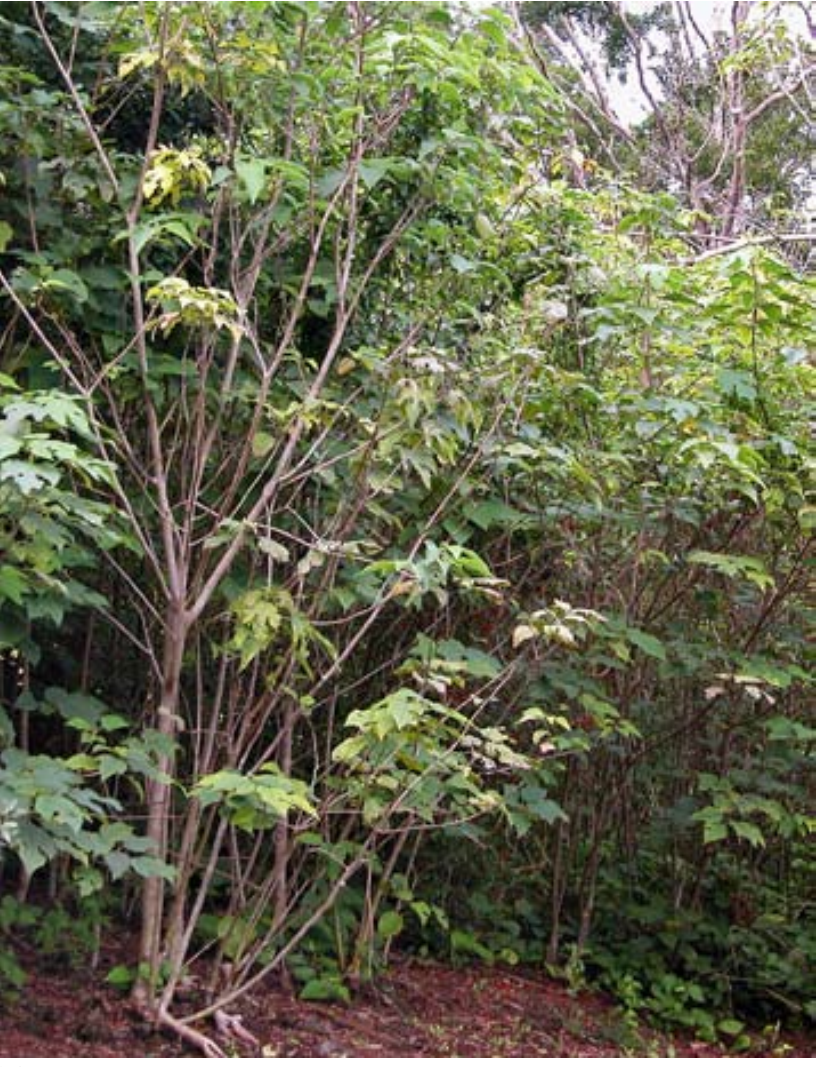
This planting has survived for decades at Manukā State Park, Ka'u, Hawai'i, with little care and long droughts.

It prefers light and medium soils, although it tolerates pe-