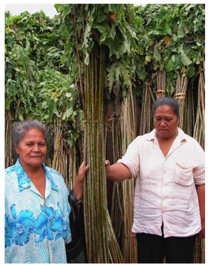
Paper mulberry stems are sold at the central market in Nuku'alofa, Tonga.

riodic waterlogging. The plant grows best with continuous soil moisture.