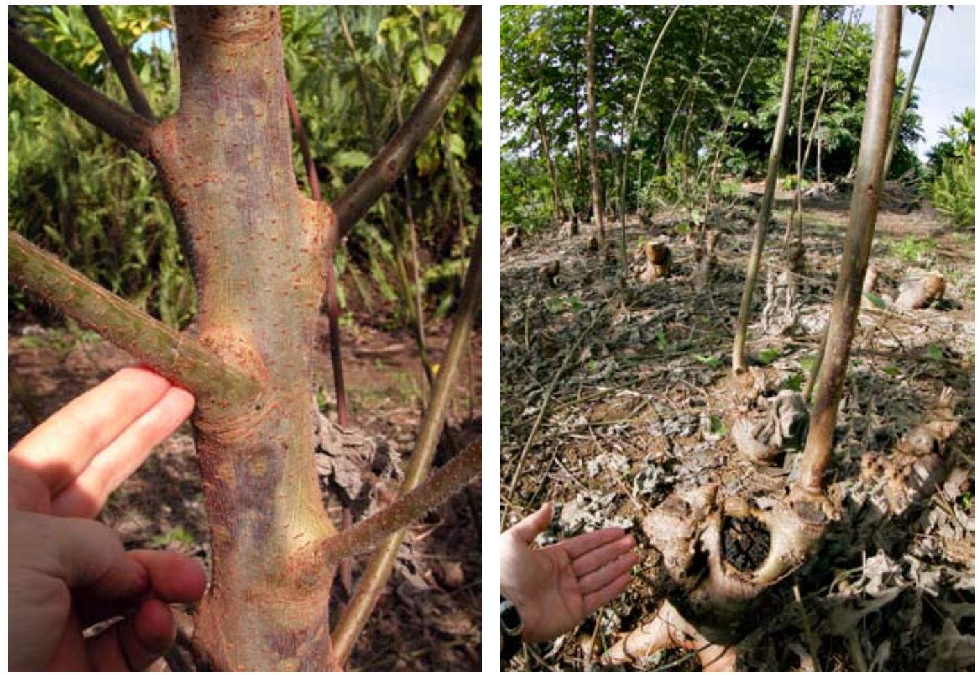
Left: Side branches should be removed when they are very small, as woody branches such as these will cause holes in the main stem bark. Right: Thinned stand of paper mulberry with side branches removed.

aouta [ aute ], in regular rows, at the distance of about 18 inches, or two feet..." In Fiji, Seemann (1865) noted the tree is "propagated by cuttings, and grown 60–90 cm (2–3 ft) apart, in plantations resembling nurseries. For the purposes of making cloth it is not allowed to become higher than about 4 m [13 ft] and about 4 cm [1.6 in] in diameter." In Hawai'i, plantations of paper mulberry were often surrounded by enclosures of dry banana leaves to protect the plants while they were young, and plantings of it were often surrounded by stone walls in the Marquesas.