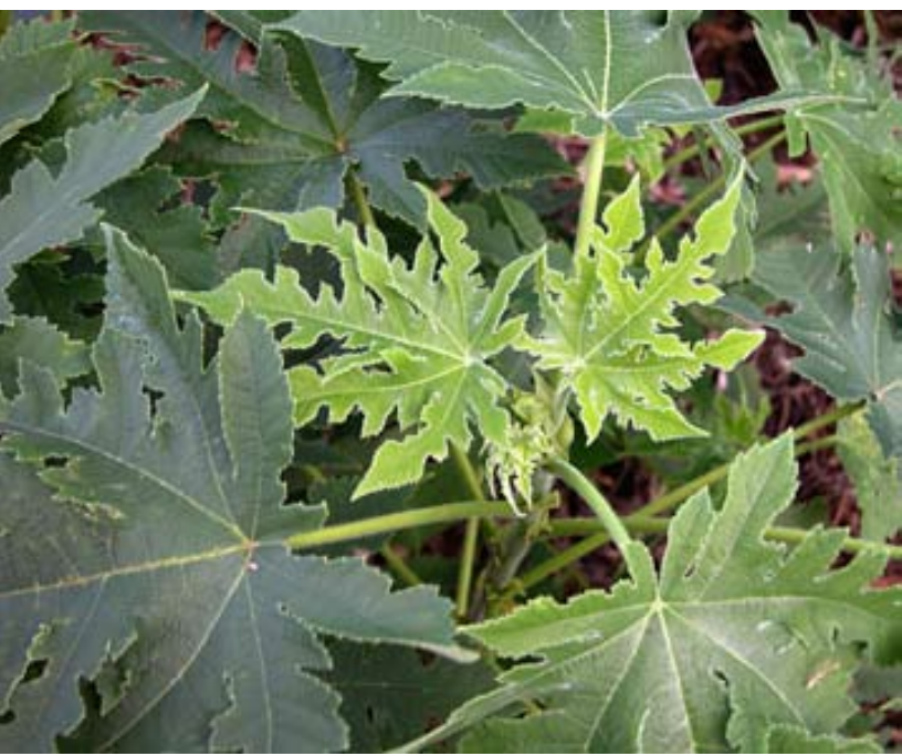
Paper mulberry leaves.

No varieties are reported. However, the ancient Polynesian plants are all male clones of the species, and it has been noted that Hawaiians used at least three terms to describe cultivars or forms of the plant (Meilleur et al. 1997).