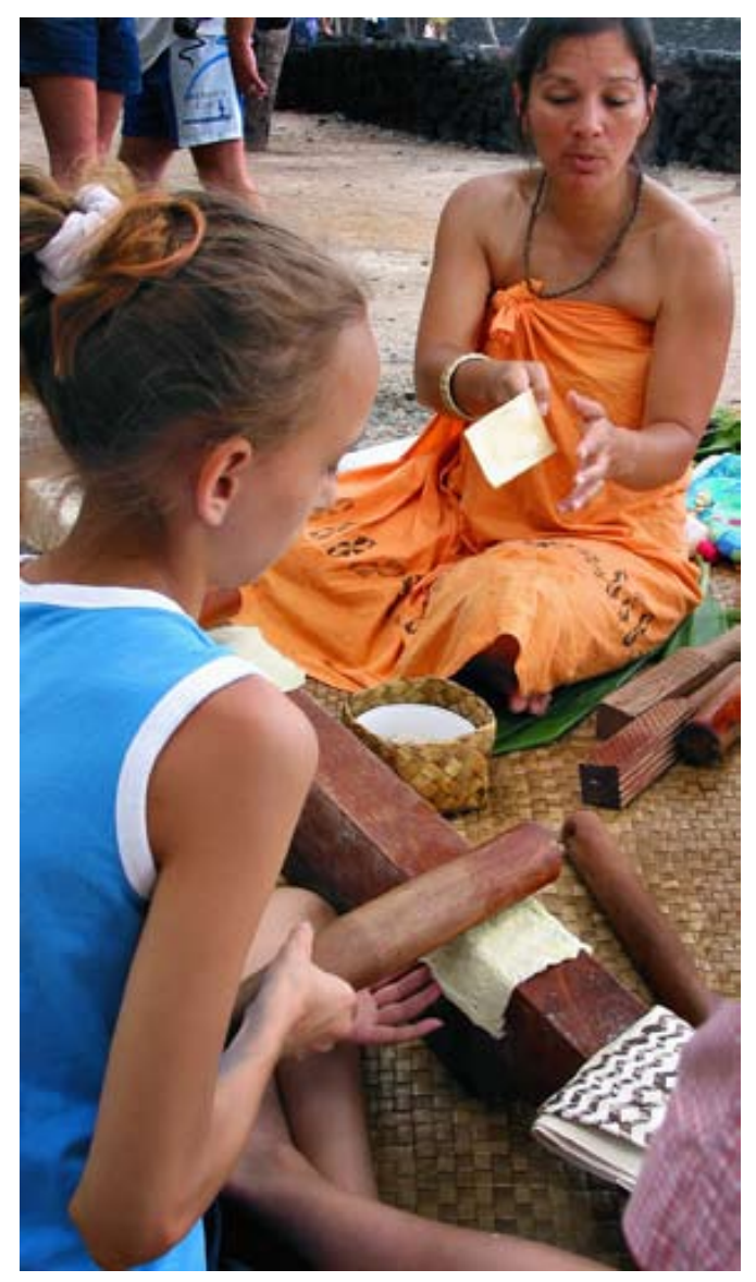
The traditional art of tapa making is being rediscovered in Hawai'i, as at this cultural demonstration at Pu'uhonua o Hōnaunau, Kona, Hawai'i.

nized on islands and archipelagoes where its bark is no longer fashioned into tapa cloth (i.e., in most of Polynesia except Tonga, Samoa, and Fiji). It is now recognized as a culturally significant plant in Hawai'i, however, which has led to a renewed interest in its cultivation. On the U.S. mainland, where both fertile male and female trees have been introduced, it is found from Illinois to Massachusetts, south to Florida and west to Texas. The tree is reportedly naturalized in Burma and Thailand.