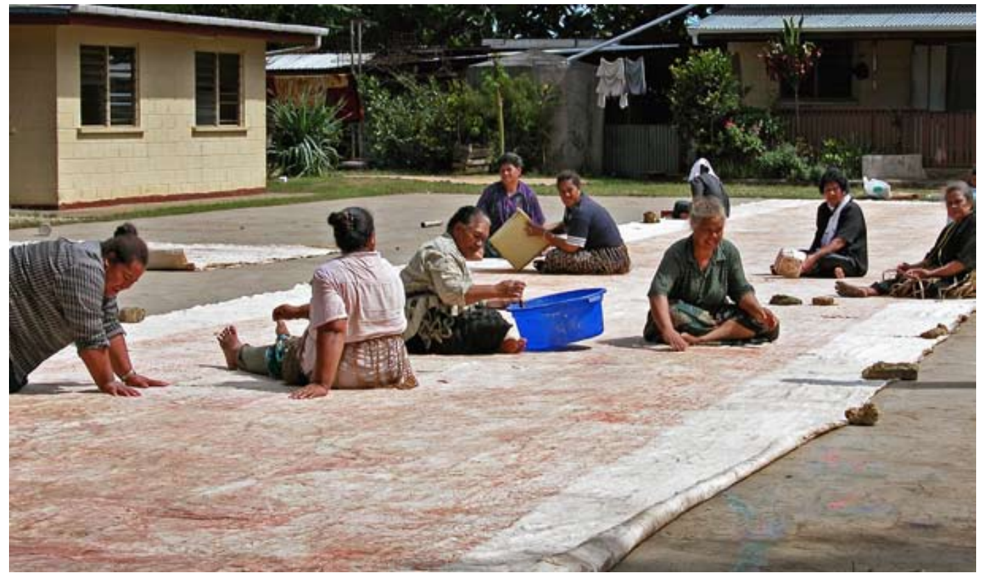
Tapa making remains a very important part of Tongan culture. Pieces of tapa are much valued as gifts to be given by Tongans on special occasions. Nuku'alofa, Tonga.