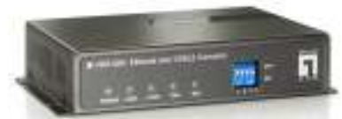
VDS-0201 (Annex B)

For networks that utilize ISDN telephone systems.