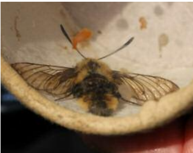
Narrow-bordered Bee Hawkmoth - Ashford Hill 30 May 2015