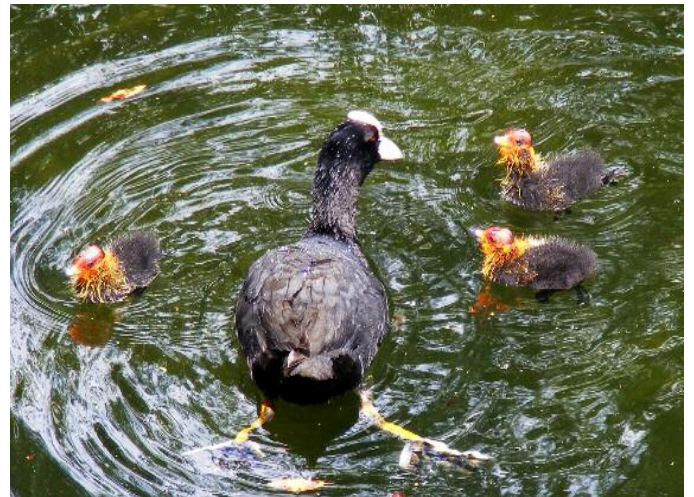
Coot and Cootlets at Kew Gardens Winner: Little and Large