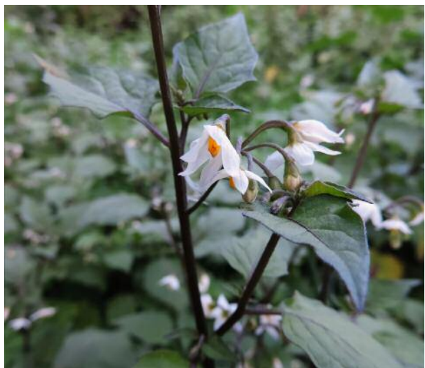
Black Nightshade - Ufton Nervet 25 Oct 2015