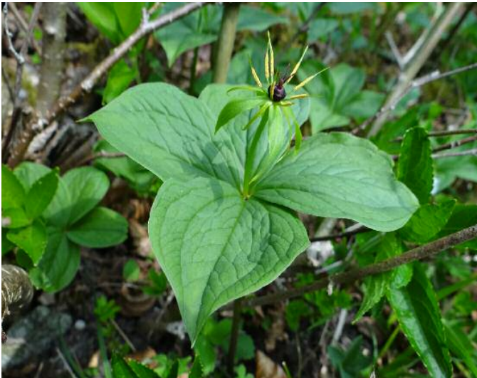
Herb Paris - Warburg 26 Apr 2015