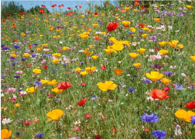
'Pollinator Bed', Earley -Rainbow seed mix Winner: Colour Prejudice