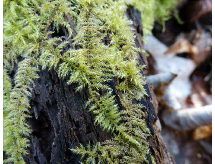
Kindbergia Praelonga - Swyncombe 21 Mar 2015