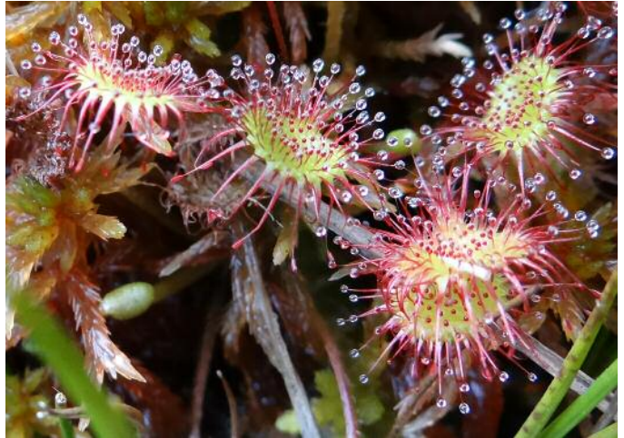
Round Leaved Sundew - Snelsmore Common Winner: Pattern Perfect