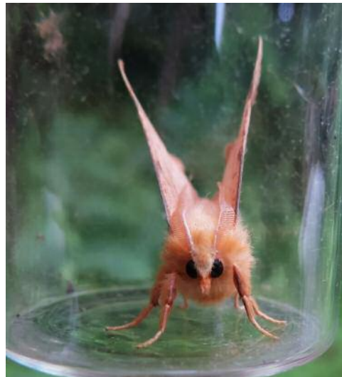
September Thorn - Snelsmore 15/16 Aug 2015