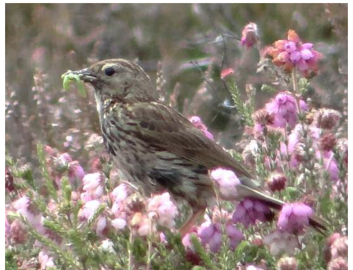
Tree Pipit - Arne 27 Jun 2015