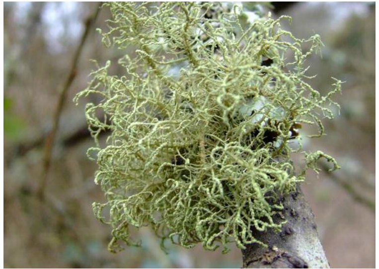
Lichen Report - Usnea Esperantiana - Prospect Park