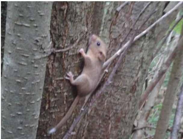
Dormouse - Moor Copse