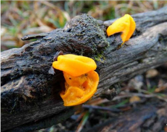
Yellow Brain Fungus - Silchester 21 Jan 2015