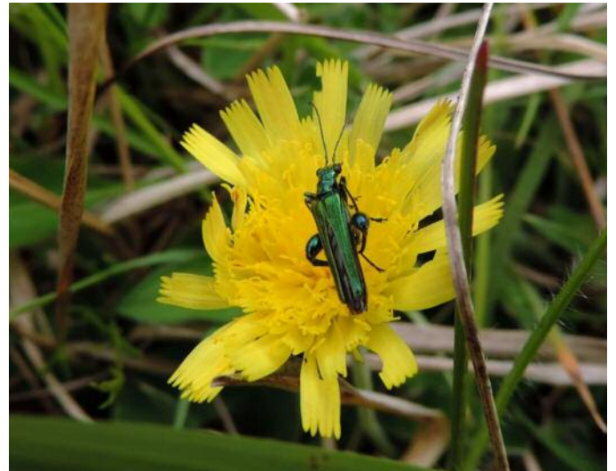
Swollen-thighed Beetle - Hartslock 20 May 2015