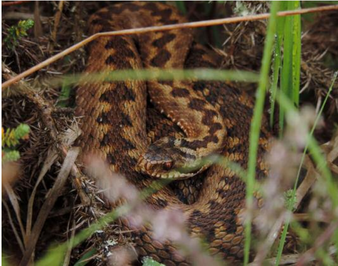
Female Adder- Hazeley Heath 15 Jul 2015