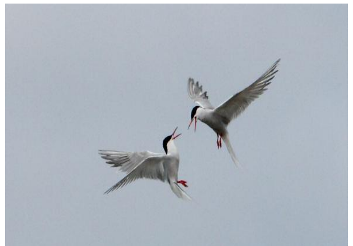
Arguing Terns, June 2012 at RSPB Minsmere Winner: Nature in Action