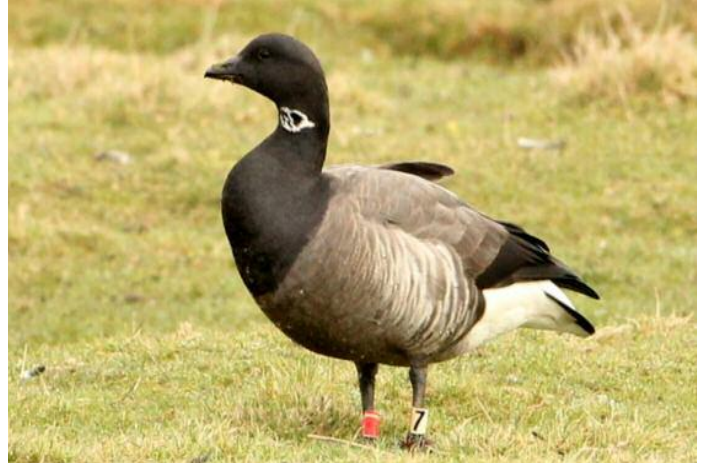
Brent Goose - Farlington Marshes 10 Jan 2015