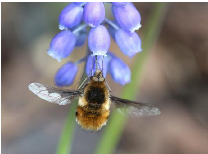
Bee Fly feeding on Grape Hyacinth Winner: Small is Beautiful