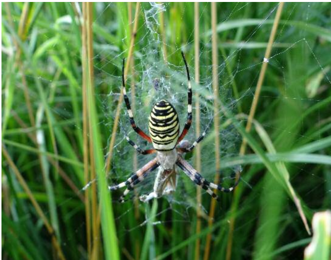
Wasp Spider - Fobney Island Meadows 9 Aug 2015