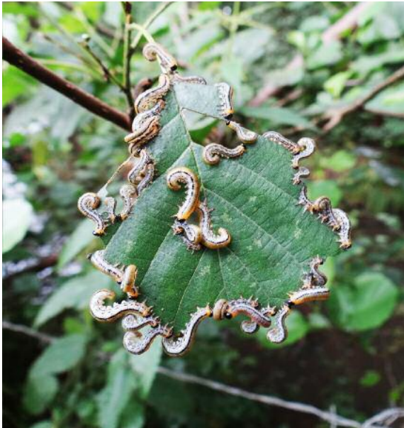
Tasty leaf - Hazeley Heath Winner: Something to Make You Smile