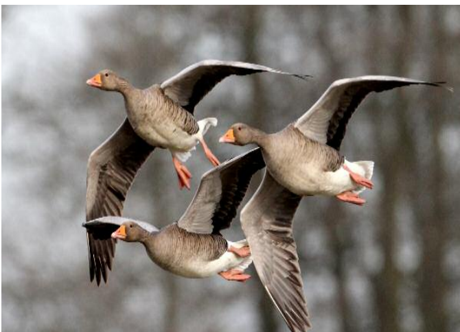
Greylag Geese, January 2014 at WWT Slimbridge Winner: Three of a Kind