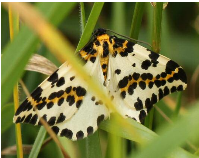
Magpie Moth - Ewelme 19 Aug 2015