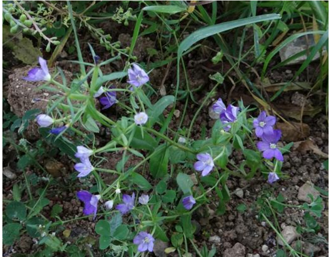
Large Venus's Looking Glass - Malshanger 18 Jul 2015