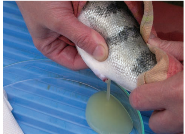
Figure 1. Pikeperch (left) and Volga pikeperch (right) egg stripping

than that of the pikeperch ( Sander lucioperca ), the Volga pikeperch starts its predatory activity later.