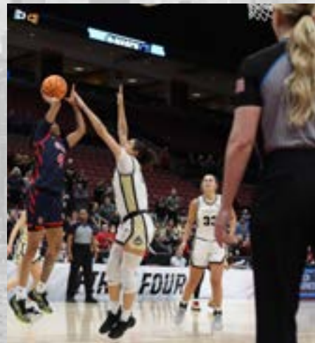
ST. JOHN'S WOMEN'S BASKETBALL