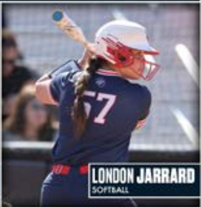
LONDON JARRARD SOFTBALL