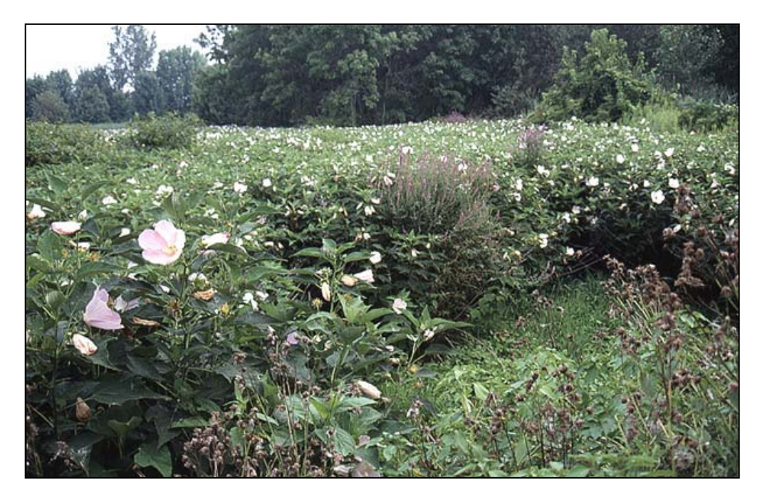
Figure 4. Habitat of Hibiscus moscheutos at Willowood East.

A direct apparent impact of this degrading habitat on Hibiscus , has been the rise of Phragmites , which is exploiting the artificially high nutrients entering the system. Phragmites likely out-competes Hibiscus in this altered environment, unless periodic flooding occurs. A similar situation has likely occurred with Typha X glauca .