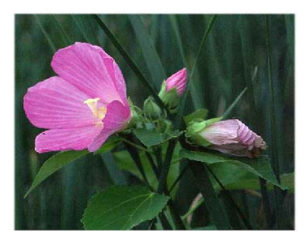
Figure 1. Hibiscus moscheutos flower (photo, Bruce Ford).