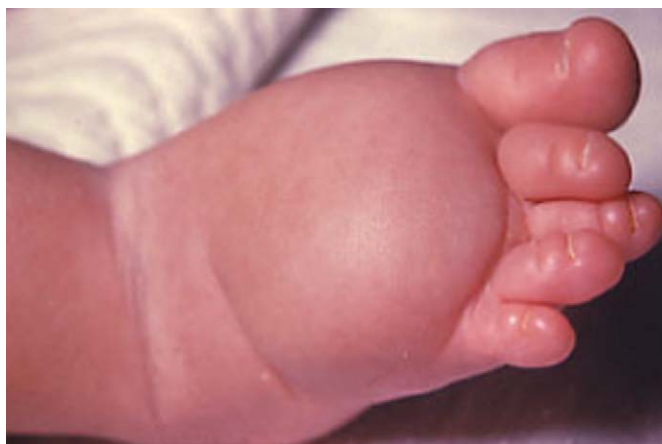
Figure 4 Edema of the foot in Turner syndrome.

facial features and presence of congenital heart defect are the findings that lead most often to the diagnosis. The classical lesion is pulmonary valve stenosis, but hypertrophic cardiomyopathy and a variety of other defects can also occur. Facially, the typical patient has low-set and mildly dysplastic ears, down-slanting palpebral fissures and ptosis. A short or webbed neck and pectus excavatum/carinatum are also typical. Non-life-threatening renal anomalies are seen, and disorders of lymphatic vessels are more common. 15