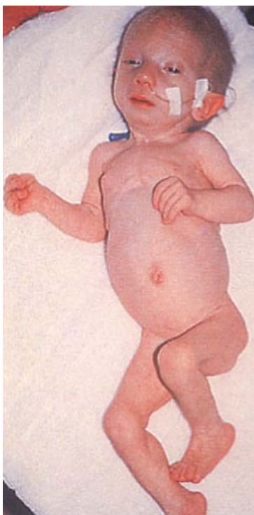
Figure 3 Growth retardation, microcephaly, short palpebral fissures, ptosis, micrognathia, short sternum, clenched hands and rocker-bottom feet in trisomy 18.

with or without cleft palate. The typical baby with trisomy 18 will have microcephaly, malformed ears, a prominent occiput and a small mouth and jaw. Other birth defects in trisomy 13 include heart defects, albeit not usually life-threatening ones, omphalocele, postaxial polydactyly, microphthalmia/anophthalmia, cutis aplasia, cryptorchidism and holoprosencephaly. Trisomy 18 can have many of the same anomalies, but eye and skin malformations are less common, whereas neural tube and limb reduction defects are more common. A very large number of other anomalies have been reported in association with these trisomies. The recurrence risk for non-dysjunction trisomy 13 and 18 is no more than 1%. Families have been described with anomalies suggesting trisomy 13 or trisomy 18 but with normal chromosomes – recurrences in subsequent pregnancies have suggested an autosomal recessive condition. The literature more strongly supports a mendelian phenocopy of trisomy 13. 9