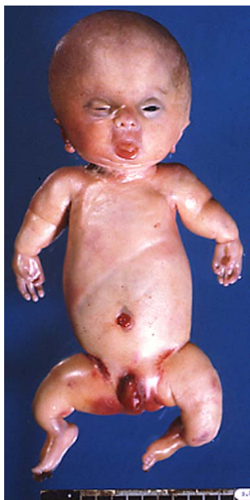
Figure 7 Short limb dwarfism in type II osteogenesis imperfecta.

Although occasional exceptions occur, osteogenesis imperfecta is generally caused by dominant