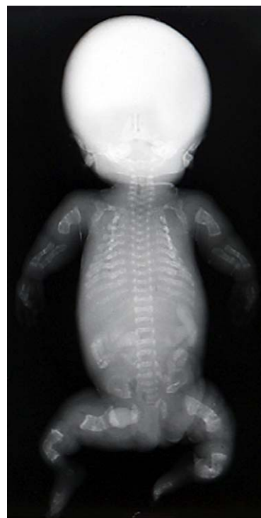
Figure 8 Short, broad long bones and multiple fractures in type II osteogenesis imperfecta.

mutations encoding type I collagen. 35 Osteogenesis imperfecta can usually be confidently diagnosed on the basis of the nature of the type I collagen abnormality seen in cultured skin fibroblasts. The more severe types of osteogenesis imperfecta are characterised by qualitative defects of type I collagen. Blood samples for DNA studies of the type I collagen gene are becoming more common.