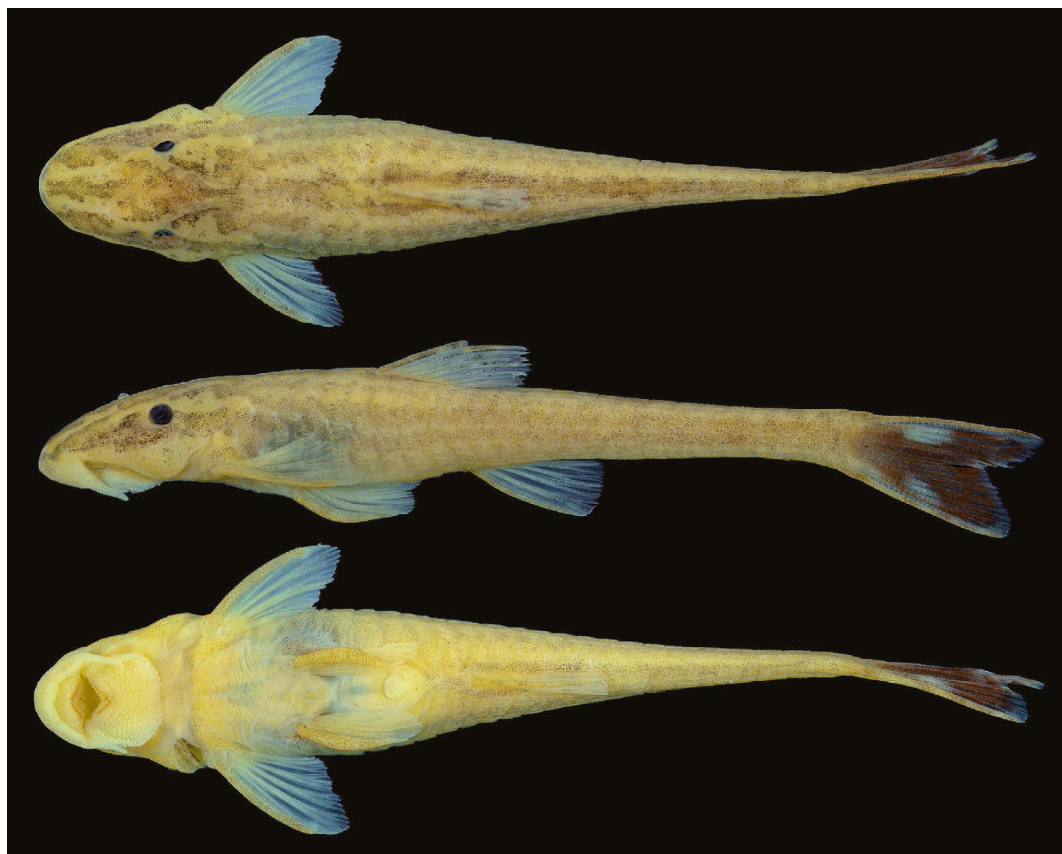
Fig. 1. Microlepidogaster discontenta , holotype, MCP 48107, female, 36.5 mm SL; Brazil: Goiás: córrego Arrependido.