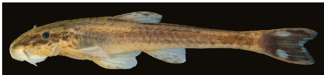
Fig. 2. Color pattern of Microlepidogaster discontenta , paratype, MCP 47391, male, 35.6 mm SL; Brazil: Goiás: córrego Arrependido.

arranged in longitudinal lines (vs. odontodes on the caudal peduncle not arranged in longitudinal lines) and a shorter pectoral-pelvic fins distance (10.6–12.8 vs. 13.0–18.7 % SL). It further differs from all congeners, except M. longicolla , by having a wide naked area on the tip of the snout (Fig. 3; vs. an inconspicuous naked area or a rostral plate); and the anterior portion of the compound