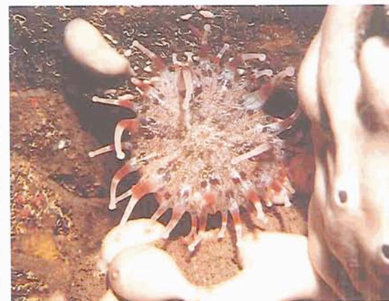
Figs. 2-7: 2. Colour morph "green", Madeira; 3. Colour morph "blue-white", Tenerife; 4. Individual from Gran Canaria; 5. Individual from Lanzarote; 6. Individual from Gran Canaria; 7. Individual from Tenerife.