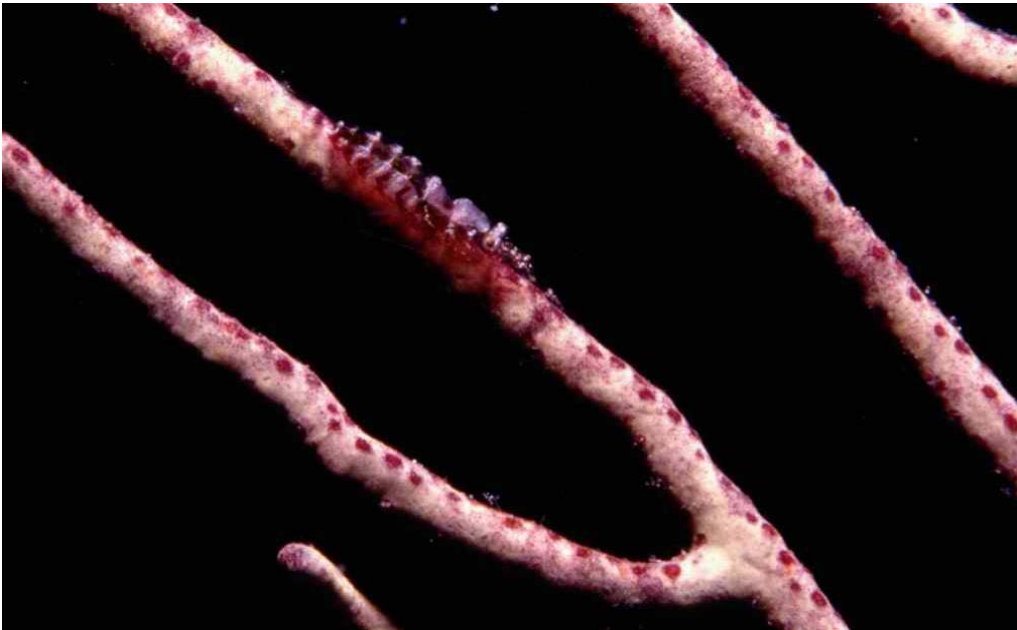
Fig. 2. Pseudocoutierea wirtzi on Leptogorgia , at Mosteiros, Príncipe Island.