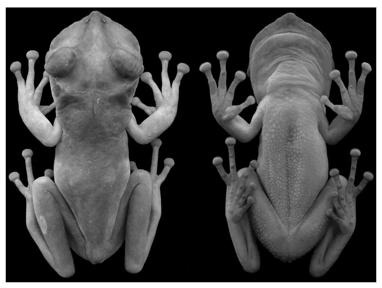
FIGURE 1. Aparasphenodon arapapa sp. nov. , holotype, UFBA 3948, adult male, 58.1 mm SVL. Left, dorsal view; right, ventral view.

Diagnosis. Species characterized by the following combination of traits: (1) size small (male SVL 57.4–58.1 mm); (2) head longer than wide, its length 2.6 times smaller than snout-vent length; (3) canthus rostralis curved, rounded, poorly elevated, not outlining straight sharp ridges; (4) loreal region flattened, slightly concave, its greater diameter wider than the larger distance between the canthi rostrales; (5) maxilla expanded laterally; (6) eye large (ED/SVL 0.1), directed forward; (7) tympanum medium-sized, nearly circular, its width 1.9-2.4 times smaller than eye diameter; (8) supratympanic fold developed, partially covering the tympanum; (9) nostrils superolateral; (10) internarial region furrowed, laterally and anteriorly delimited by two bony crests; (11) skin of the dorsal surfaces of the skull poorly co-ossified with underlying bone; (12) fingers lacking webbing; (13) legs short, sum of thigh and tibia lengths 78-82 % of snout-vent length; (14) toes poorly webbed.