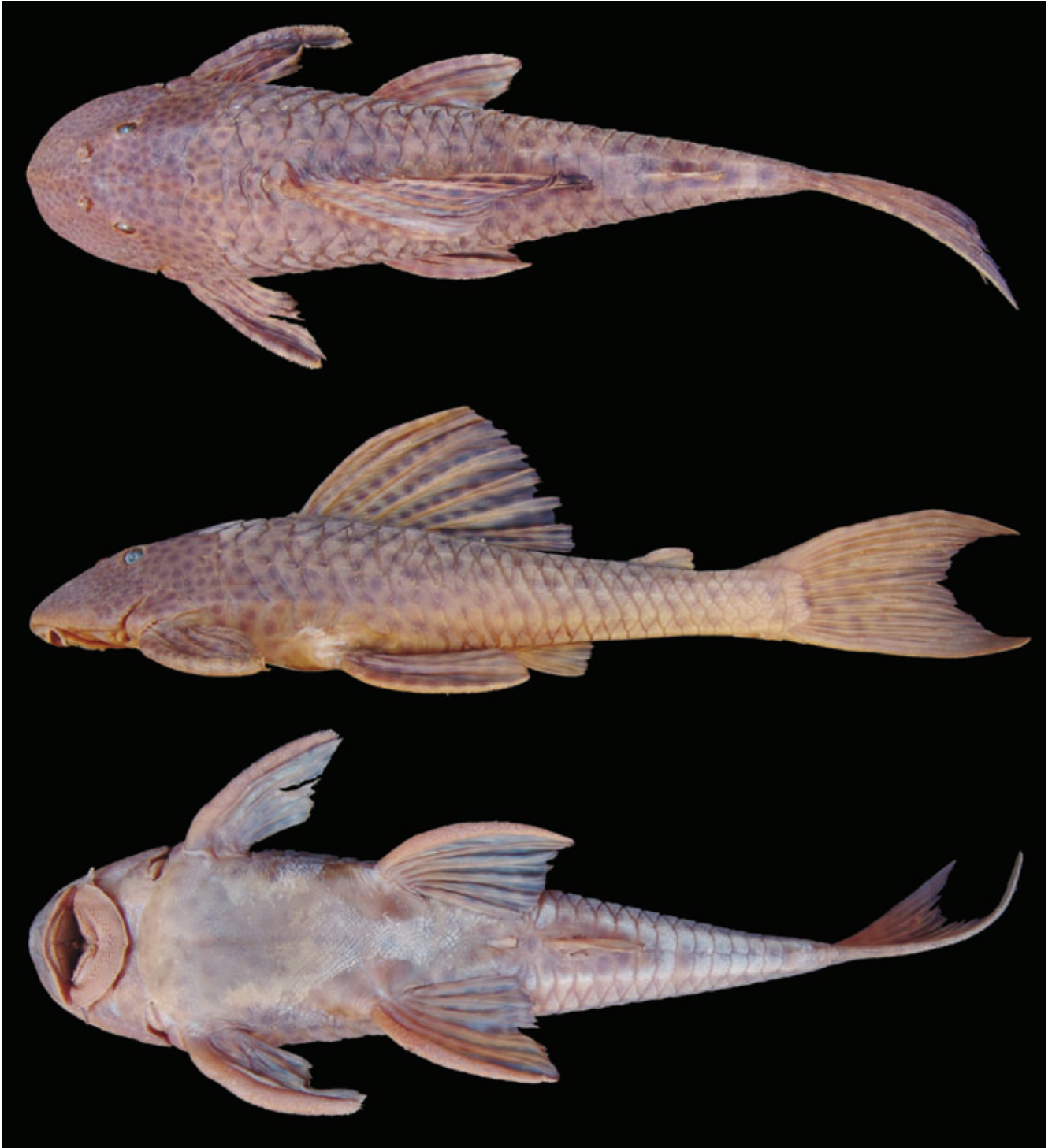
Fig. 4. Hypostomus derbyi , NUP 677, 230.6 mm SL, Salto Caxias reservoir, rio Iguaçu, Municipality of Capitão de Leônidas Marques/Nova Prata do Iguaçu, Paraná, Brazil.

near its foz at Caxias reservoir, Municipality of Cruzeiro do Iguaçu/Nova Prata do Iguaçu, 25°34'27"S 53°05'49"W, 20 Jan 1999, Nupélia. NUP 1828, 7, 184.0-224.0 mm SL, Salto Caxias reservoir, rio Iguaçu, Municipality of Capitão de Leônidas Marques/Nova Prata do Iguaçu, 25°32'12"S 53°29'11"W. Nupélia. NUP 2541, 6, 129.8-270.0 mm SL, Foz do Areia reservoir, rio Areia, Municipality of Cruz Machado/Bituruna, 26°00'05"S 51°39'23"W, 27 Oct 1998, Nupélia. NUP 2542,