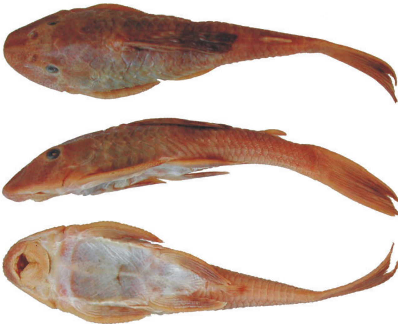
Fig. 3. Holotype of Hypostomus derbyi , FMNH 54246, 90.5 mm SL, Porto União da Victoria, currently Municipality of União da Vitória, rio Iguaçu, Paraná, Brazil.

1944, G. S. Myers & A. L. Carvalho. NUP 151, 2, 186.9-207.4 mm SL, mouth of rio Chopim, Municipality of Cruzeiro do Iguaçu/São Jorge do Oeste, 25°34'28"S 43°04'24"W, 5 Aug 1999, Copel. NUP 555, 1, 130.4 mm SL, Cavernoso reservoir, rio Cavernoso, Municipality of Virmond/Laranjeiras do Sul, 23-24 Aug 1999, Copel. NUP 585, 5, 184.6-268.0 mm SL, Jordão reservoir, rio Jordão, Municipality of Foz do Jordão/Reserva do Iguaçu, 25°45'13"S 52°05'09"W, 14 Oct 1995, Copel. NUP 586, 2, 234.0-240.0 mm SL, Jordão reservoir, rio Jordão, Municipality of Foz do Jordão/Reserva do Iguaçu, 25°45'13"S 52°05'09"W, 14 Oct 1995, Copel. NUP 587, 8, 149.0-207.3 mm SL, Jordão reservoir, rio Jordão, Municipality of Foz do Jordão/Reserva do Iguaçu, 25°45'13"S 52°05'09"W, 14 Oct 1995, Copel. NUP 677, 2, 228.3-230.6 mm SL, Salto Caxias reservoir, rio Iguaçu, Municipality of Capitão de Leônidas Marques/Nova Prata do Iguaçu, 25°32'12"S 53°29'11"W, 13 Aug 1997, Nupélia. NUP 679, 5, 274.0-339.0 mm SL, Salto Caxias reservoir, rio Iguaçu, Municipality of Capitão de Leônidas Marques/Nova Prata do Iguaçu, 25°32'12"S 53°29'11"W, 13 Aug 1997, Nupélia. NUP 715, 5, 47.9-58.0 mm SL, Salto Caxias reservoir, rio Iguaçu, Municipality of Capitão