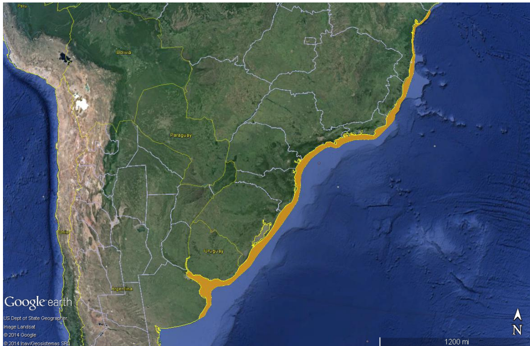
Figure 1. The range of the Brazilian guitarfish from Bahia, Brazil, to Mar del Plata, Argentina, based on information gathered in this review.

Lessa and Vooren 2005, 2007, GBIF Database). The majority of the population is concentrated between 28° and 34°S. Newborns and juveniles live year round in coastal waters less than 20 m deep. Adults coexist with immature individuals in shallow waters between November and March, when pupping and mating occurs, but spend the rest of the year offshore in waters greater than 40 m depth. In the winter, individuals can be found in water temperatures as low as to 9°C, while the average summer water temperature individuals are found in is 26°C (Lessa and Vooren 2005). Brazilian guitarfish are commonly found in salinities ranging from 24-28 ppt in northern Argentina (Jaureguizar et al. 2006).