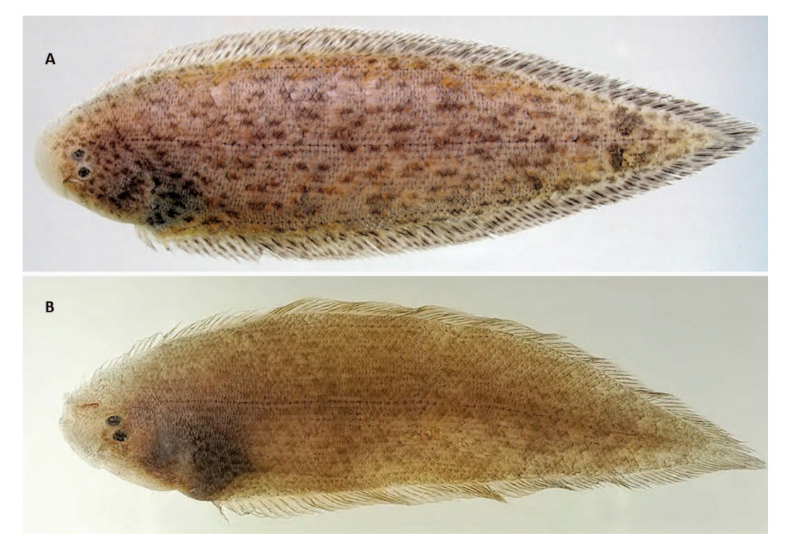
Fig. 2. Comparison of color patterns and body shapes between Cynoglossus nanhaiensis , new species, and C. maccullochi (CSIRO H6548-01) taken off Queensland, Australia.

mm SL; 01 May 2011. SCF2011196; female, 115.5 mm SL; 01 May 2011. SCF2011197; male, 123.2 mm SL; 01 May 2011. SCF2011187; female, 120.1 mm SL; 01 May 2011. SCF2011199; female, 109.2 mm SL; 01 May 2011. SCF2011200; female 105.7 mm SL; 01 May 2011. SCF2011186; female, 129.0 mm SL; 01 May 2011. SCF2011188; female, 120.2 mm SL; 03 Jan 2010. SCF2011205; male, 122.8 mm SL; 24 Nov 2011. SCF2011206; male, 127.1 mm SL; 24 Nov 2011. SCF2011207; male, 143.2 mm SL; 24 Nov 2011. SCF2011209; male, 131.5 mm SL; 24 Nov 2011. SCF2011210; male, 126.0 mm SL; 24 Nov 2011. SCF2011211; male, 121.9 mm SL; 24 Nov 2011. SCF2011212; male, 115.1 mm SL; 24 Nov 2011. SCF2011213; female, 128.1 mm SL; 24 Nov 2011. SCF2011214; male, 133.8 mm