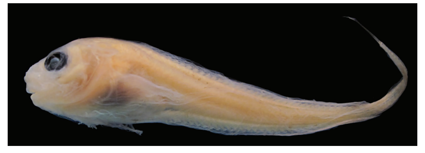
Fig. 1. Careproctus canusocius, new species, holotype, UAM 47901, 81.0 mm SL, Beaufort Sea, U.S.–Canada Transboundary waters, photographed after preservation.

Description. —Body slender, tapering posteriorly to slender tail, moderately compressed, depth at dorsal-fin origin 77.7 (72.8) % HL. Head moderately large, moderately depressed, slightly swollen nape, dorsal profile gradually sloping from nape to snout. Snout rounded, projecting beyond upper jaw. Mouth inferior, moderate in size, maxilla 52.6 (42.6) % HL,