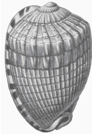
Fig. 1. Cassis testiculus (L.) var. bicincta nov. var. × 2.

lengthwise. In the diagnosis of C. crumena Bruguière (Encycl. méth., Vers, vol. 1, p. 428, 1792) indicates this by saying "plicato tuberculosa"